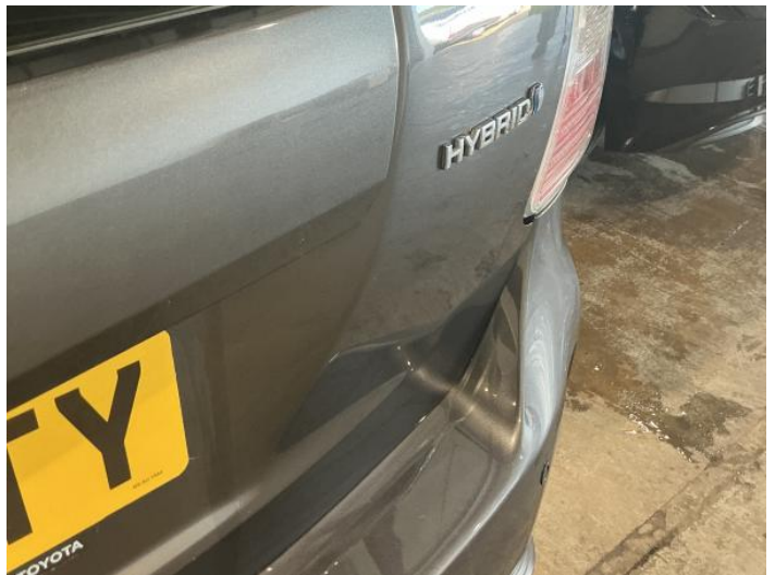
2: Boot Lid Scratched UpTo 25mm Thru Paint