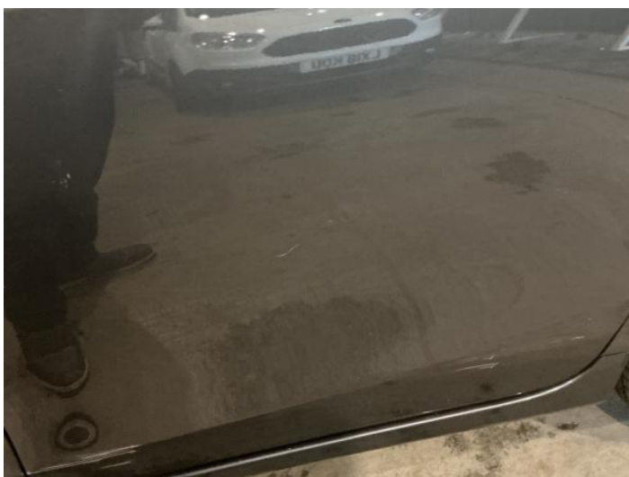
13: Door nsr Dented With Paint Damage