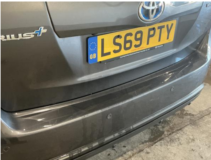
1: Bumper Rear Scratched Over 100mm Thru Paint