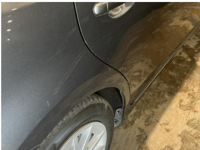
3: Qtr Panel osr Dented With Paint Damage