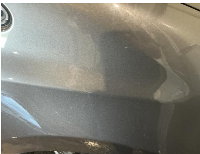
8: Wing osf Chipped 1 To 5