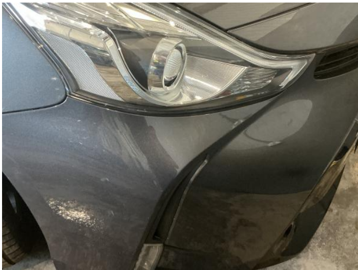
9: Bumper Front Scratched Over 100mm Thru Paint