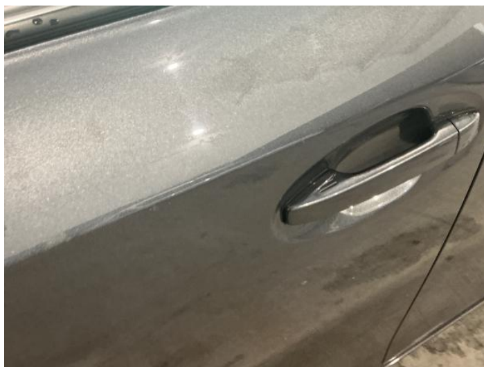
12: Door nsf Chipped Multiple Chips