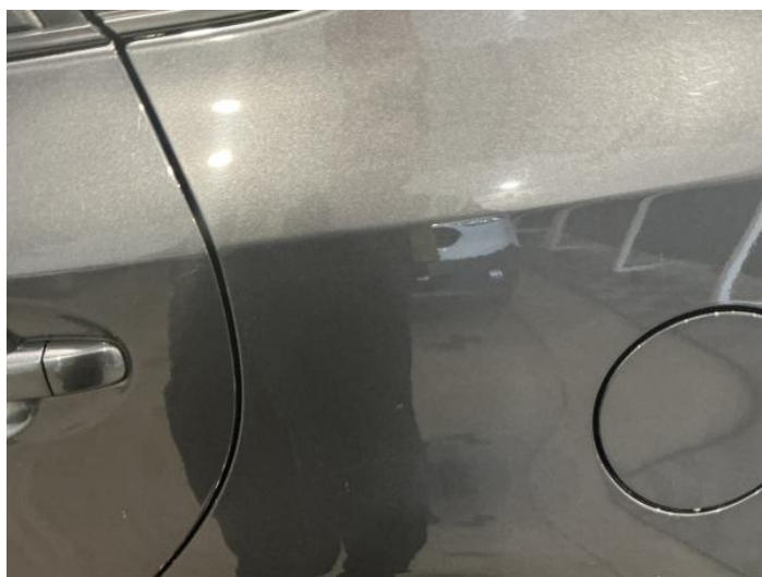
14: Qtr Panel nsr Dented With Paint Damage