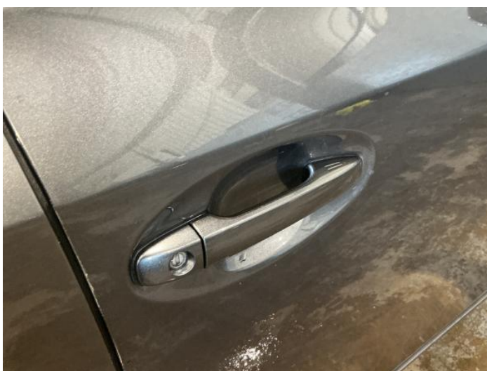
6: Door osf Chipped 1 To 5