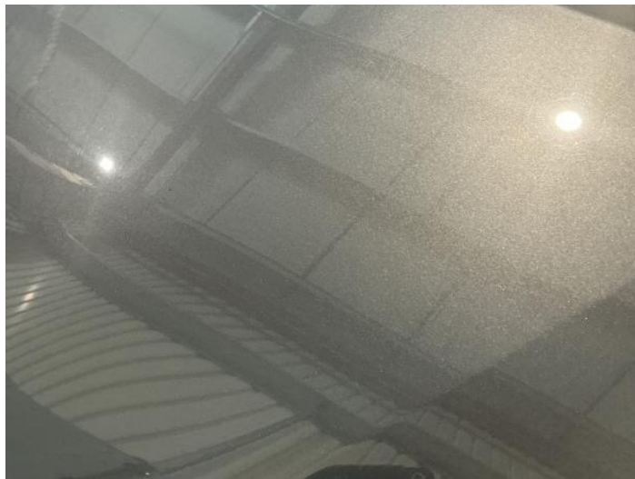
10: Bonnet Dented With Paint Damage