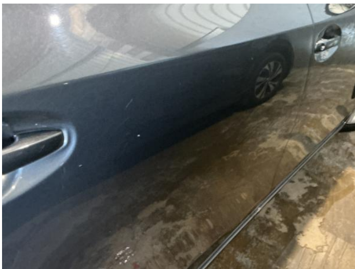
4: Door osr Chipped 1 To 5