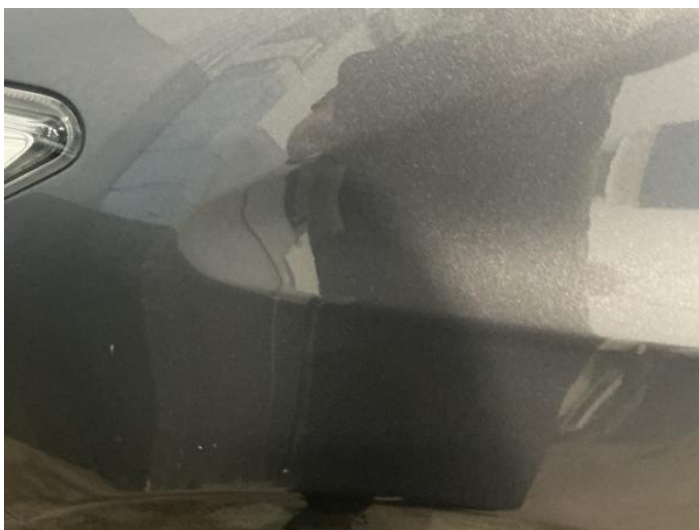
11: Wing nsf Chipped 1 To 5