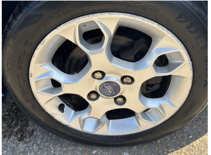
4: Wheel osf Scratched Over 50mm