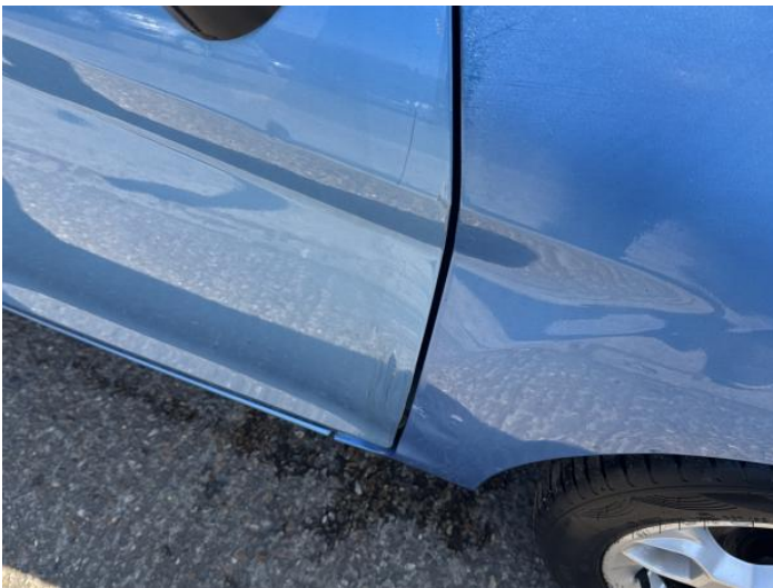
5: Door osf Dented With Paint Damage