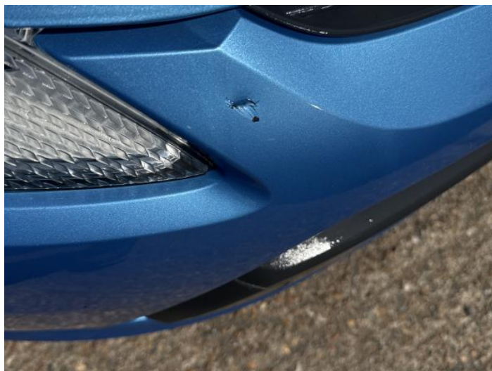
2: Bumper Front Dented With Paint Damage