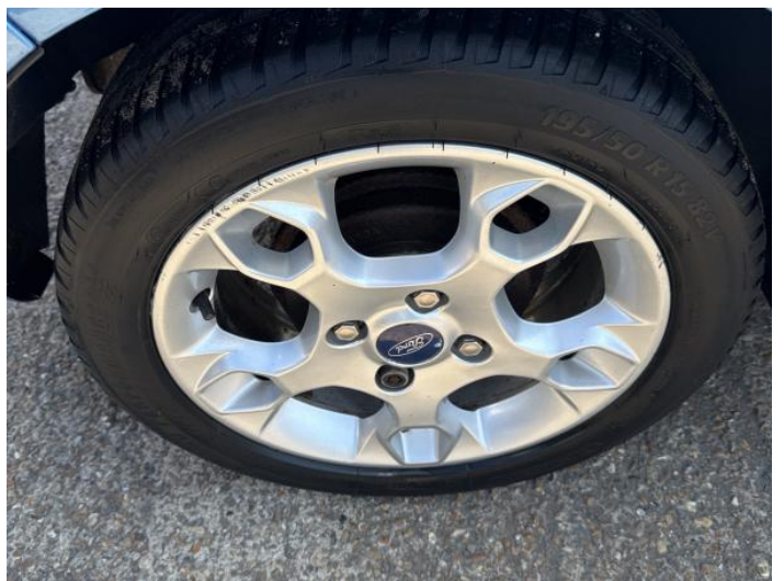
8: Wheel osr Scratched Over 50mm