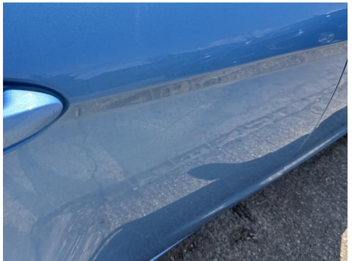
6: Door osf Poor Previous Repair Poor Paint