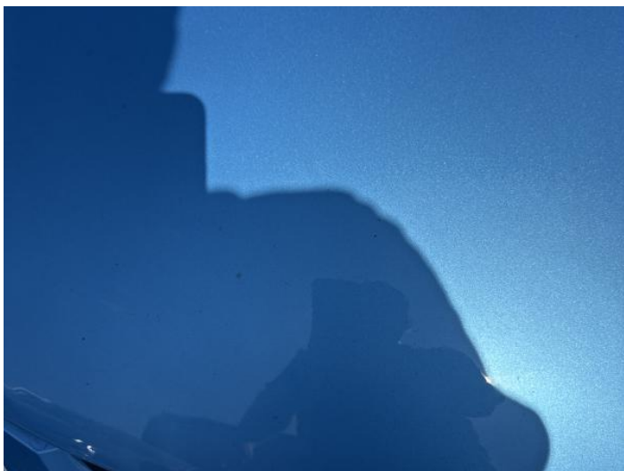
1: Bonnet Chipped 1 To 5