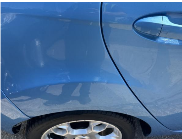
7: Qtr Panel osr Dented With Paint Damage