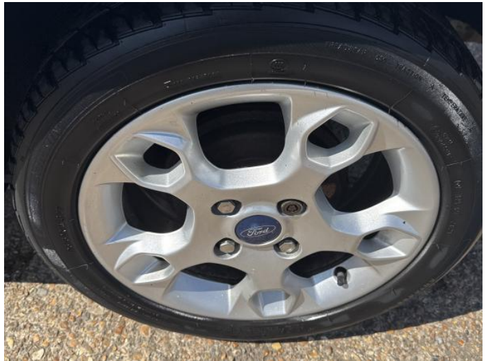
12: Wheel nsr Scratched Up To 50mm