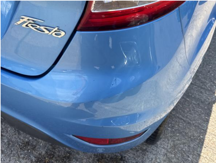
9: Bumper Rear Scratched Over 100mm Thru Paint