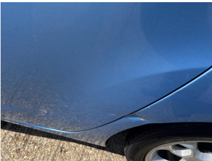
13: Door nsr Dented With Paint Damage