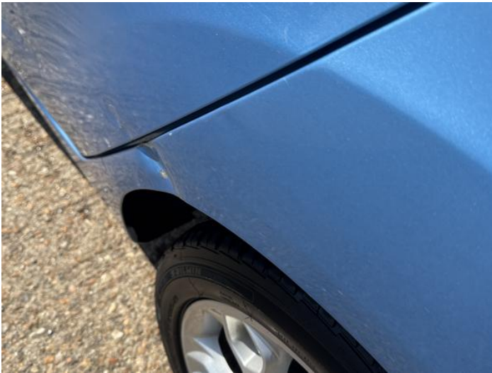
11: Qtr Panel nsr Dented With Paint Damage