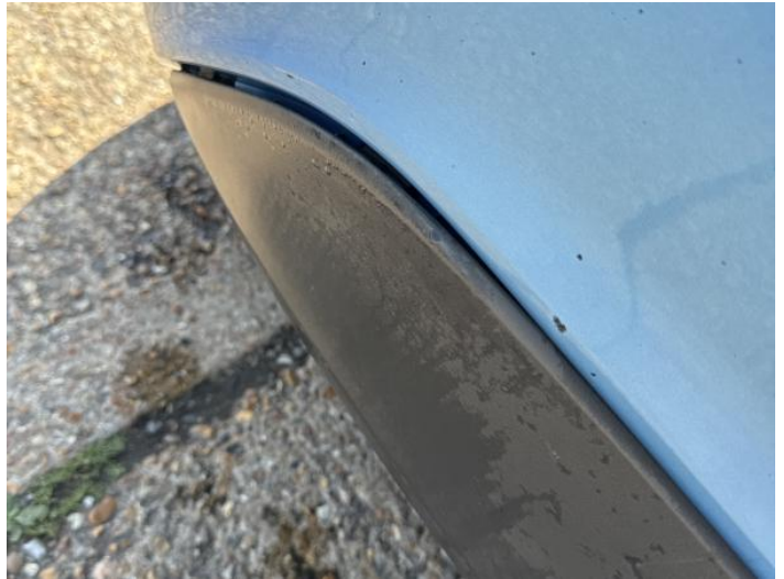
10: Bumper Rear Moulding Broken Replace