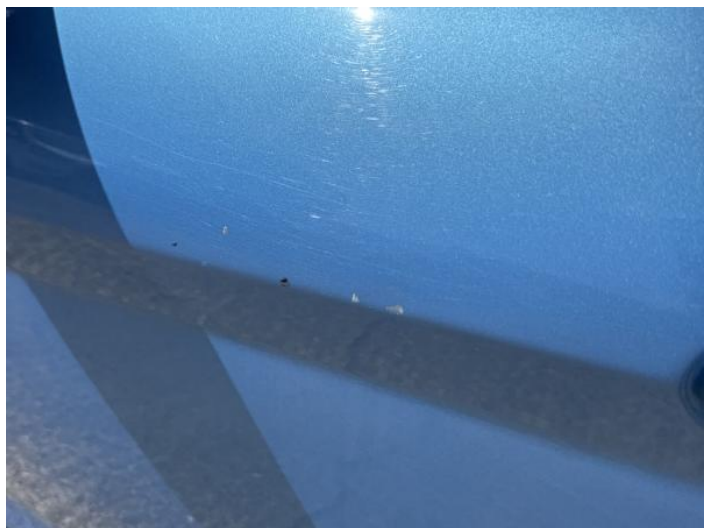
14: Door nsf Chipped Multiple Chips