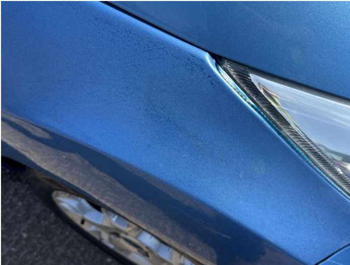
3: Wing osf Dented With Paint Damage