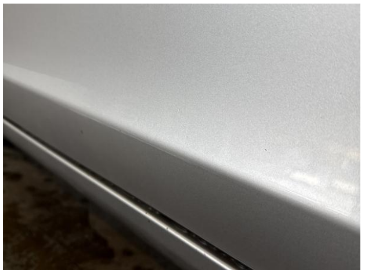
8: Door nsf Scratched Over 25mm Thru Paint