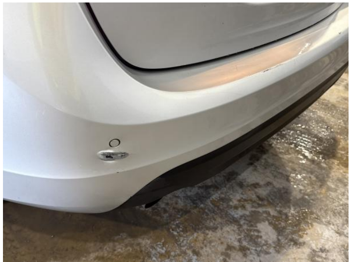
12: Bumper Rear Dented With Paint Damage