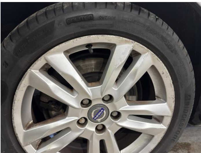
13: Wheel osr Scratched Over 50mm