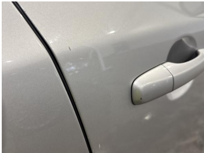
16: Door osf Chipped Over 5mm