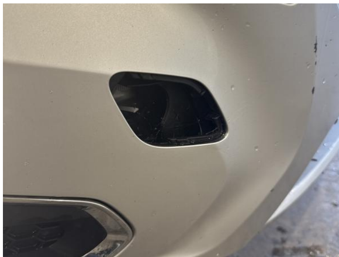
2: Front TowEye Cvr Missing Replace