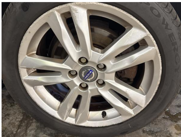
18: Wheel osf Scratched Over 50mm