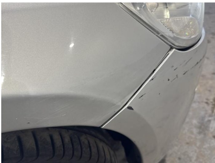
17: Wing osf Dented With Paint Damage