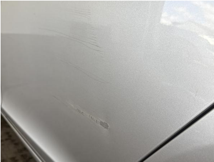
9: Door nsr Dented With Paint Damage