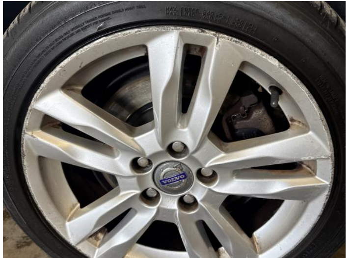
10: Wheel nsr Scratched Over 50mm