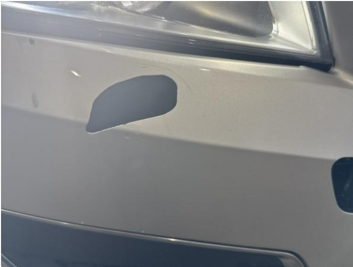
3: Headlamp Washer os Missing Replace