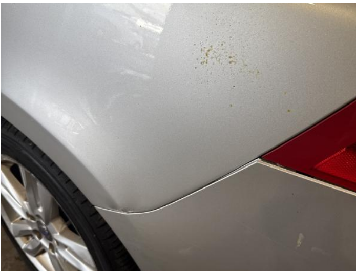
11: Qtr Panel nsr Dented With Paint Damage