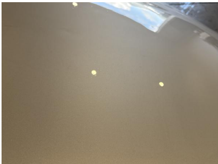
1: Bonnet Dented Over 30mm