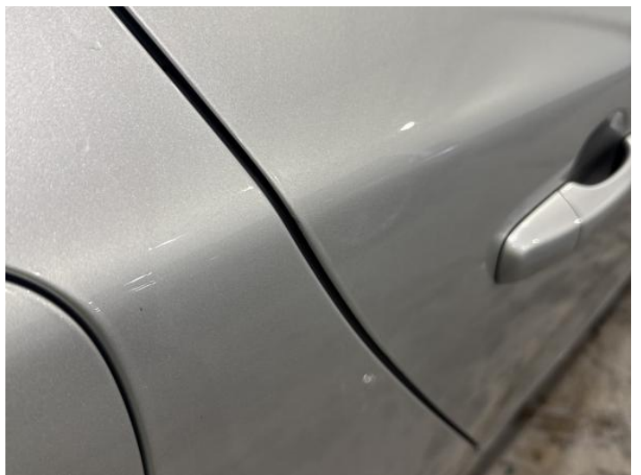
14: Door osr Chipped Edge Chip