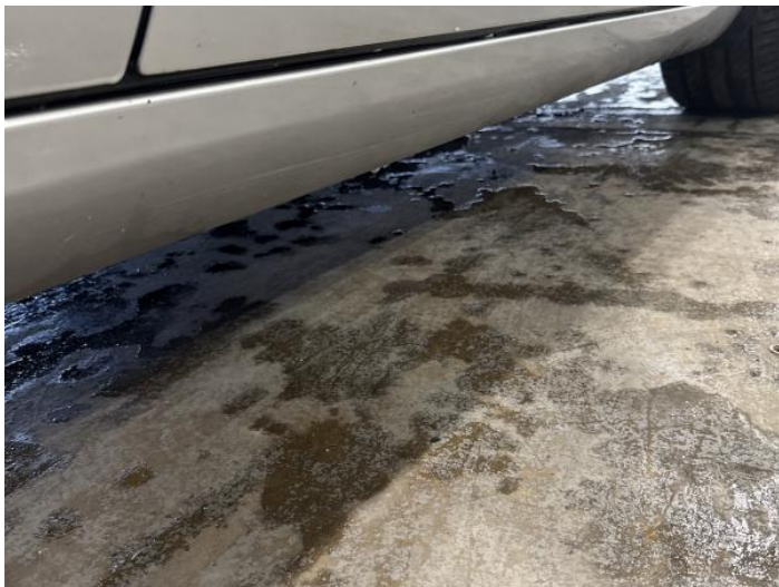
15: Sill os Scratched Over 25mm Thru Paint