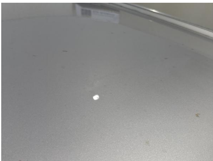
19: Roof Dented Between 10mm + 30mm