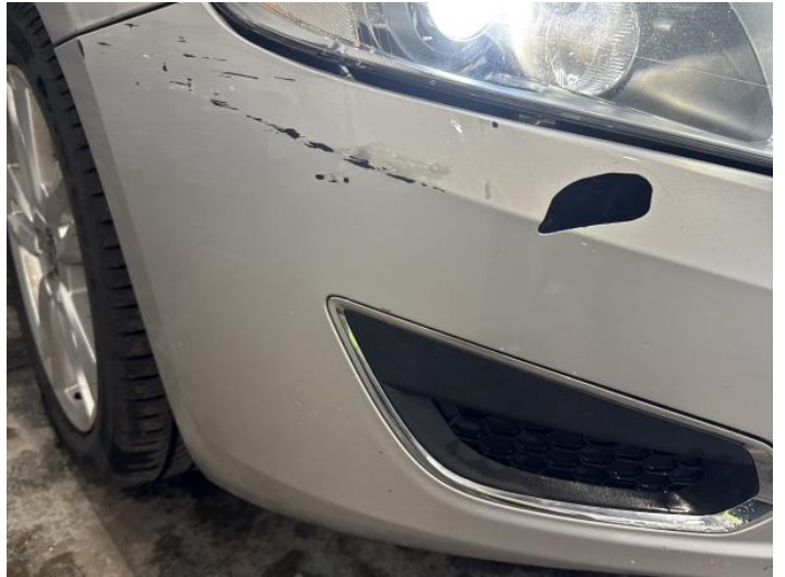
4: Bumper Front Scratched Over 100mm Thru Paint