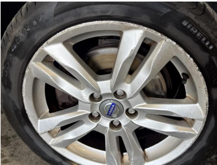
5: Wheel nsf Scratched Over 50mm