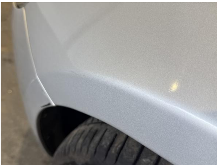
7: Wing nsf Scratched UpTo 25mm Thru Paint