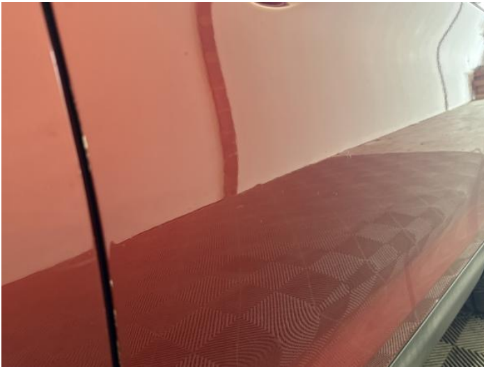
11: Door osf Dented 2 Or Less UpTo 10mm