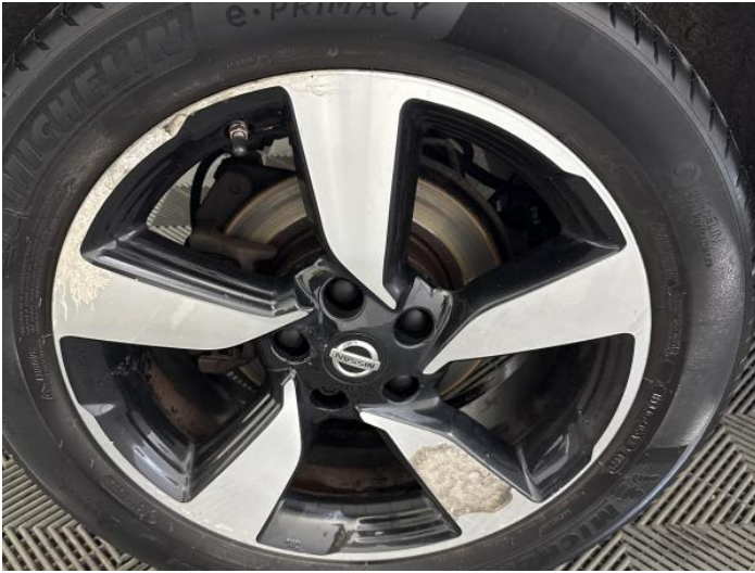
9: Wheel osr Scratched Over 50mm