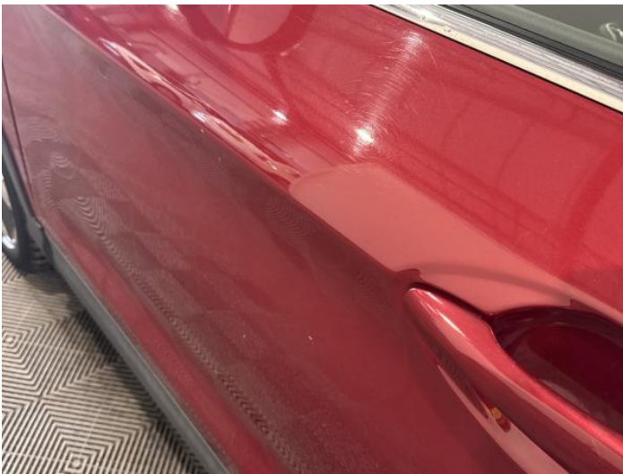
5: Door nsf Dented With Paint Damage