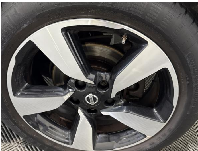
7: Wheel nsr Scratched Up To 50mm