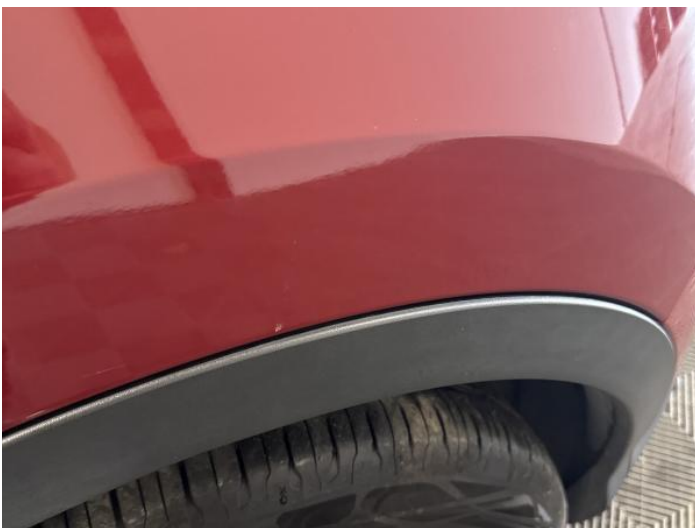
13: Wing osf Chipped 1 To 5