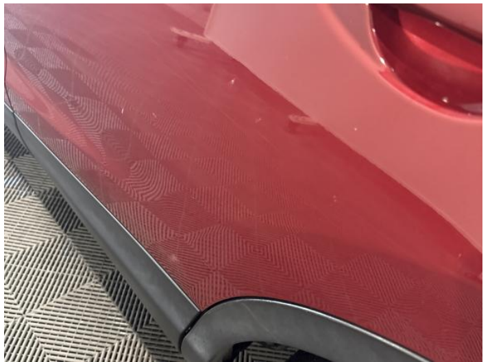
6: Door nsr Dented Over 30mm