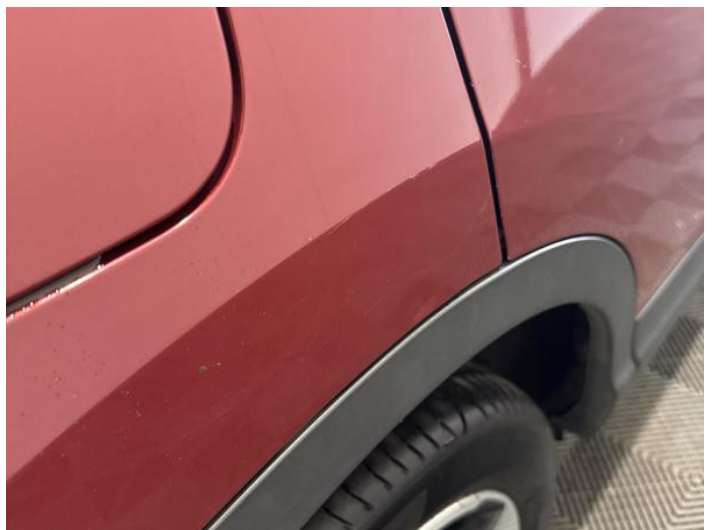
8: Qtr Panel osr Dented Between 10mm + 30mm