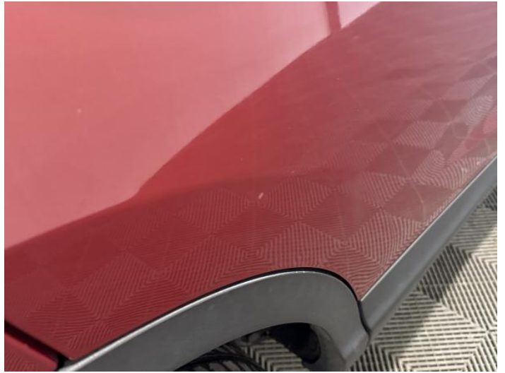
10: Door osr Dented 2 Or Less UpTo 10mm