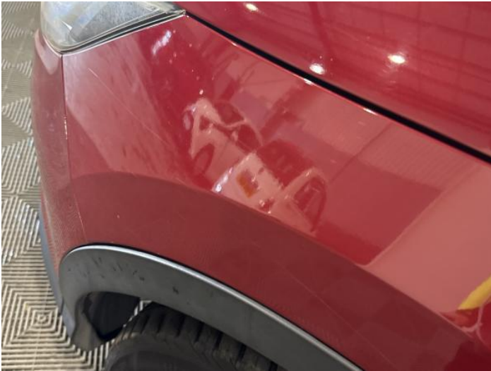
3: Wing nsf Scratched Over 25mm Thru Paint