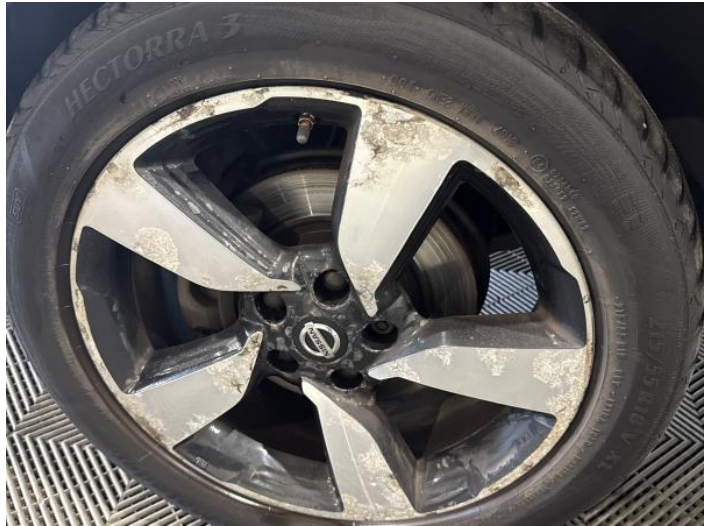
4: Wheel nsf Scratched Over 50mm