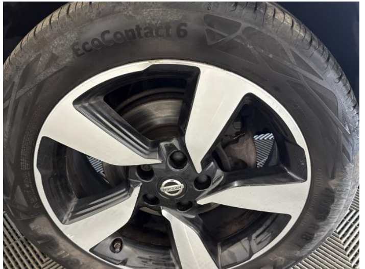
12: Wheel osf Scratched Up To 50mm