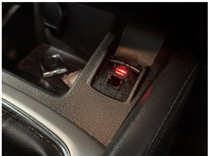
14: Switches And Controls Broken Replace