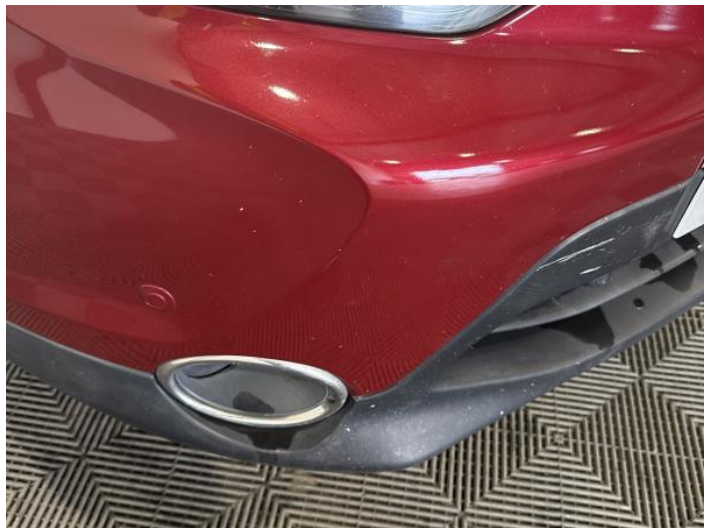
2: Bumper Front Chipped Multiple Chips