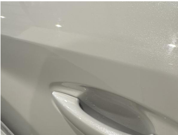
11: Door nsr Dented 2 Or Less UpTo 10mm