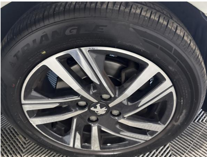
23: Wheel osf Scratched Over 50mm