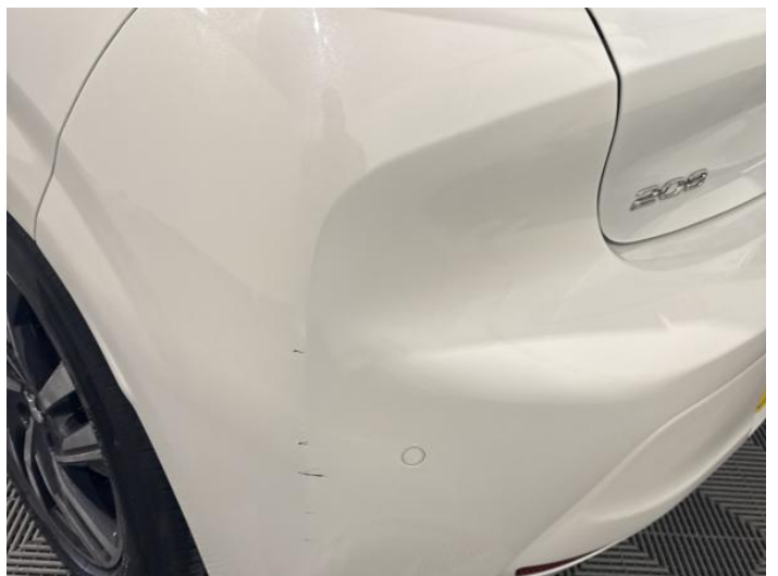
14: Bumper Rear Scratched 25 to 100mm Thru Paint