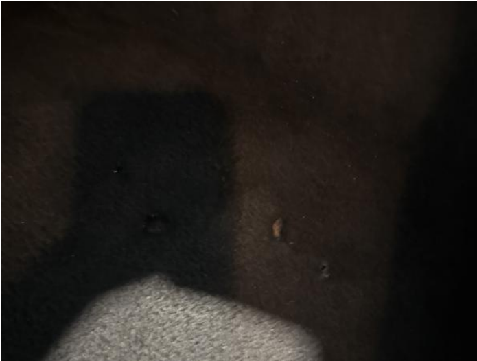
3: Carpets Front Torn Over 10mm