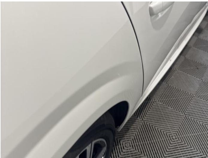
17: Qtr Panel osr Chipped 1 To 5