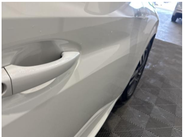
20: Door osf Chipped 1 To 5