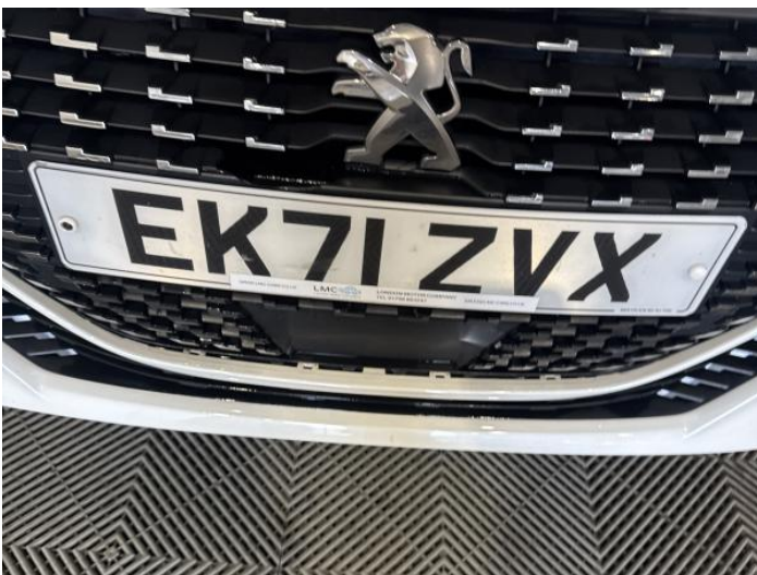
7: Bumper Front Grill Broken Replace