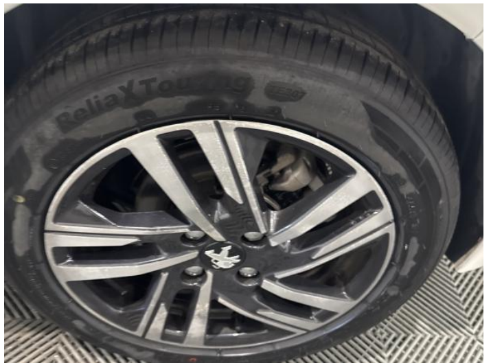
12: Wheel nsr Scratched Over 50mm