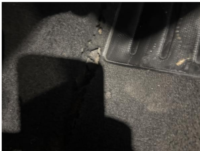
2: Carpets Front Torn Over 10mm