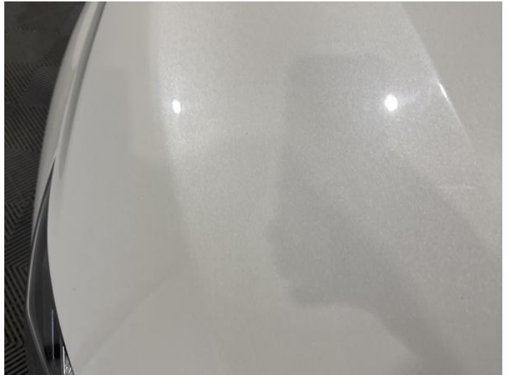
4: Bonnet Chipped 1 To 5