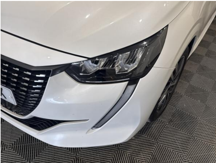
5: Bumper Front Chipped Multiple Chips