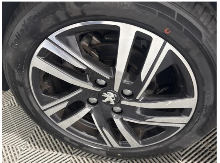
18: Wheel osr Scratched Over 50mm