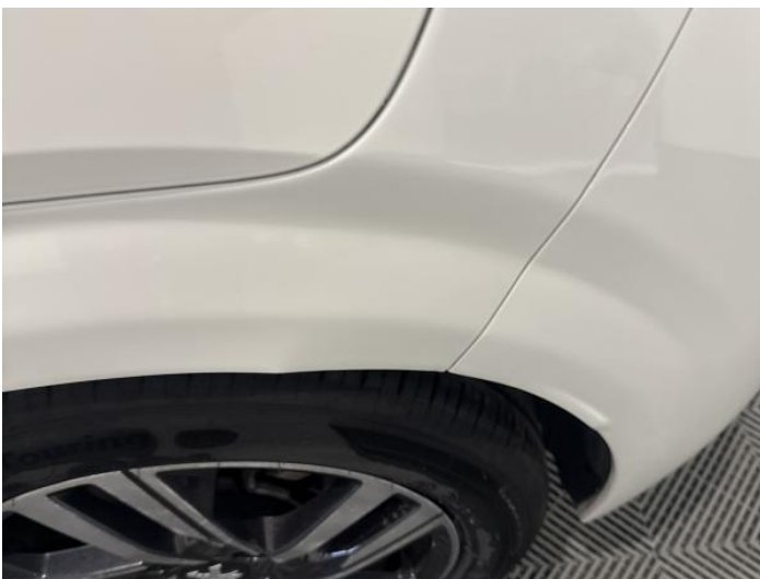
13: Qtr Panel nsr Dented With Paint Damage