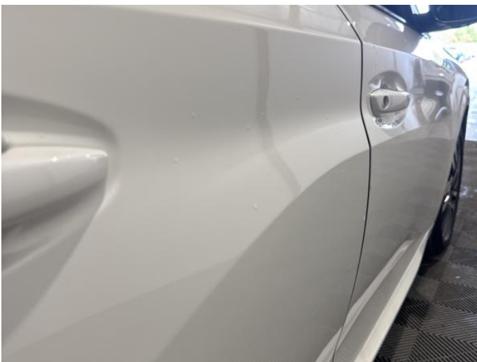
19: Door osr Dented 2 Or Less UpTo 10mm