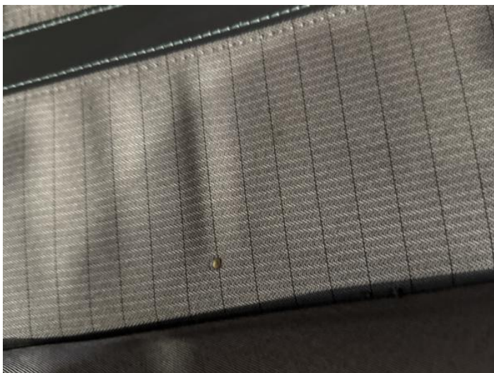
1: Seat Base Cover osf Holed UpTo 3mm