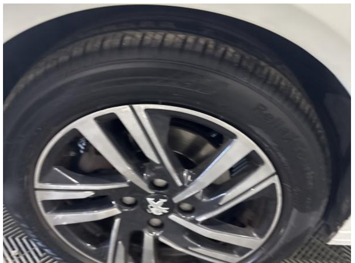
8: Wheel nsf Scratched Over 50mm