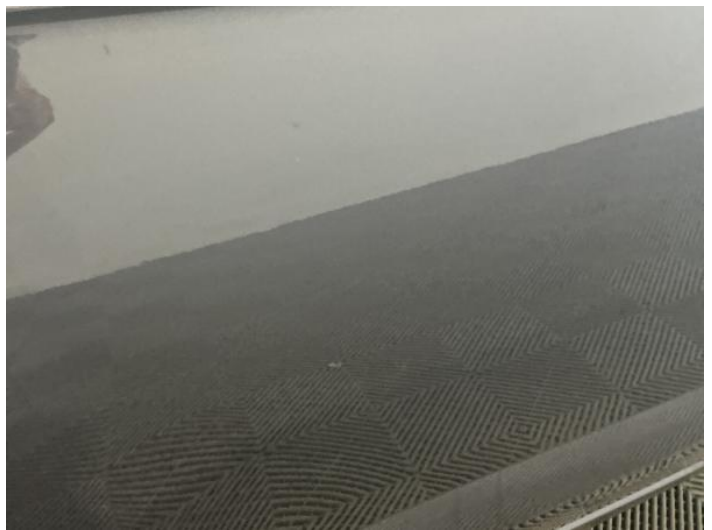
12: Door osr Chipped 1 To 5