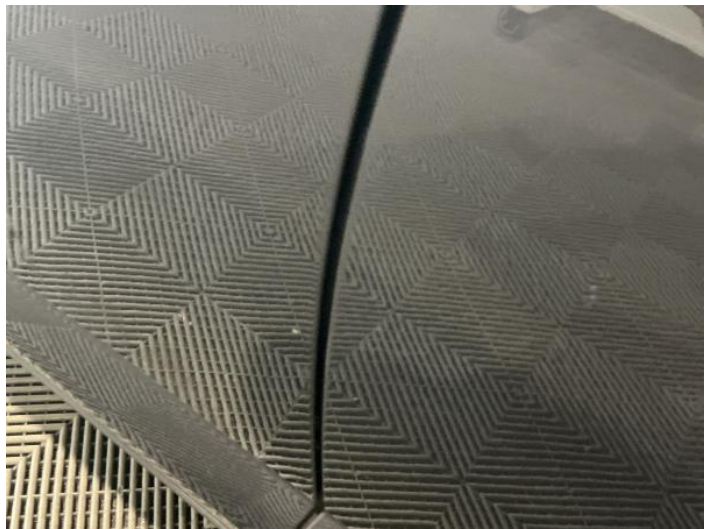
6: Door nsf Chipped 1 To 5