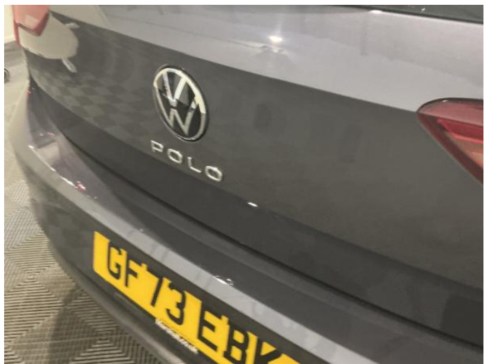
8: Bumper Rear Chipped Multiple Chips