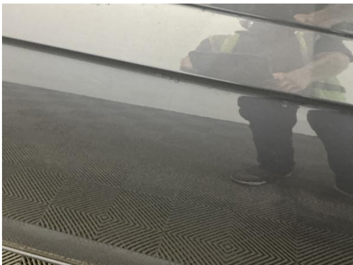
15: Door osf Chipped 1 To 5