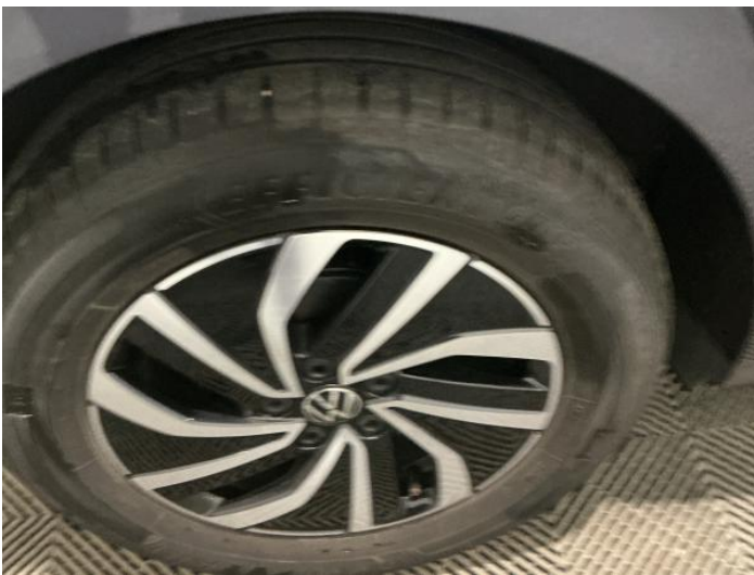
11: Wheel osr Scratched Up To 50mm