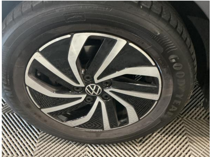
4: Wheel nsf Scratched Up To 50mm