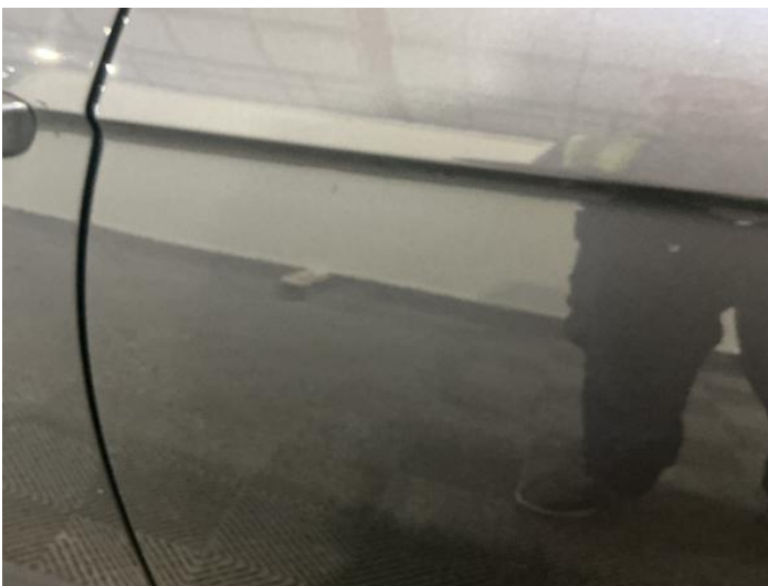
7: Door nsr Chipped 1 To 5