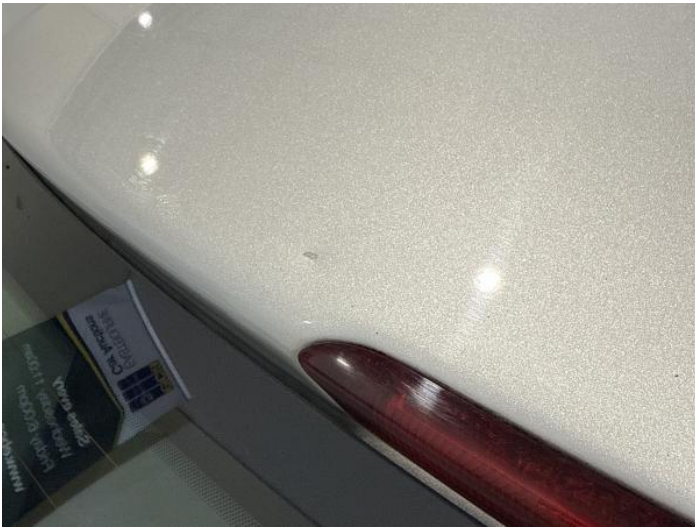
11: Roof Dented Between 10mm + 30mm