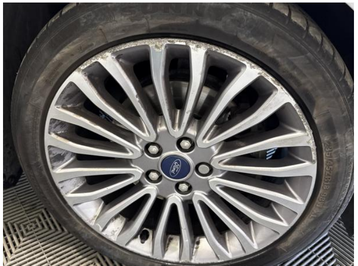
16: Wheel osf Scratched Over 50mm