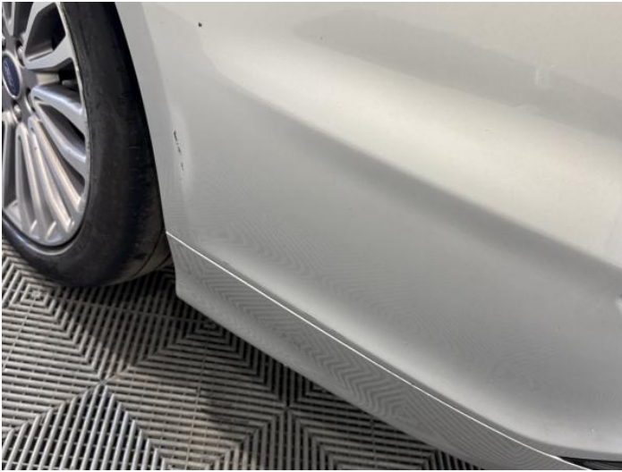
9: Bumper Rear Scratched Over 100mm Thru Paint