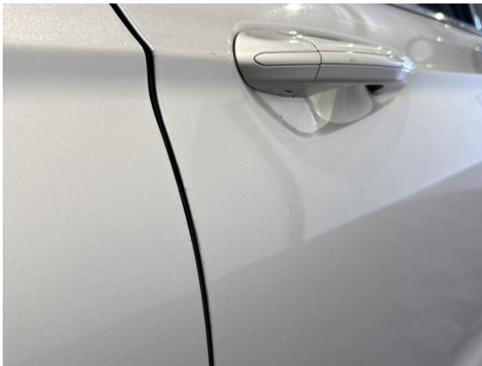
15: Door osf Chipped Edge Chip