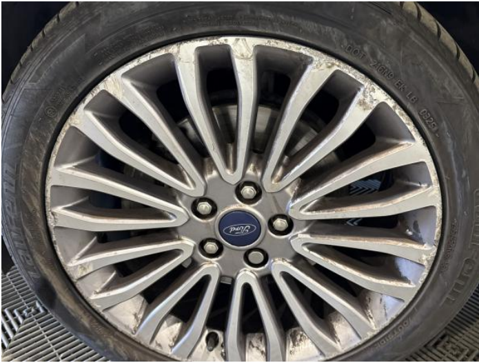
3: Wheel nsf Scratched Over 50mm