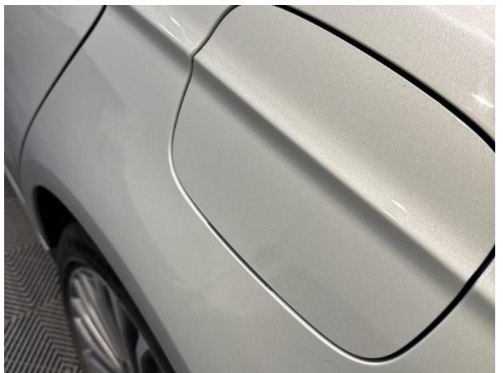
8: Qtr Panel nsr Scratched Over 25mm Thru Paint