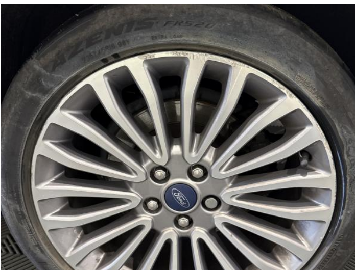
7: Wheel nsr Scratched Over 50mm