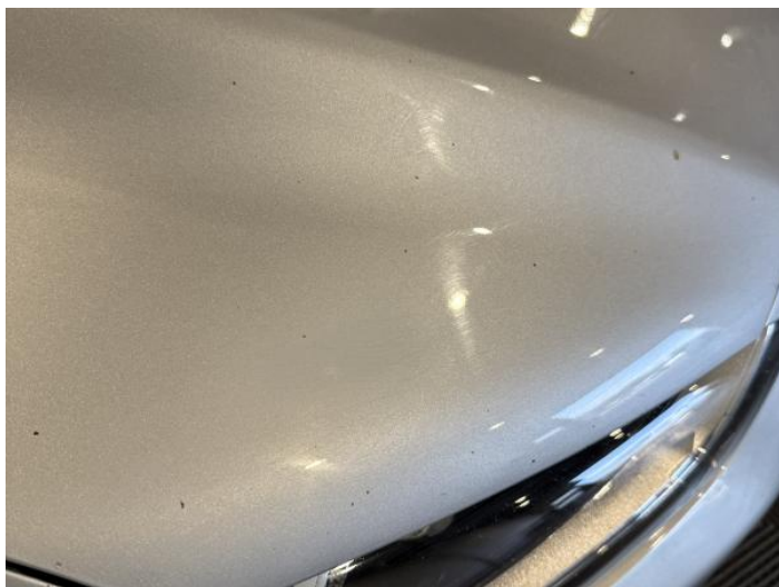
1: Bonnet Scratched Over 25mm Thru Paint