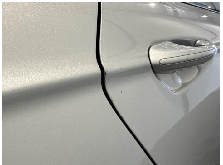
14: Door osr Chipped Edge Chip