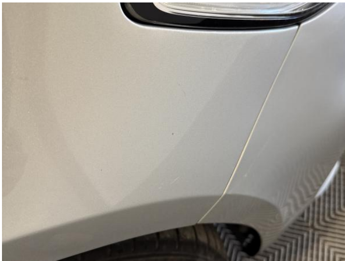
17: Wing osf Scratched UpTo 25mm Thru Paint