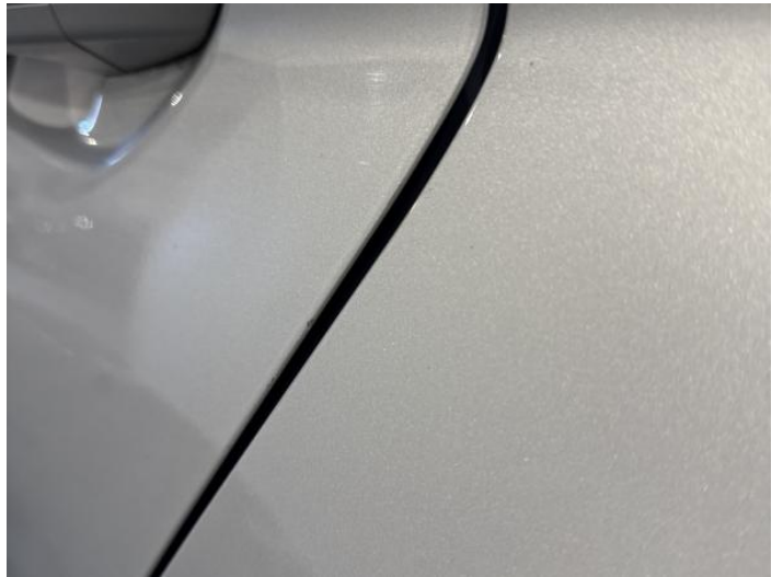
6: Door nsr Chipped Edge Chip