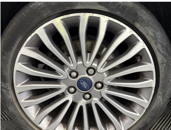
13: Wheel osr Scratched Over 50mm