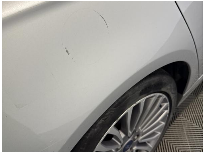
12: Qtr Panel osr Scratched Over 25mm Thru Paint