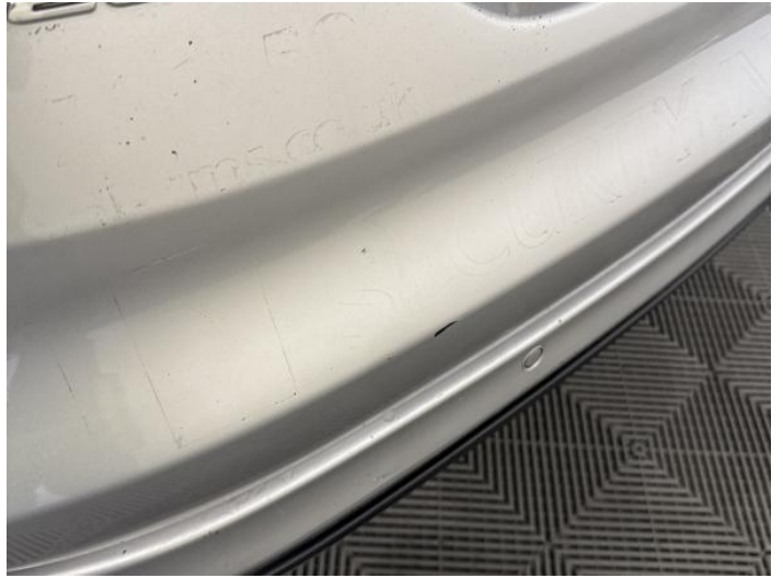
10: Tailgate Scratched Over 25mm Thru Paint