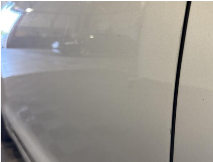
5: Door nsf Dented Between 10mm + 30mm