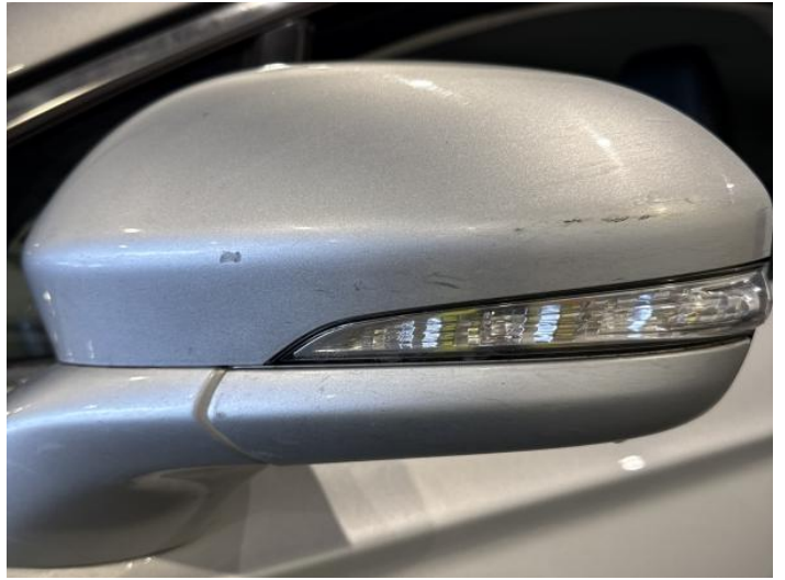
4: Door Mirror Assy nsf Scratched (Painted) UpTo 25mm Thru Paint