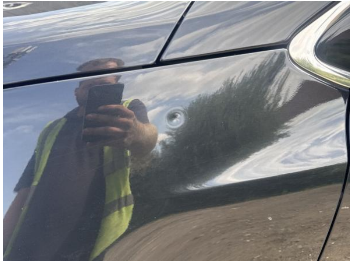
4: Wing nsf Dented Over 2 UpTo 10mm