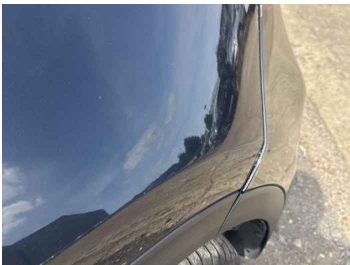
17: Wing osf Dented Over 2 UpTo 10mm