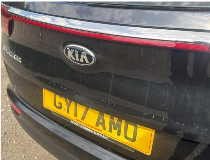
11: Boot Lid Scratched Over 25mm Thru Paint