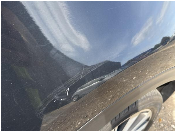
12: Qtr Panel osr Chipped 1 To 5