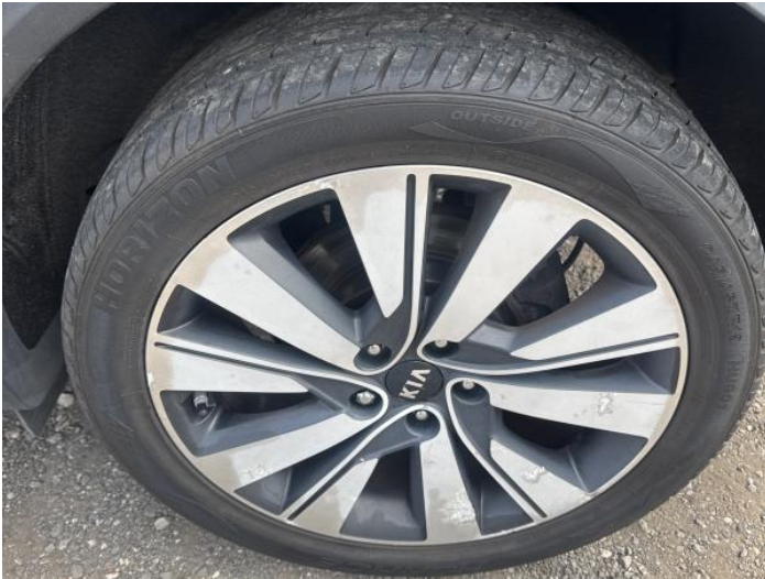
9: Wheel nsr Scratched Over 50mm