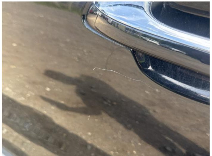
6: Door nsf Scratched Over 25mm Thru Paint