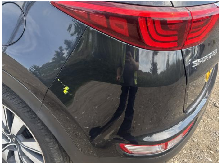
10: Bumper Rear Scratched Over 100mm Thru Paint