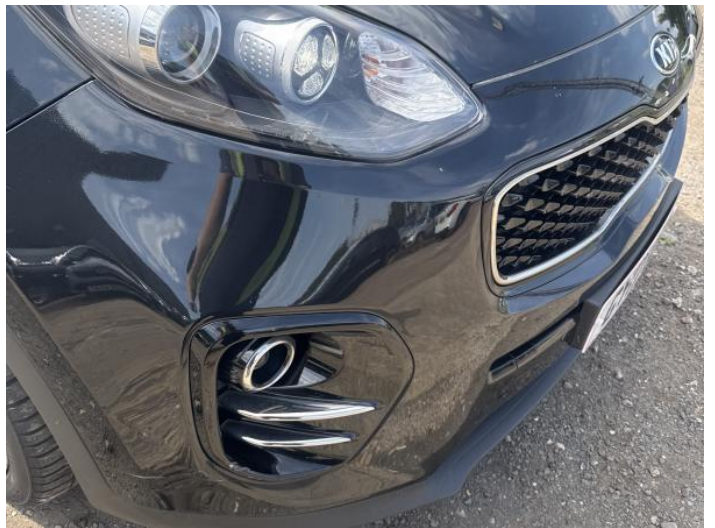
2: Bumper Front Poor Previous Repair Poor Paint