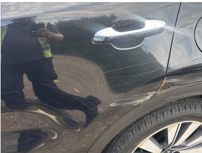
7: Door nsr Dented With Paint Damage