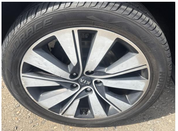
14: Wheel osr Scratched Over 50mm