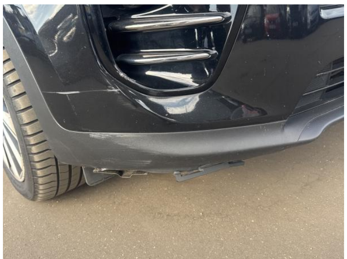
20: Bumper Front Moulding Broken Replace