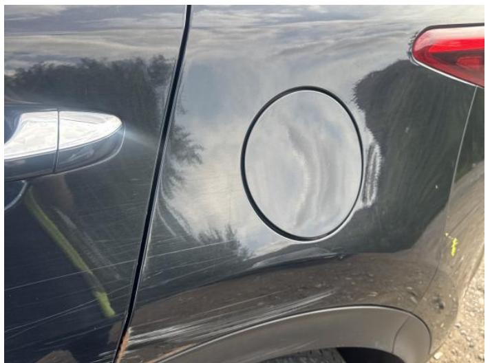
8: Qtr Panel nsr Dented With Paint Damage