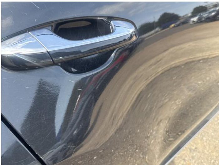
15: Door osr Dented With Paint Damage