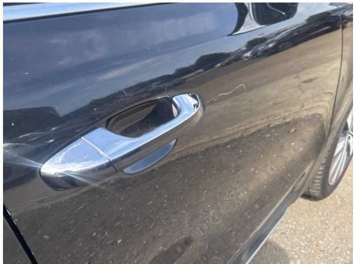
16: Door osf Scratched Over 25mm Thru Paint