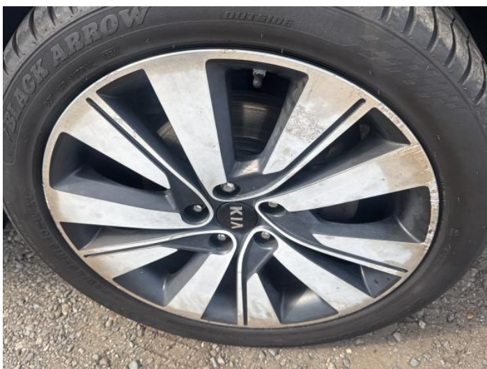
19: Wheel osf Scratched Over 50mm