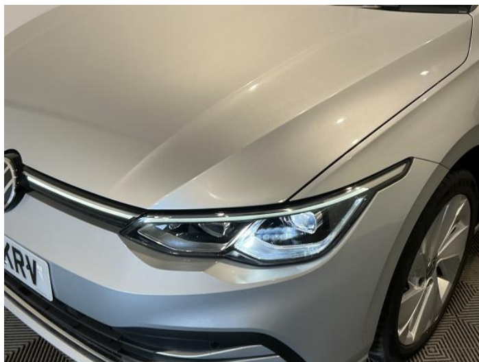
2: Bumper Front Chipped Multiple Chips