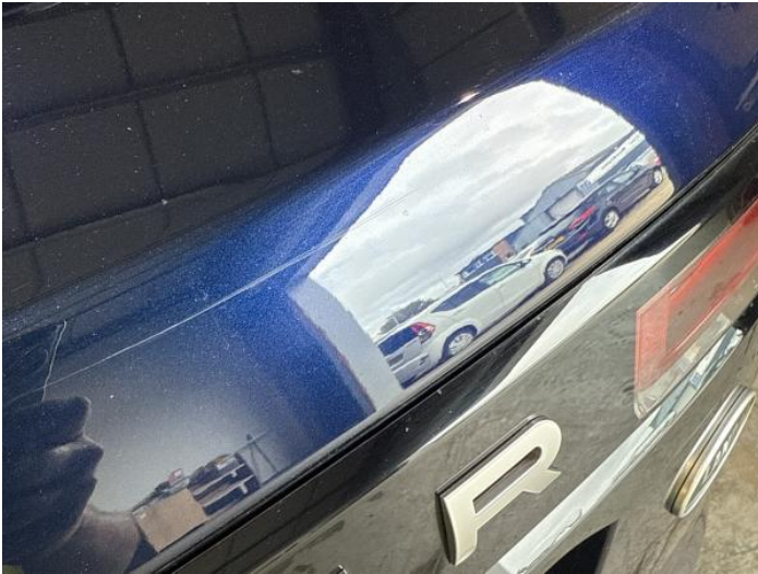
9: Tailgate Scratched Over 25mm Thru Paint