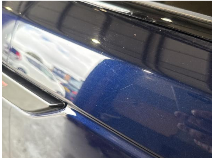
10: Qtr Panel osr Scratched UpTo 25mm Thru Paint