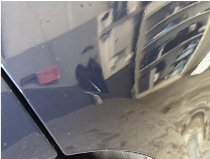
11: Door osr Scratched UpTo 25mm Thru Paint