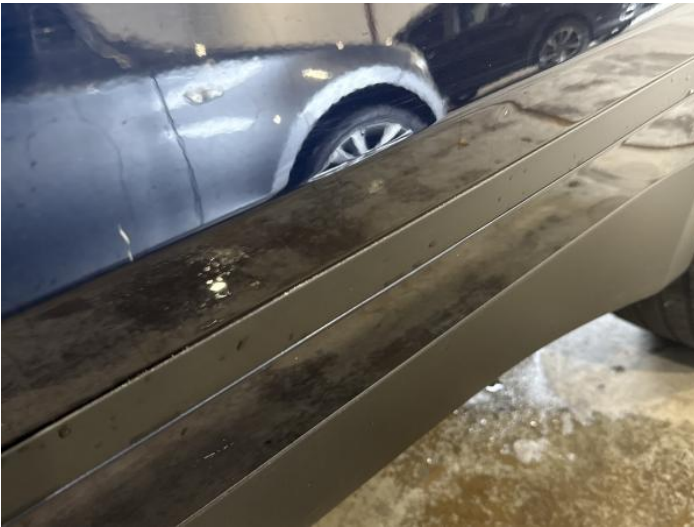
5: Door nsr Dented Between 10mm + 30mm