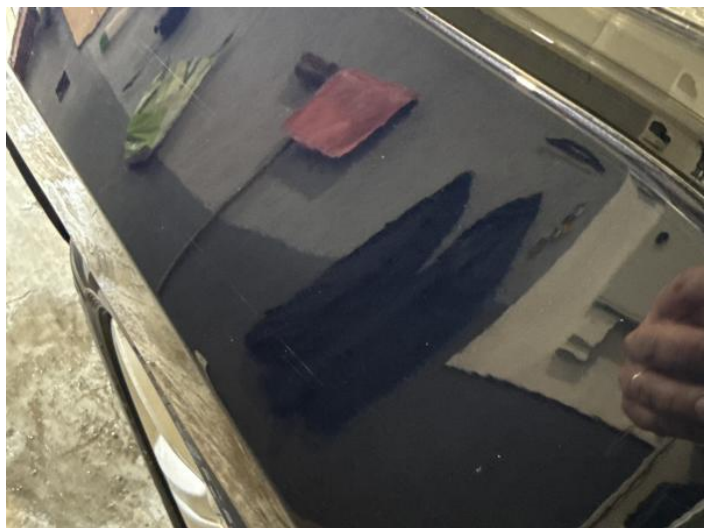
14: Wing osf Scratched Over 25mm Thru Paint