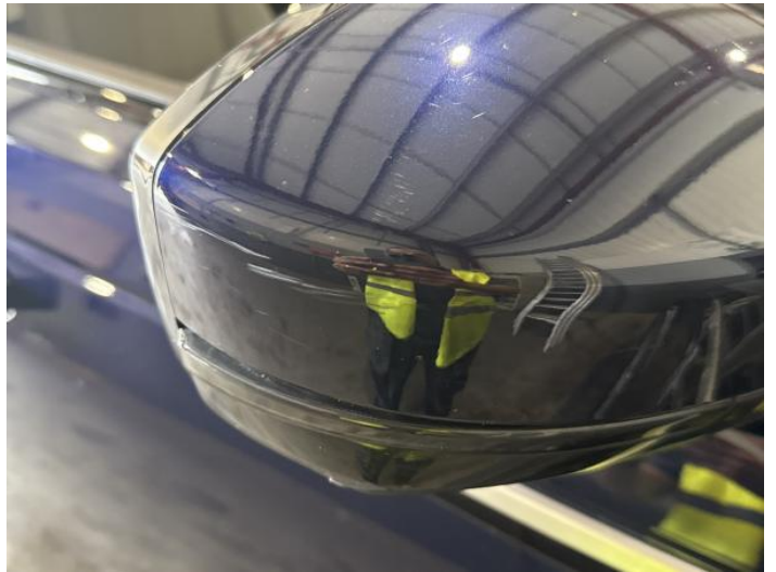
12: Door Mirror Assy osf Scratched (Painted) UpTo 25mm Thru Paint