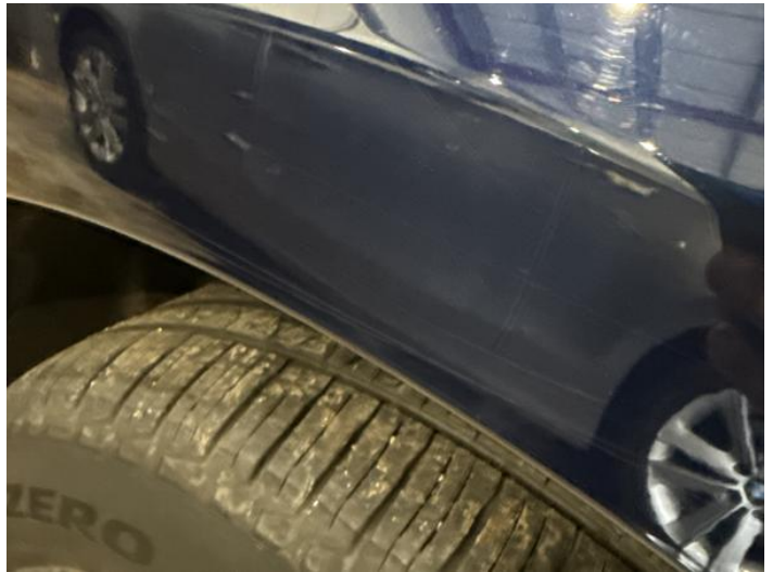
6: Qtr Panel nsr Scratched Over 25mm Thru Paint