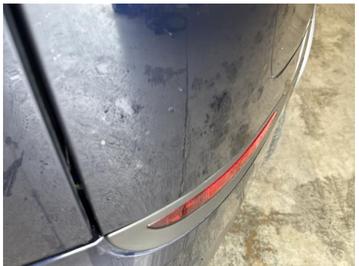
8: Bumper Rear Scratched Up To 25mm Thru Paint