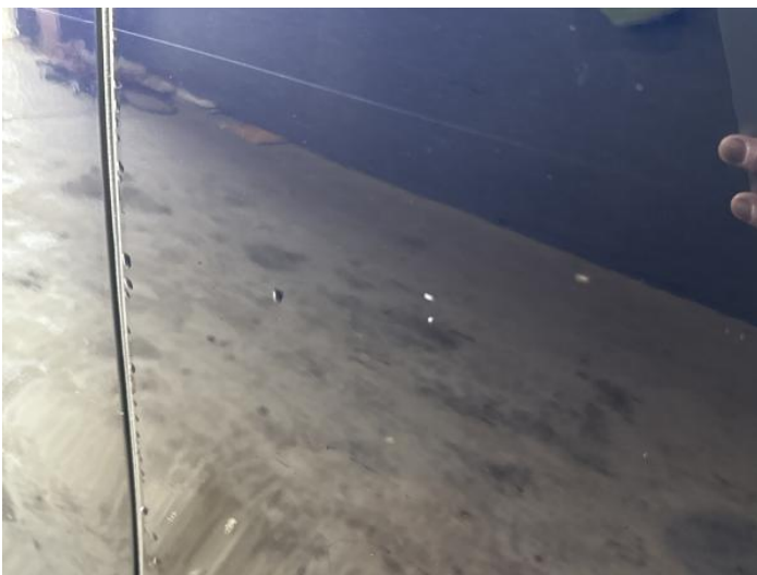
13: Door osf Scratched UpTo 25mm Thru Paint