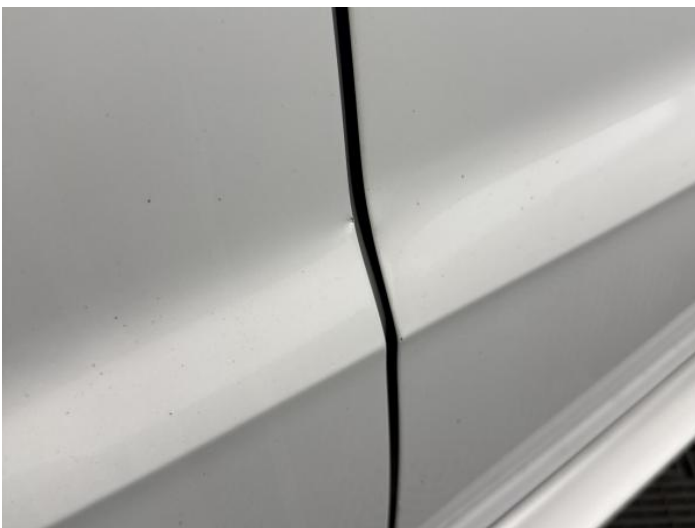
13: Door osr Dented 2 Or Less UpTo 10mm