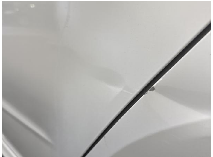
6: Door nsr Dented Over 30mm