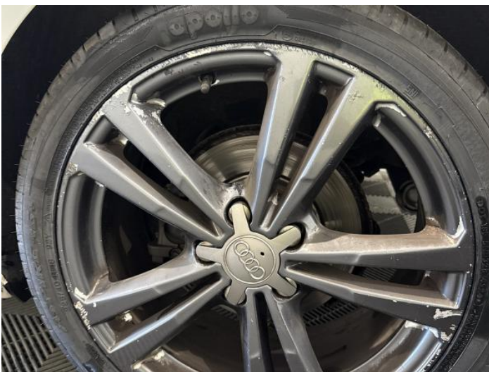
7: Wheel nsr Scratched Over 50mm