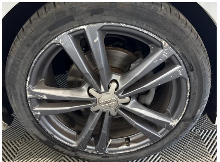
14: Wheel osf Scratched Over 50mm