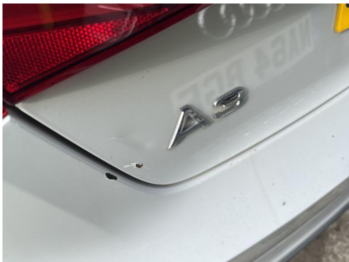
15: Tailgate Dented With Paint Damage