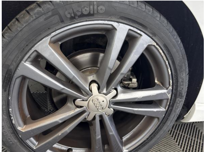
10: Wheel osr Scratched Over 50mm