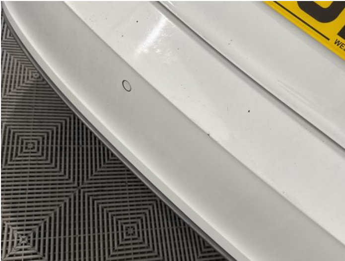
9: Bumper Rear Scratched 25 to 100mm Thru Paint