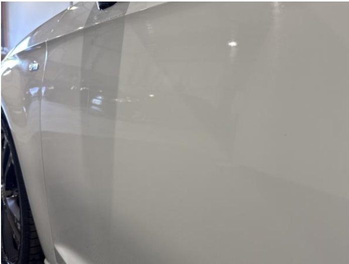
5: Door nsf Dented Over 30mm