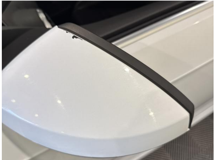
4: Door Mirror Assy nsf Scratched (Painted) UpTo 25mm Thru Paint