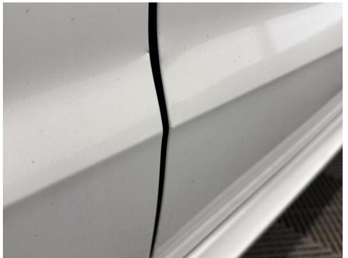
12: Door osf Chipped Edge Chip