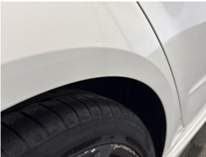
11: Qtr Panel osr Dented 2 Or Less UpTo 10mm