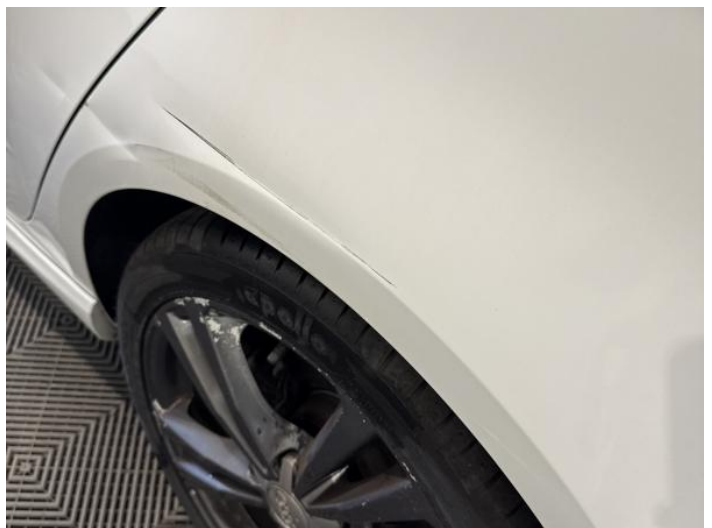
8: Qtr Panel nsr Dented With Paint Damage