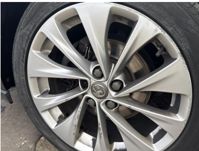
13: Wheel nsf Scratched Over 50mm