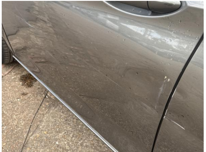
12: Door nsf Dented With Paint Damage