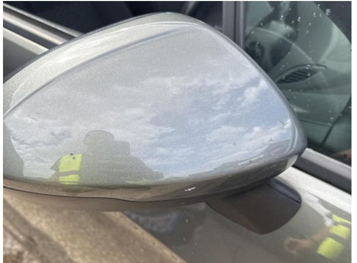
4: Door Mirror Assy osf Scratched (Painted) UpTo 25mm Thru Paint