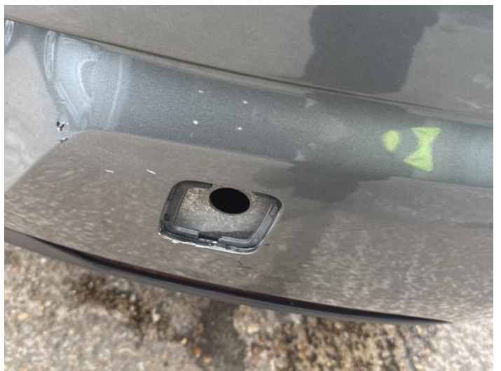
8: Rear TowEye Cvr Missing Replace