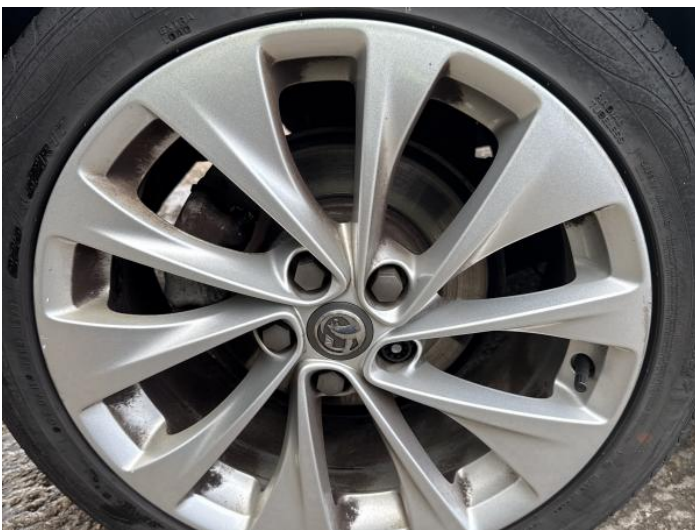
7: Wheel osr Scratched Over 50mm