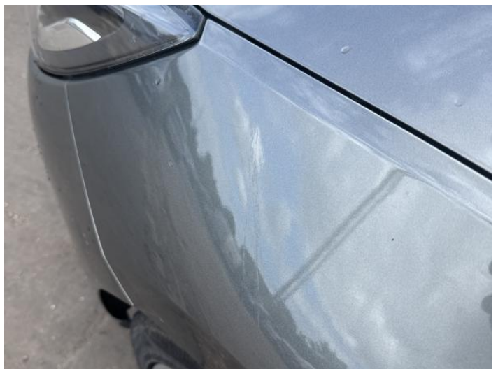
14: Wing nsf Scratched Over 25mm Not Thru Paint