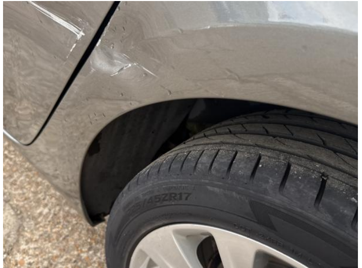
10: Qtr Panel nsr Dented Over 30mm