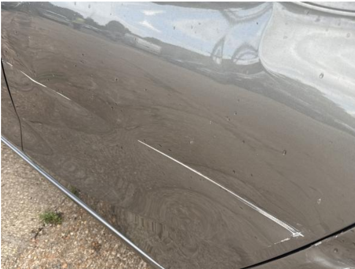
11: Door nsr Dented Over 30% Of Panel