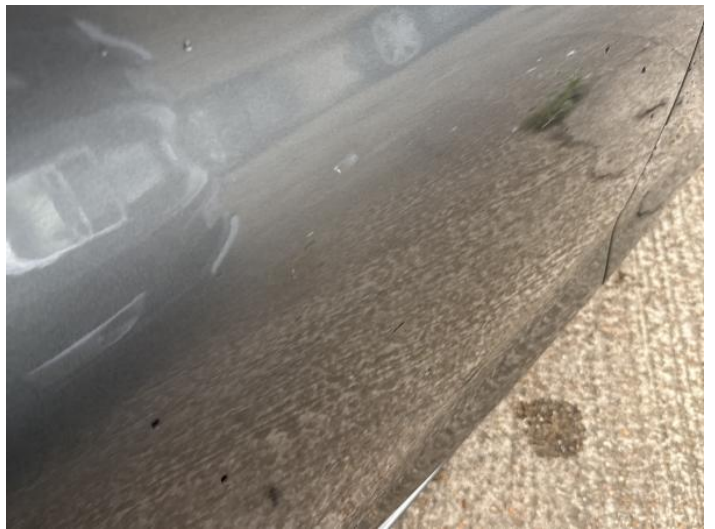
6: Door osr Dented With Paint Damage