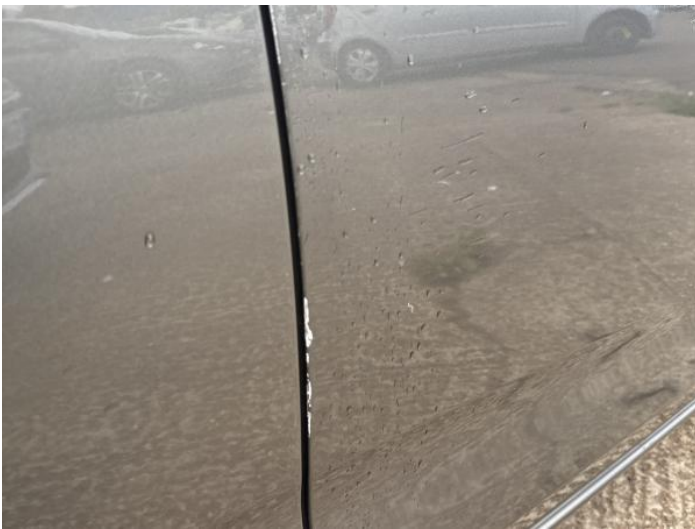
5: Door osf Scratched Over 25mm Thru Paint