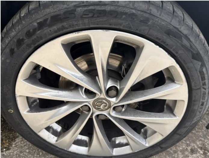
3: Wheel osf Scratched Over 50mm