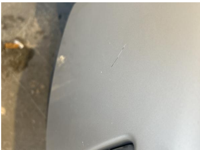
11: Bumper Front Scratched UpTo 25mm Thru Paint