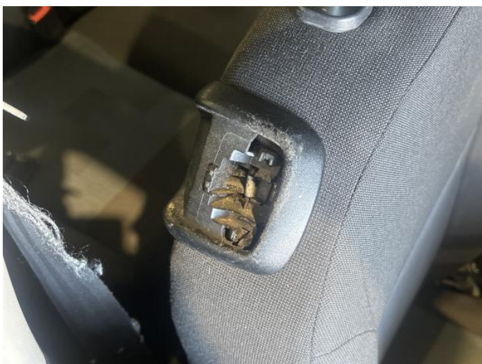
13: Seat Back Cover osf Missing Replace