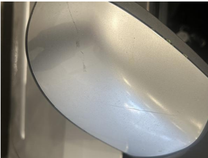
1: Door Mirror Assy osf Scratched (Painted) Over 25mm Not Thru Paint