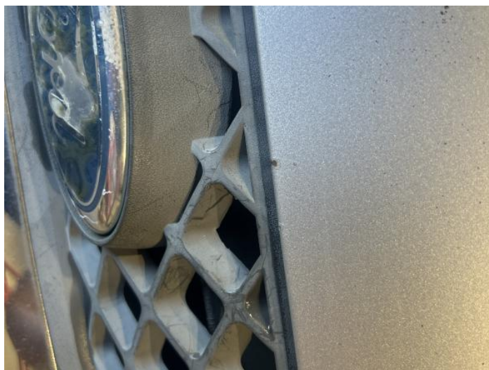
12: Bonnet Chipped 1 To 5