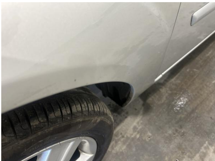
9: Wing nsf Dented Between 10mm + 30mm