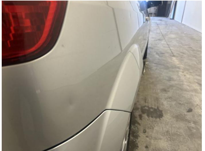
3: Door osf Scratched Over 25mm Not Thru Paint