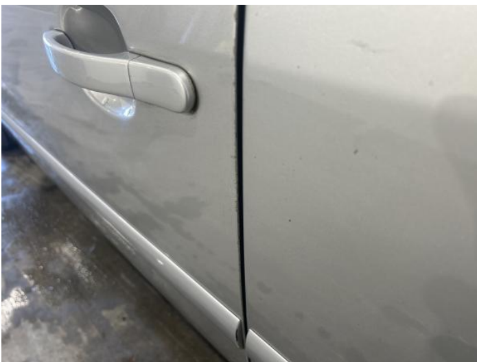
7: Door nsf Chipped Edge Chip