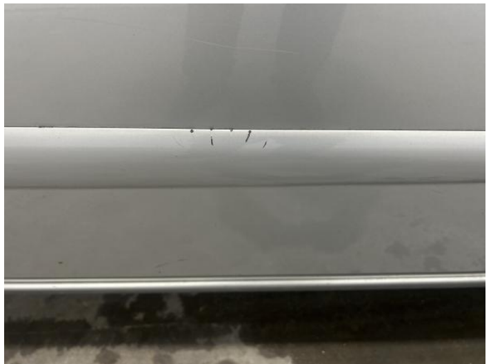
2: Door Moulding osf Scratched (Painted) UpTo 25mm Thru Paint