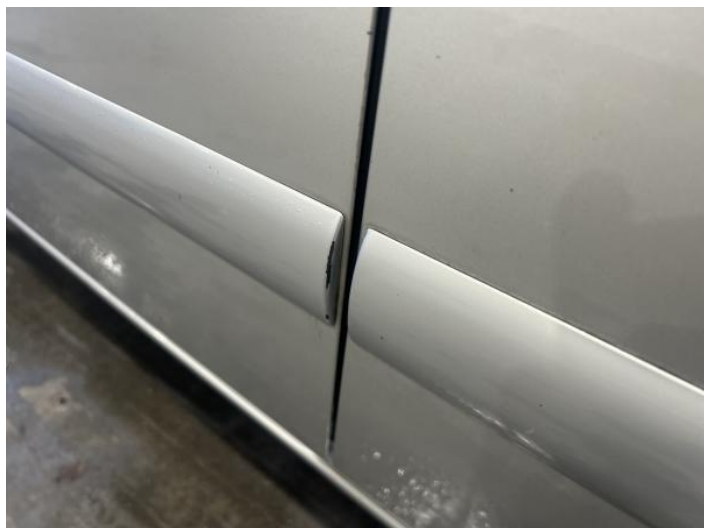
8: Door Moulding nsf Scratched (Painted) UpTo 25mm Thru Paint