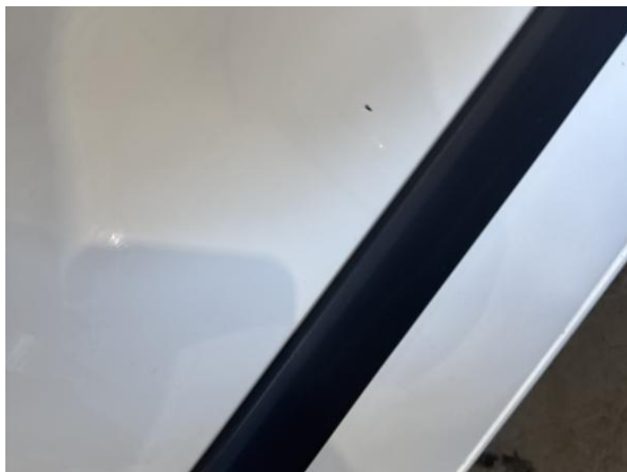
4: Door nsf Chipped 1 To 5