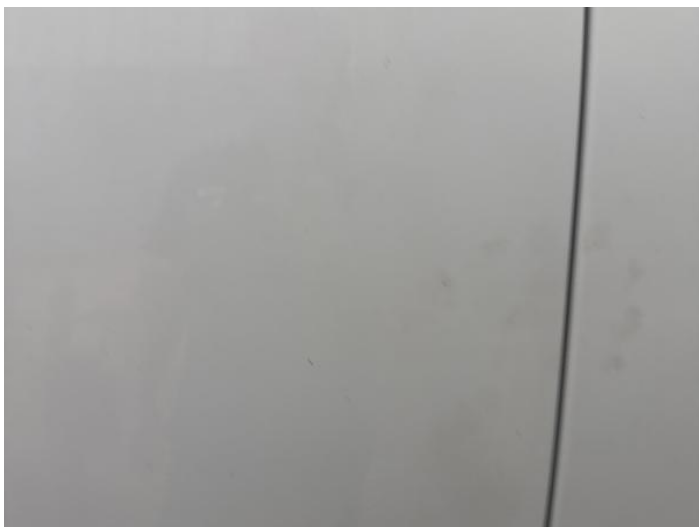
7: Boot Lid Chipped Multiple Chips