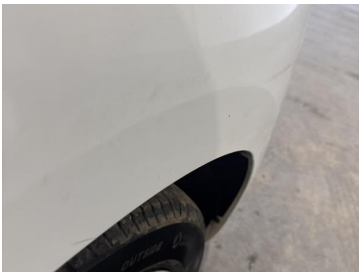
11: Wing osf Scratched Over 25mm Not Thru Paint