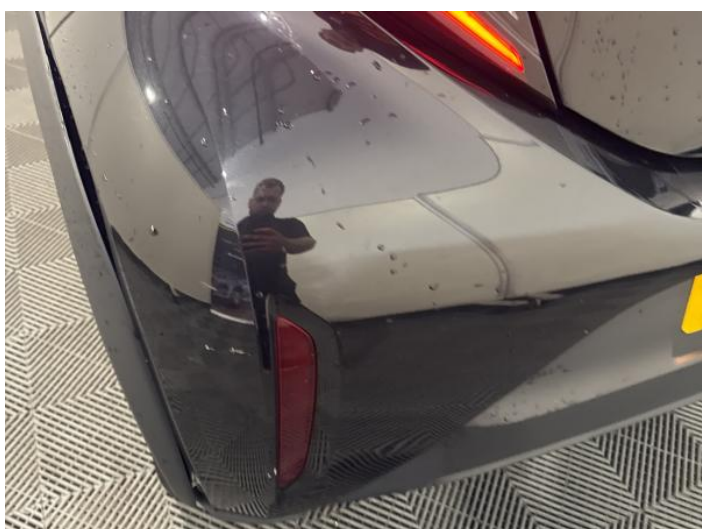
7: Bumper Rear Scratched 25 to 100mm Thru Paint