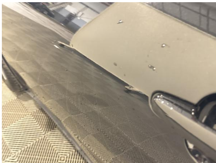
4: Door nsf Dented Over 2 UpTo 10mm