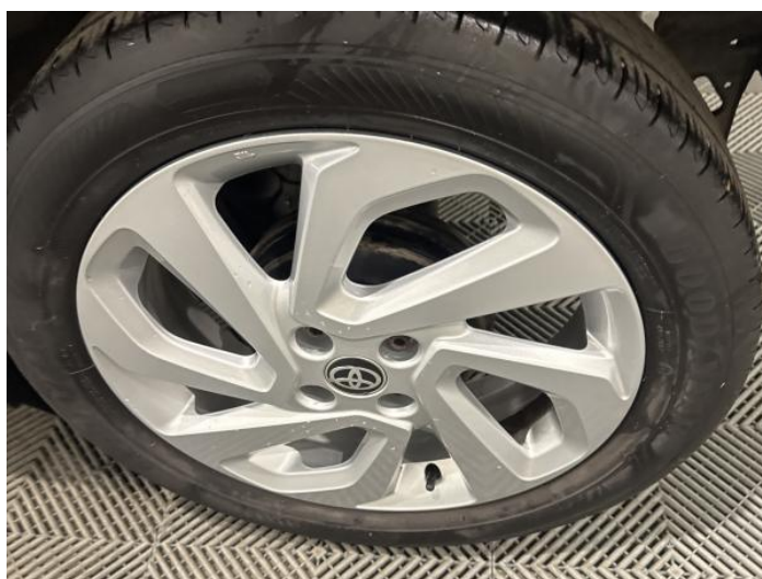
6: Wheel nsr Scratched Up To 50mm