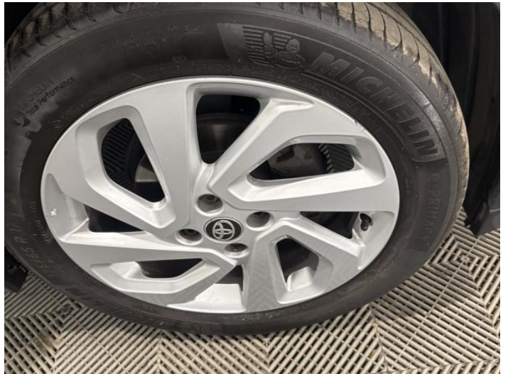
12: Wheel osf Scratched Up To 50mm