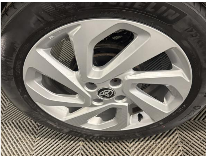
13: Wheel osf Scratched Up To 50mm