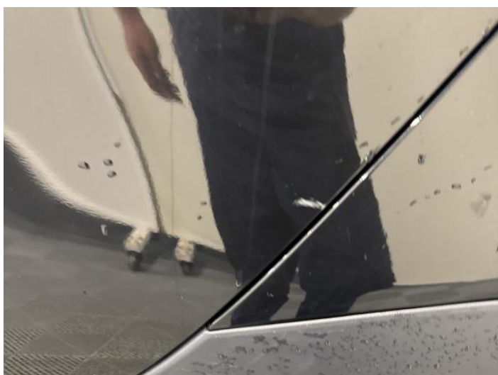
5: Door nsr Chipped 1 To 5