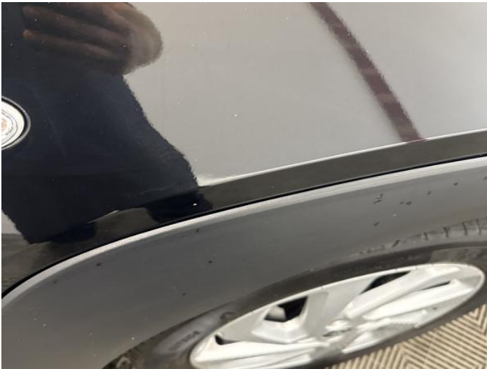
11: Wing osf Chipped 1 To 5