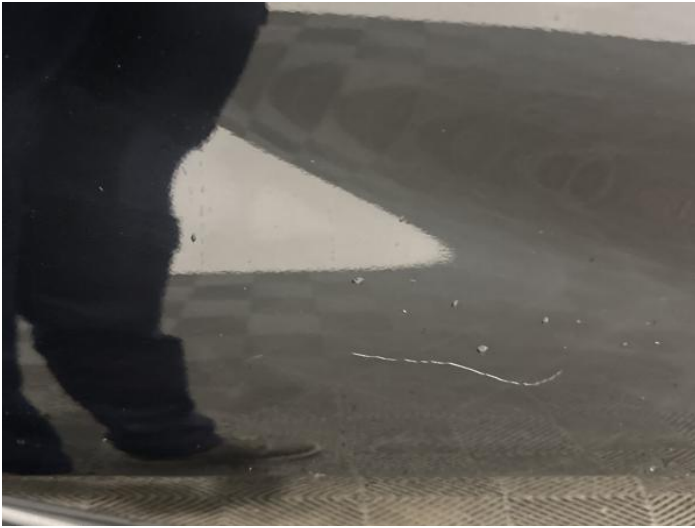
9: Door osr Scratched Over 25mm Thru Paint