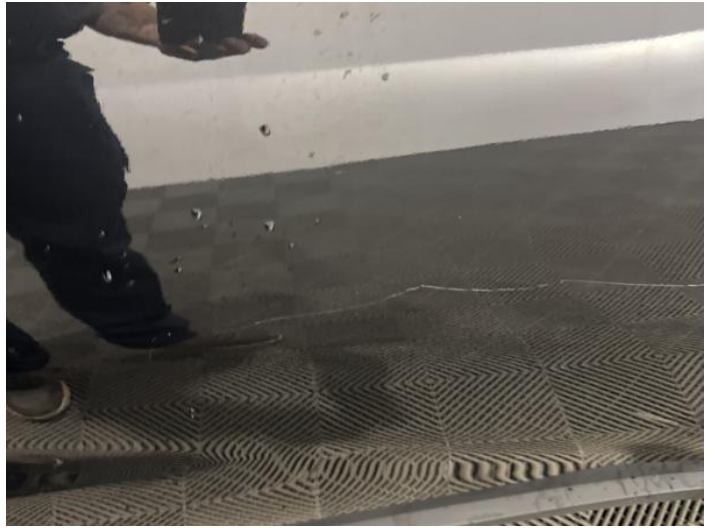
10: Door osf Scratched Over 25mm Thru Paint