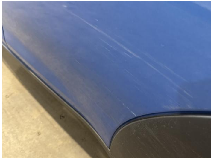
12: Door nsr Dented With Paint Damage