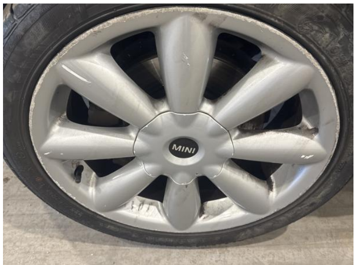
14: Wheel nsf Scratched Over 50mm