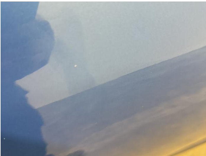
5: Door osr Chipped 1 To 5