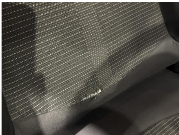
15: Seat Base Cover osf Torn Over 3mm