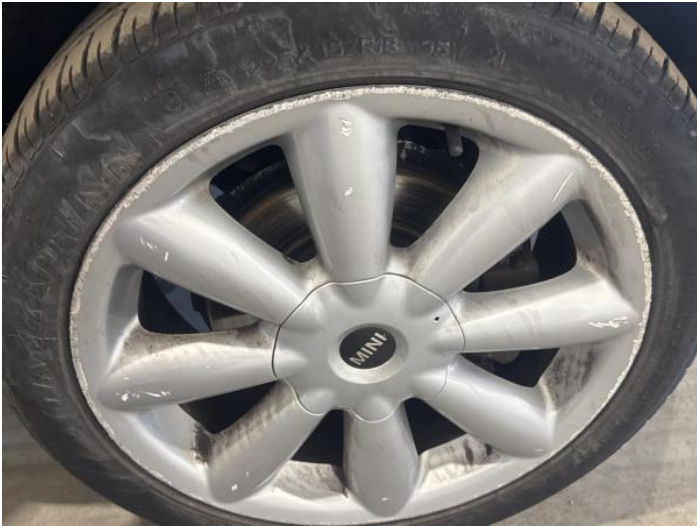
3: Wheel osf Scratched Over 50mm