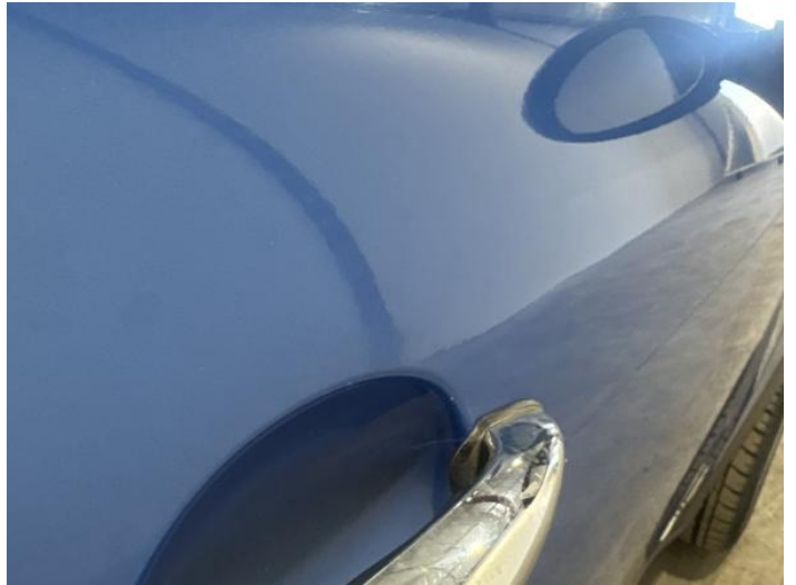
4: Door osf Dented Between 10mm + 30mm