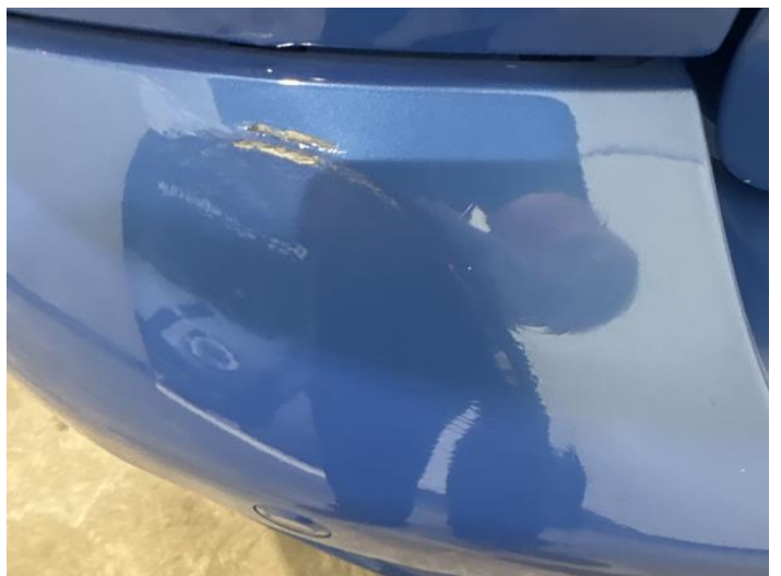
8: Bumper Rear Poor Previous Repair Poor Paint