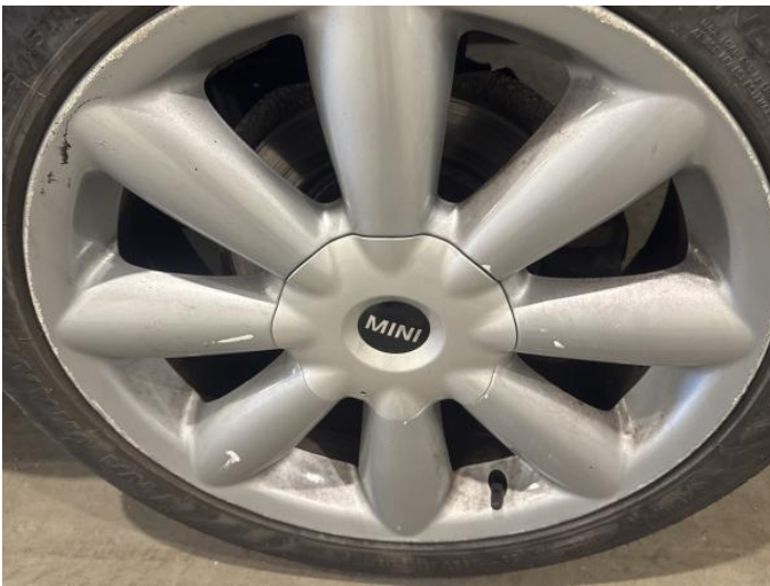
11: Wheel nsr Scratched Over 50mm