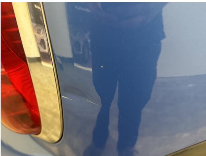
7: Qtr Panel osr Dented With Paint Damage