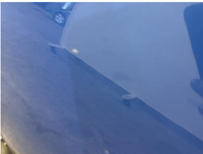
13: Door nsf Chipped 1 To 5