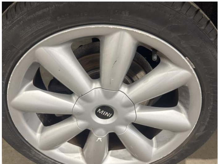
6: Wheel osr Scratched Over 50mm