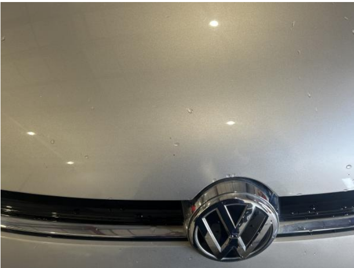
8: Bonnet Chipped 1 To 5