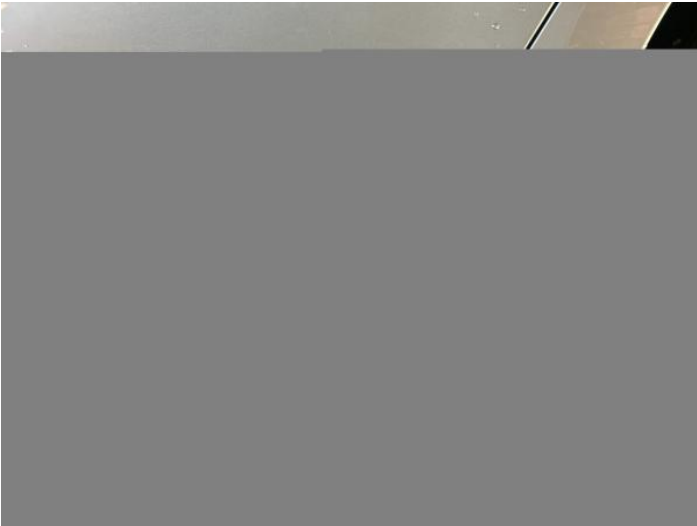
10: Sill ns Dented With Paint Damage