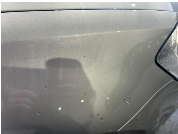
1: Wing osf Chipped 1 To 5