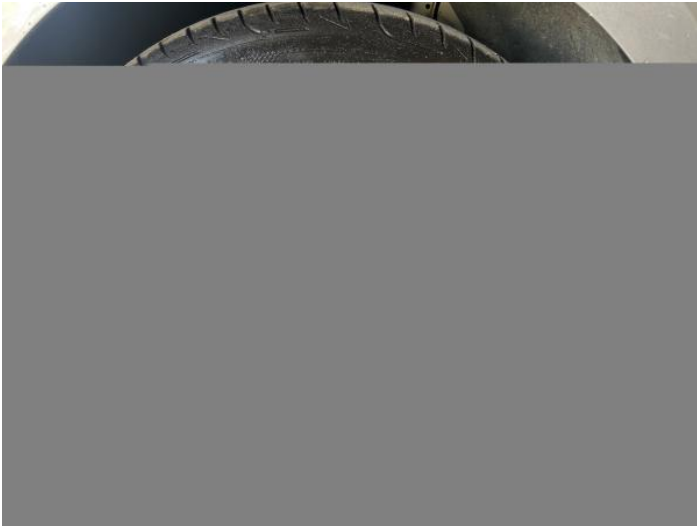
9: Wheel nsf Scratched Up To 50mm