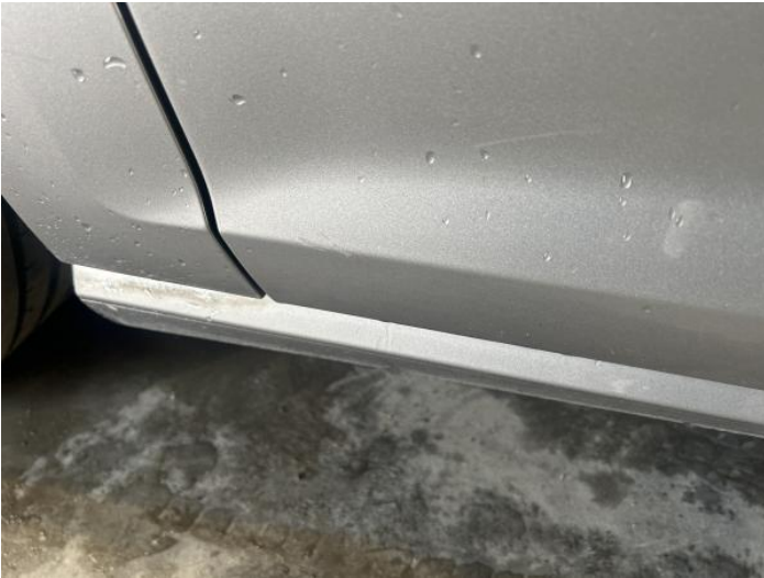
4: Door nsf Scratched UpTo 25mm Thru Paint