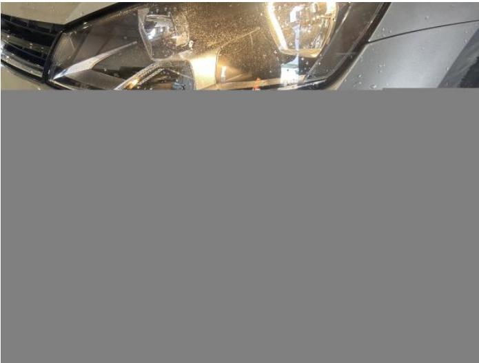
6: Bumper Front Scratched 25 to 100mm Thru Paint