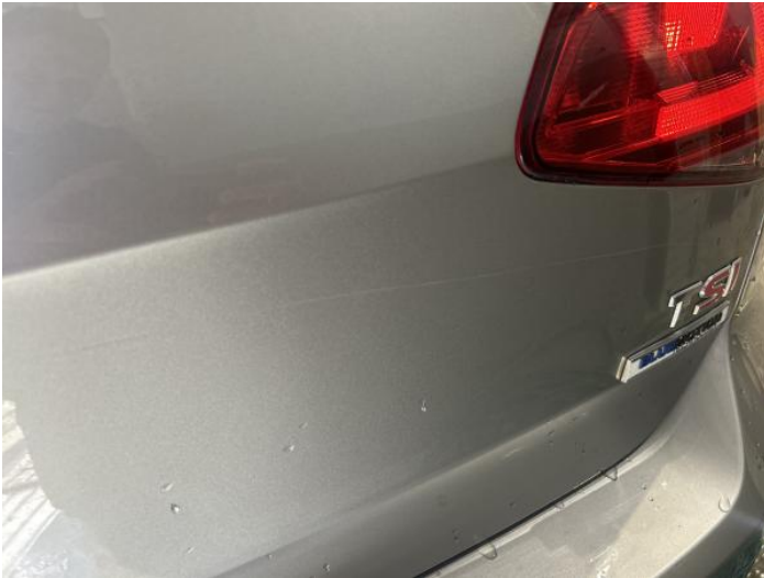
3: Tailgate Scratched Over 25mm Not Thru Paint