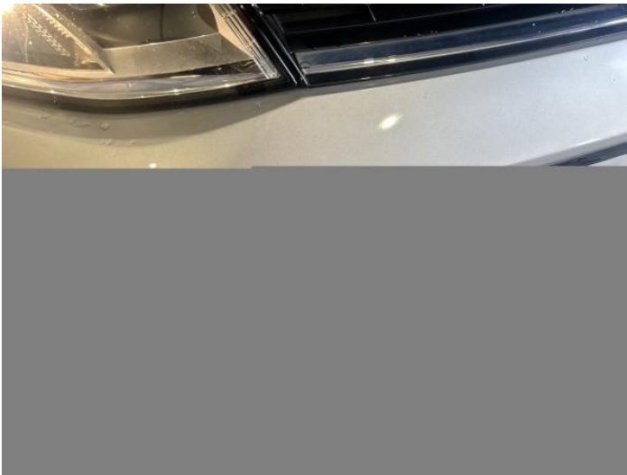
7: Bumper Front Chipped 1 To 5