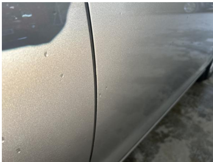
2: Door osf Chipped Edge Chip