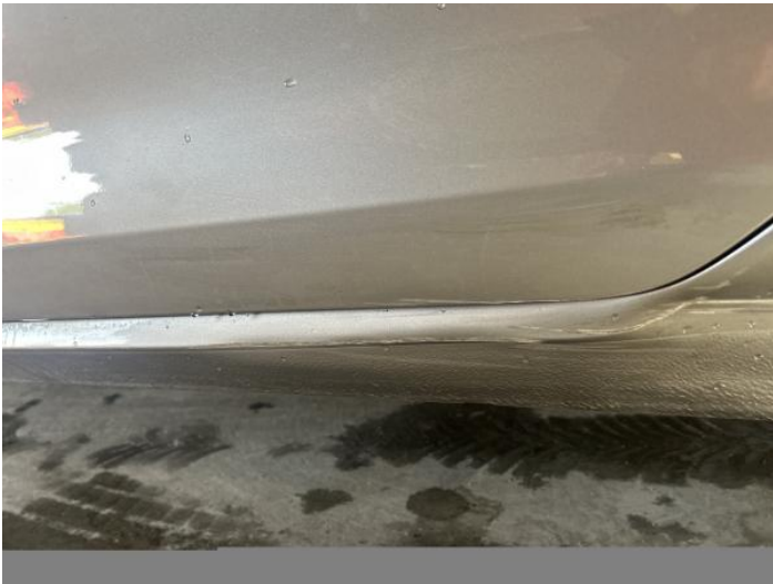
11: Door nsr Scratched UpTo 25mm Thru Paint