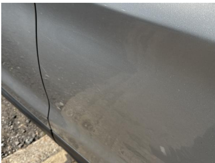
7: Door nsr Scratched Over 25mm Thru Paint