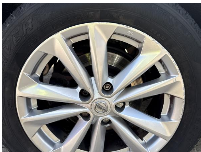
12: Wheel osr Scratched Over 50mm