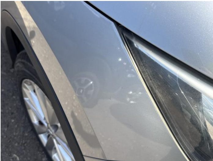
17: Wing osf Scratched UpTo 25mm Thru Paint

Carpet Condition Average Seat Condition Average