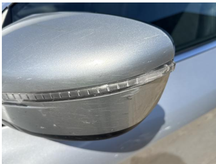
6: Door Mirror Assy nsf Scratched (Painted) Over 25mm Thru Paint