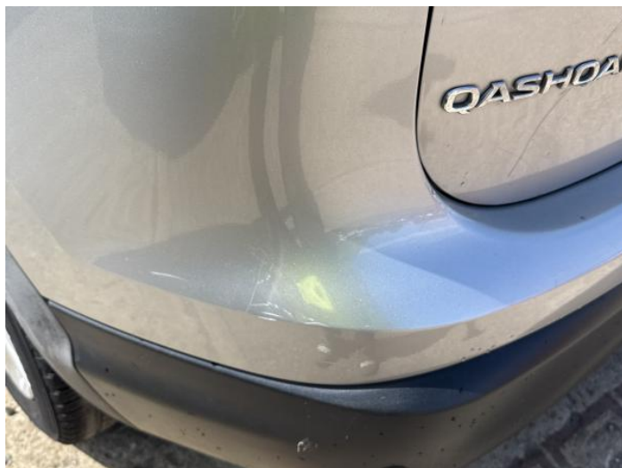
10: Bumper Rear Scratched Over 100mm Thru Paint