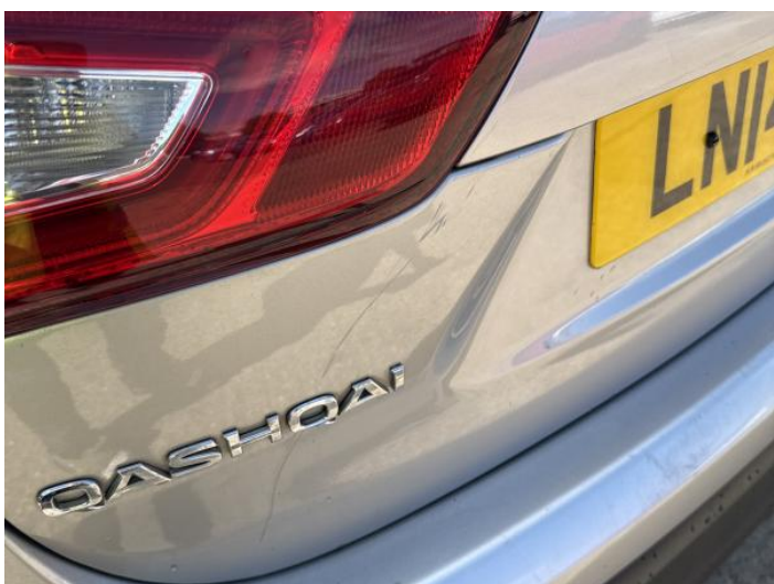
11: Tailgate Scratched Over 25mm Thru Paint