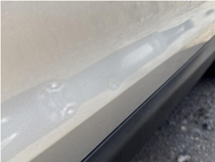
15: Door osf Dented 2 Or Less UpTo 10mm