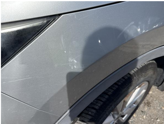
3: Wing nsf Scratched Over 25mm Thru Paint