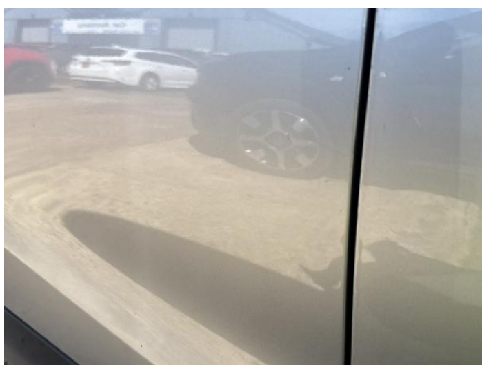
14: Door osr Scratched Over 25mm Thru Paint