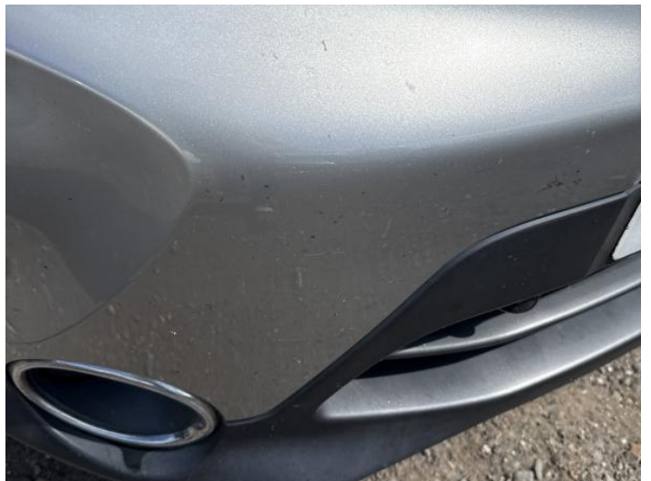
2: Bumper Front Scratched 25 to 100mm Thru Paint