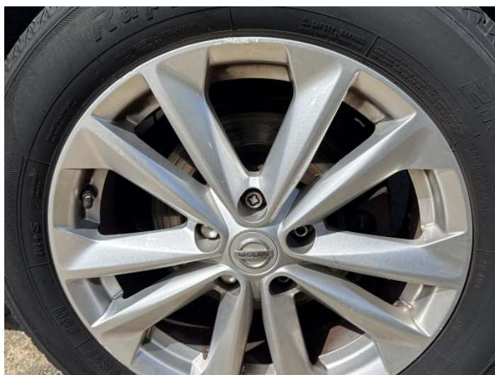
8: Wheel nsr Scratched Over 50mm