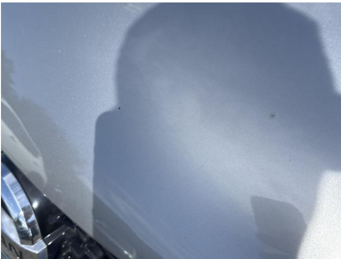
1: Bonnet Chipped Multiple Chips