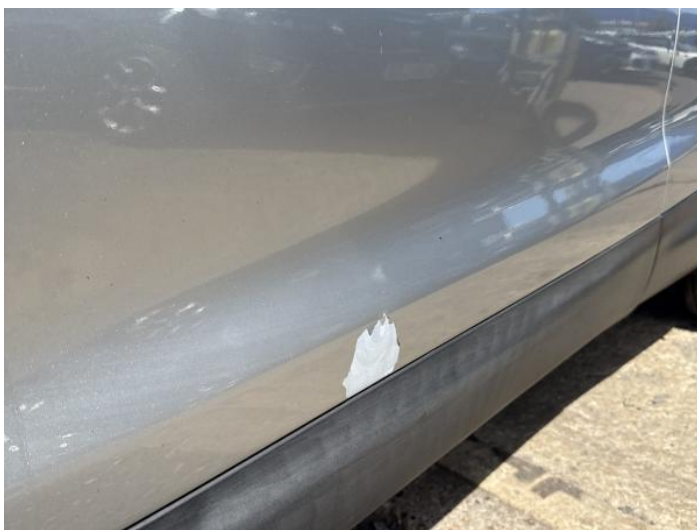
5: Door nsf Poor Previous Repair Paint Flake