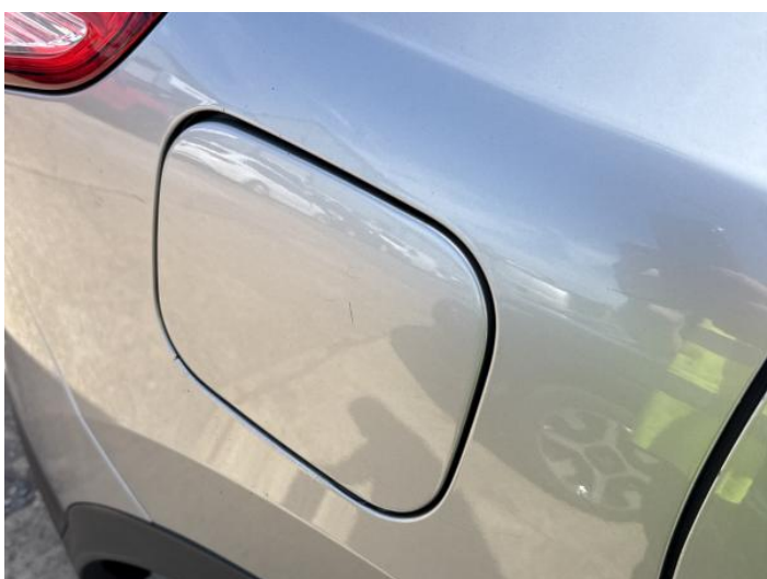
13: Qtr Panel osr Dented Over 30mm