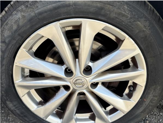
16: Wheel osf Scratched Over 50mm