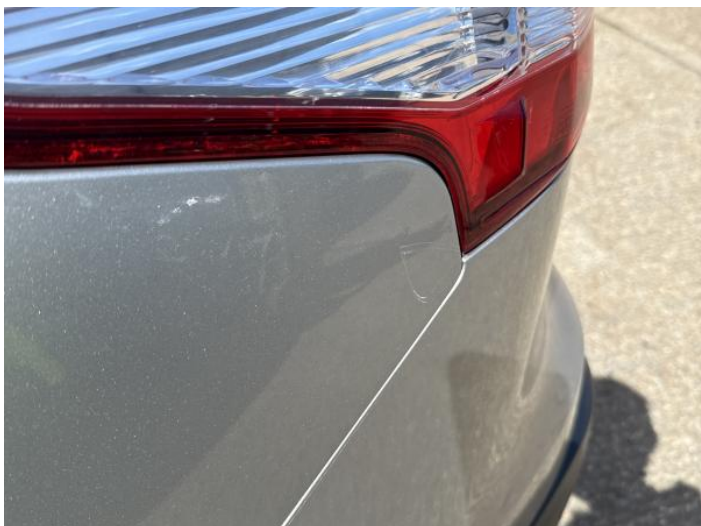
9: Qtr Panel nsr Scratched Over 25mm Thru Paint