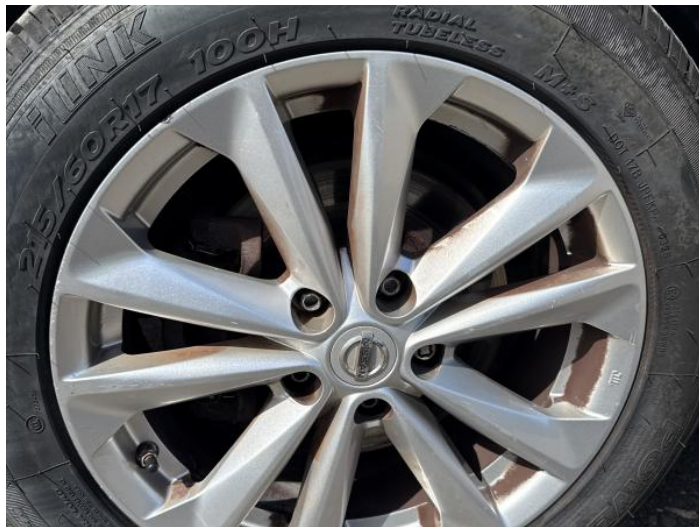
4: Wheel osf Scratched Over 50mm