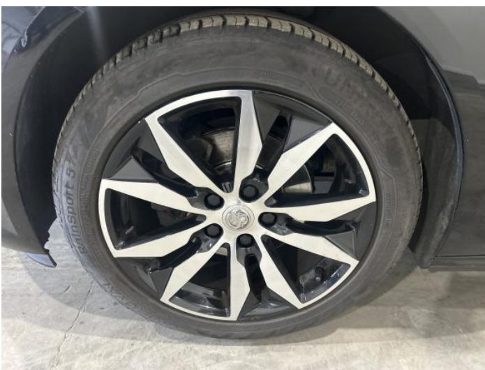
13: Wheel nsf Scratched Up To 50mm