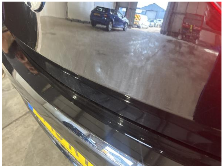
6: Tailgate Dented 2 Or Less UpTo 10mm