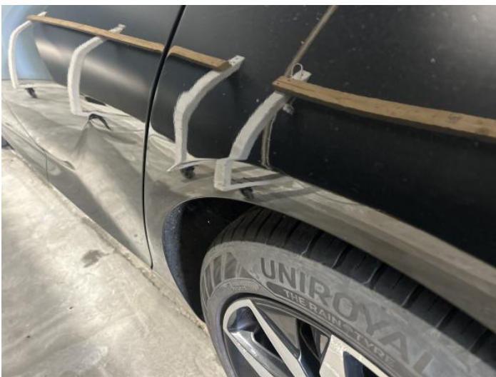
7: Qtr Panel nsr Dented 2 Or Less UpTo 10mm