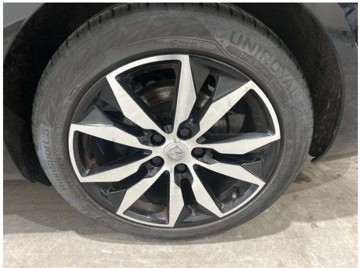
12: Wheel nsr Scratched Over 50mm