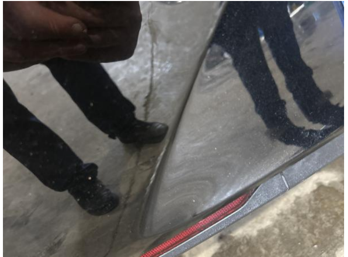
4: Bumper Rear Scratched 25 to 100mm Thru Paint