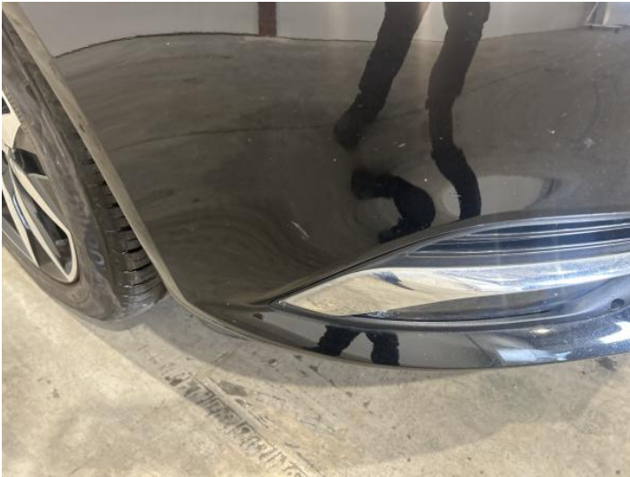
9: Bumper Front Scratched UpTo 25mm Thru Paint