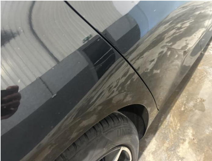
3: Qtr Panel osr Scratched Over 25mm Not Thru Paint