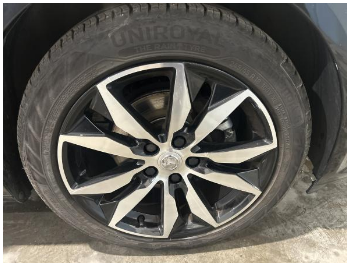
2: Wheel osf Scratched Up To 50mm