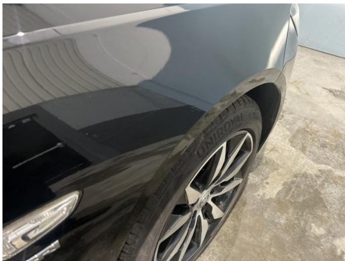
1: Wing osf Scratched Over 25mm Not Thru Paint