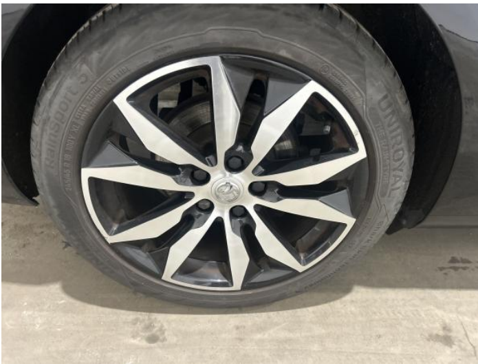
11: Wheel osr Scratched Up To 50mm