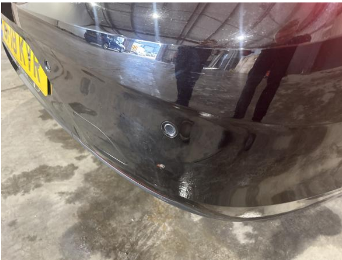
5: Bumper Rear Scratched Over 25mm Not Thru Paint