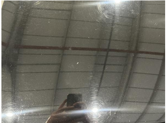
10: Bonnet Chipped 1 To 5