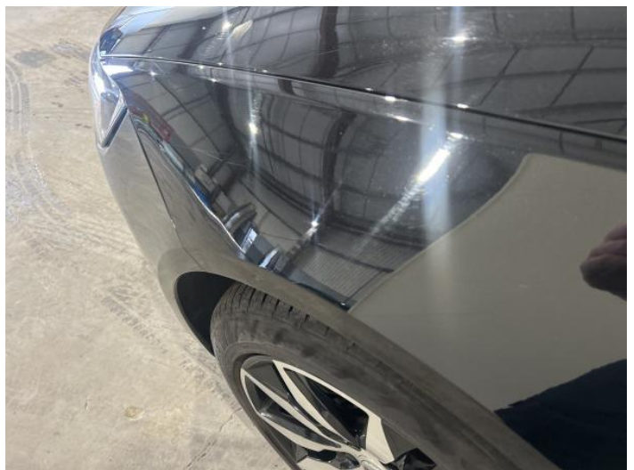
8: Wing nsf Scratched Over 25mm Not Thru Paint