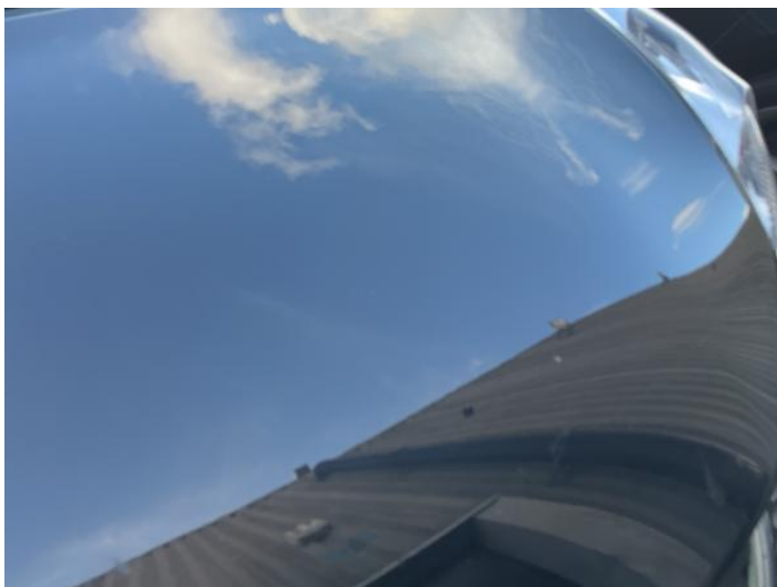
1: Bonnet Chipped 1 To 5