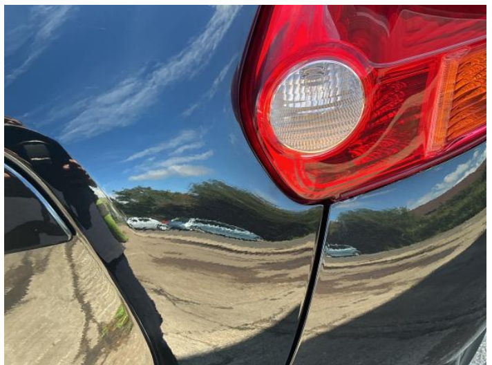
14: Boot Lid Dented Over 2 UpTo 10mm