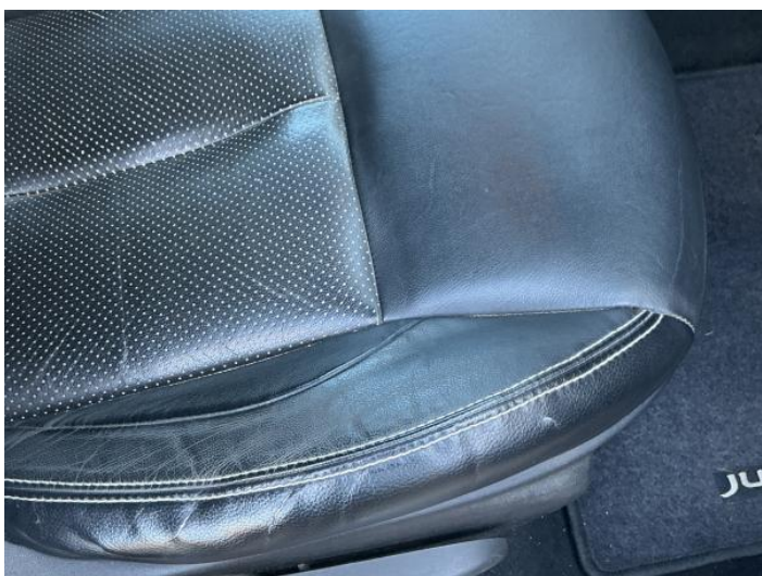
25: Seat Base Cover osf Torn UpTo 3mm