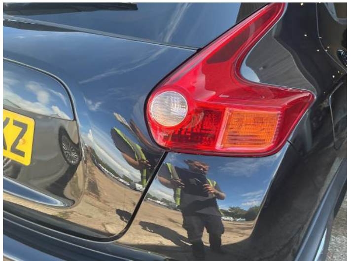
12: Bumper Rear Chipped Multiple Chips