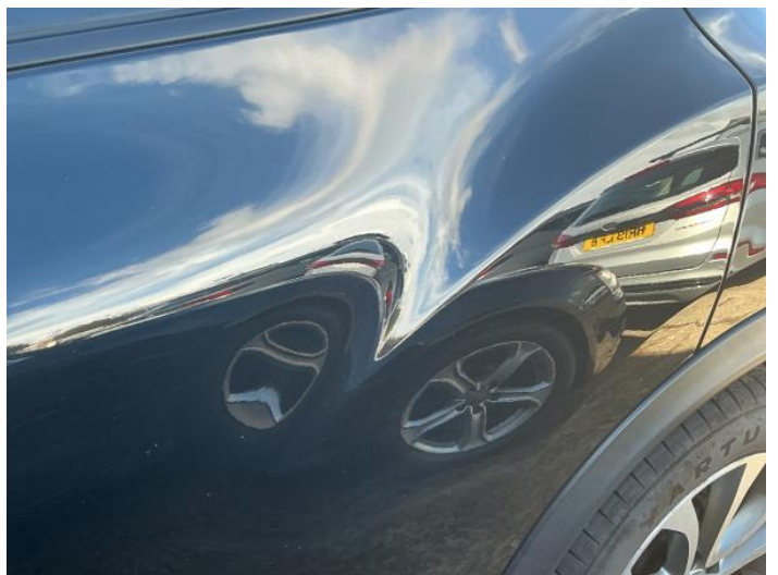
8: Door nsr Chipped 1 To 5