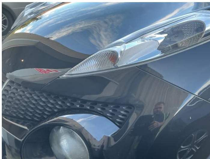
2: Bumper Front Chipped Multiple Chips