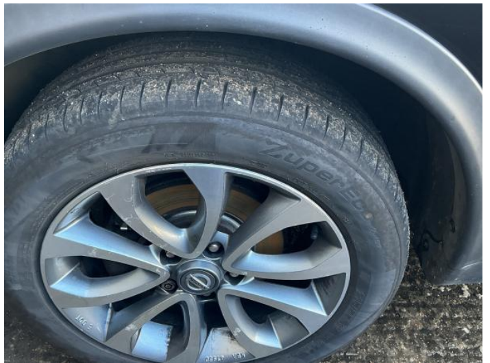
6: Wheel nsf Scratched Over 50mm