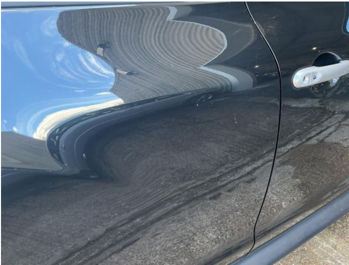
17: Door osr Chipped 1 To 5