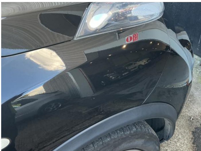
21: Wing osf Chipped 1 To 5