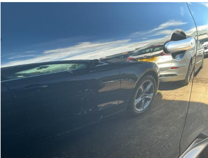
7: Door nsf Dented With Paint Damage