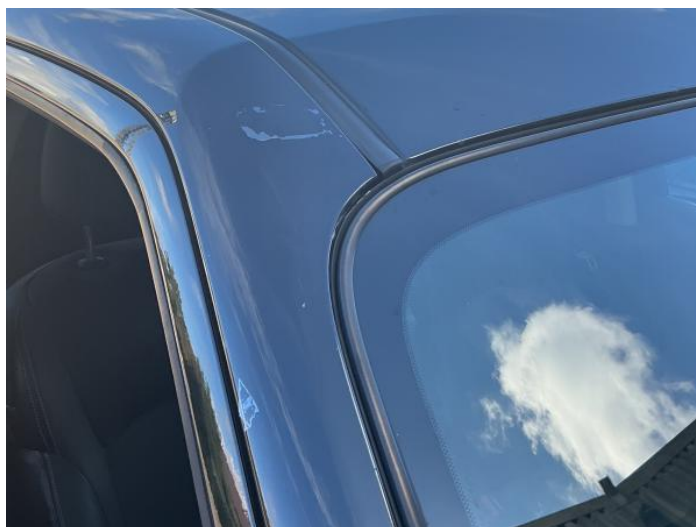
24: A Post os Poor Previous Repair Paint Flake