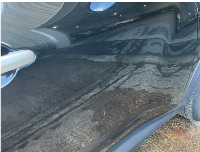
19: Door osf Chipped Multiple Chips