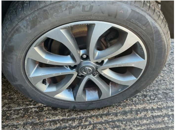
10: Wheel nsr Scratched Over 50mm