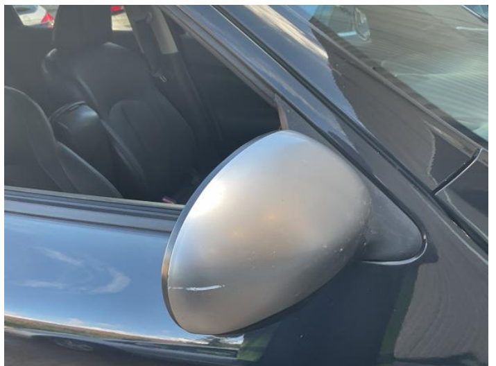
20: Door Mirror Assy osf Scratched (Painted) UpTo 25mm Thru Paint