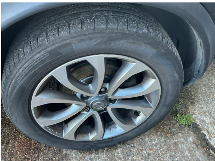
23: Wheel osf Scratched Up To 50mm