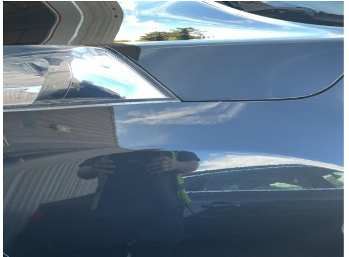
4: Wing nsf Chipped 1 To 5