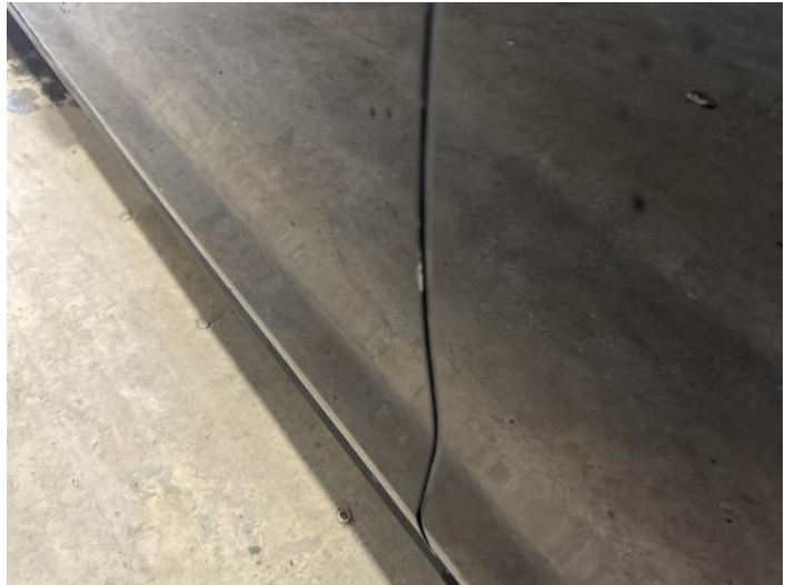
4: Door nsf Chipped Edge Chip