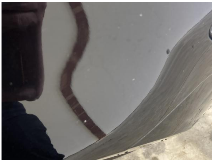
1: Wing osf Chipped 1 To 5