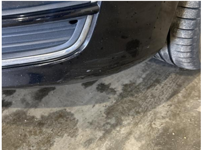
6: Bumper Front Scratched 25 to 100mm Thru Paint