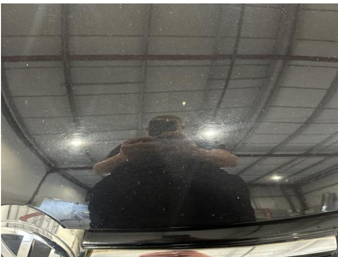
7: Bonnet Chipped 1 To 5