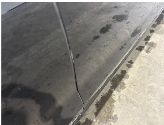
2: Door osf Chipped Edge Chip