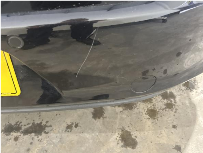
3: Bumper Rear Scratched 25 to 100mm Thru Paint