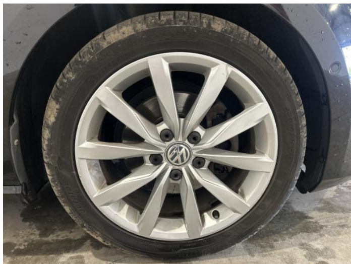
10: Wheel osf Scratched Over 50mm