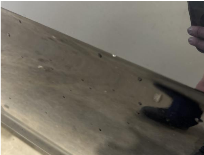
5: Door nsf Chipped 1 To 5