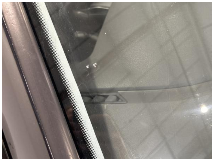
8: Screen Front Chipped UpTo 10mm