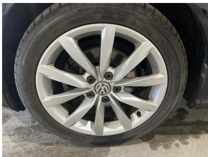
11: Wheel nsf Scratched Up To 50mm