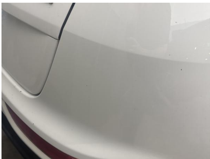
7: Bumper Rear Chipped Multiple Chips