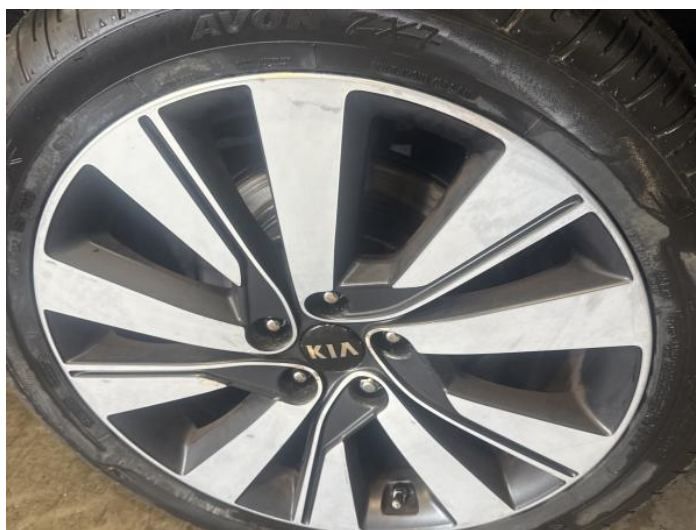
8: Wheel nsr Scratched Over 50mm