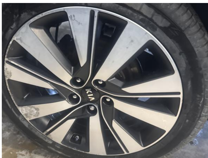
6: Wheel osr Scratched Over 50mm