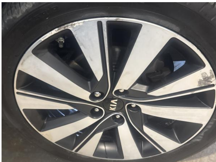
3: Wheel osf Scratched Over 50mm