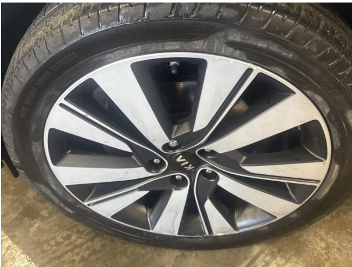
11: Wheel nsf Scratched Over 50mm