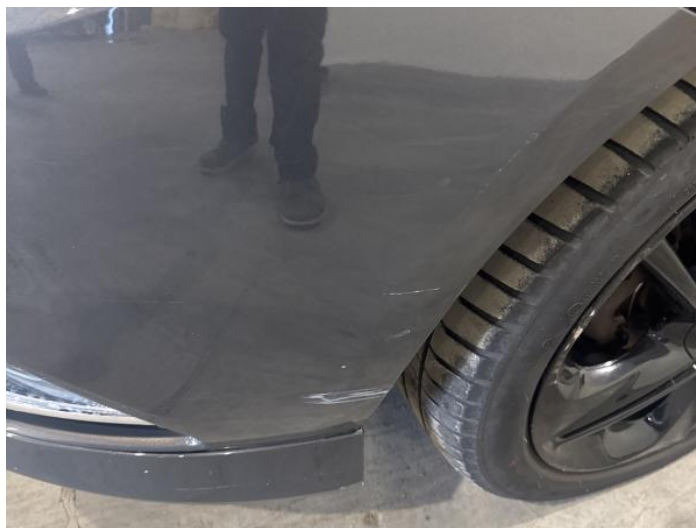
2: Bumper Front Scratched 25 to 100mm Thru Paint