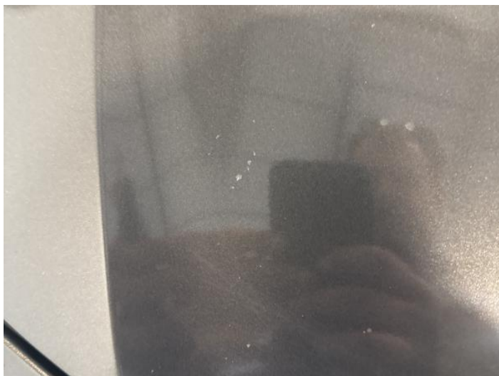
1: Bonnet Chipped 1 To 5