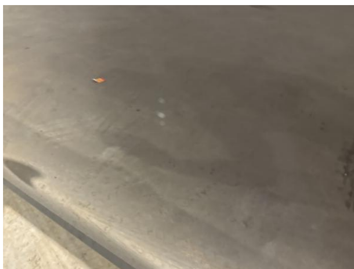
12: Door nsf Chipped 1 To 5