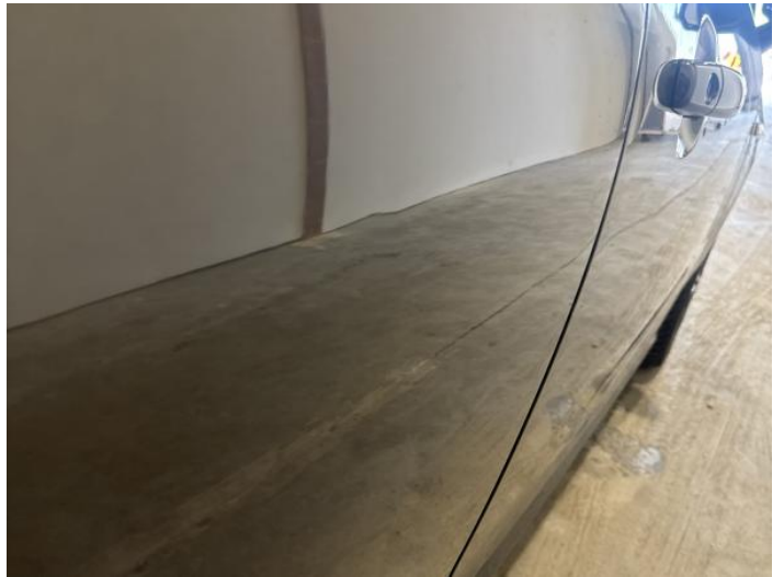
6: Qtr Panel osr Dented With Paint Damage