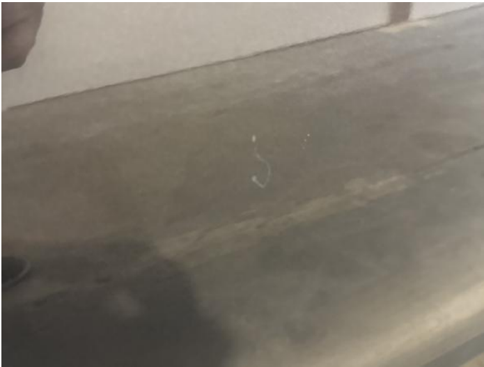
5: Door osf Chipped 1 To 5