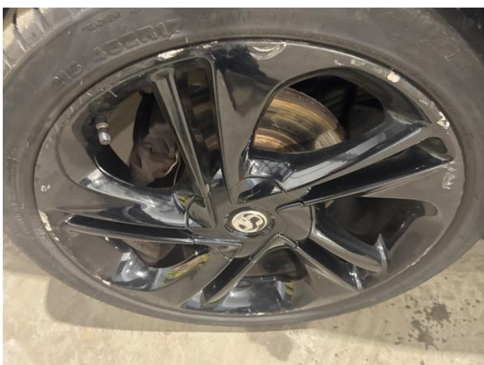
13: Wheel nsf Scratched Over 50mm