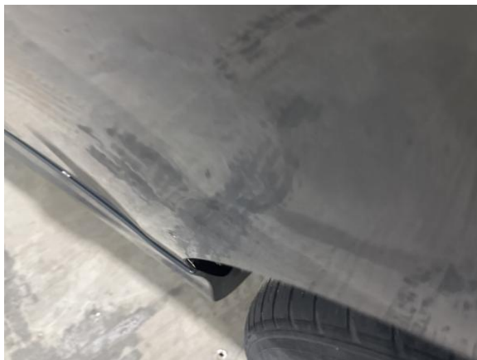
10: Qtr Panel nsr Dented Over 30mm