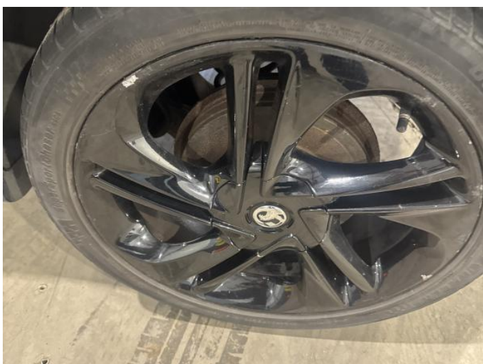
11: Wheel nsr Scratched Over 50mm