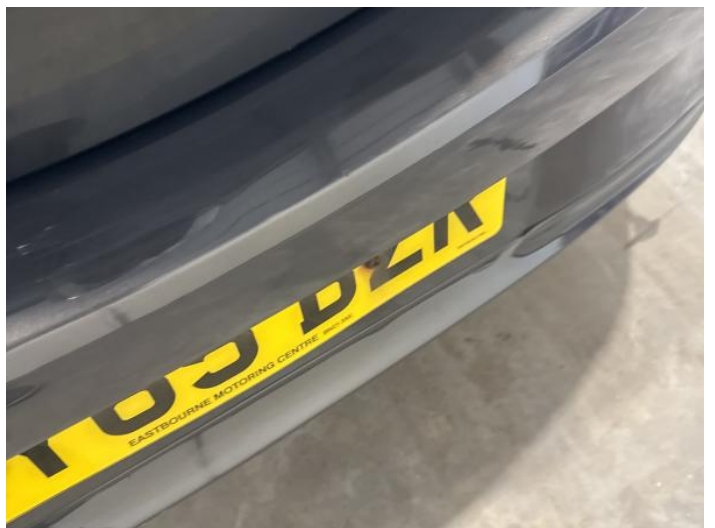
8: Bumper Rear Scratched 25 to 100mm Thru Paint