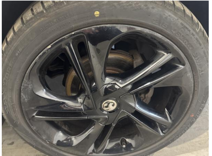
4: Wheel osf Scratched Over 50mm