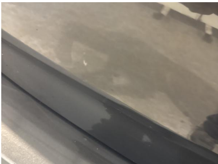
9: Boot Lid Chipped 1 To 5