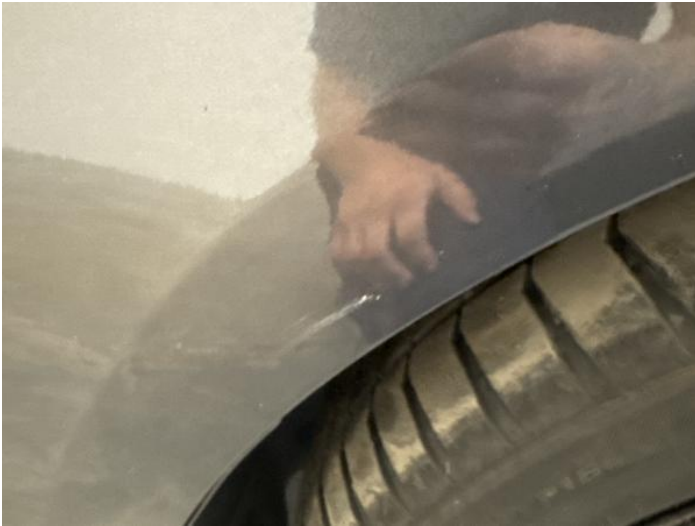
3: Wing osf Chipped 1 To 5