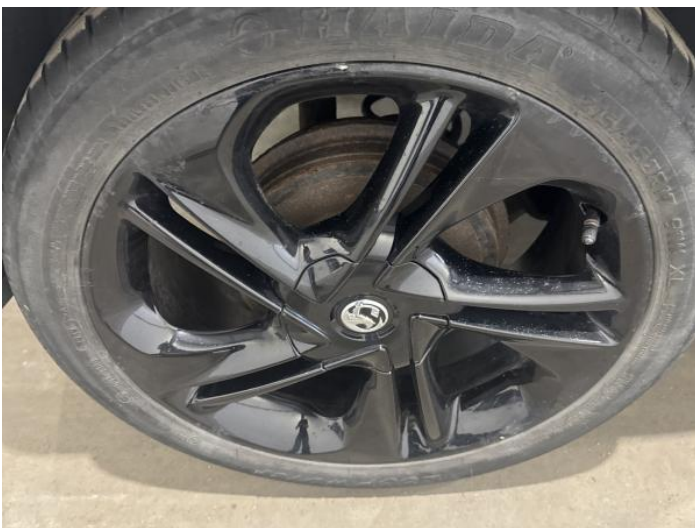
7: Wheel osr Scratched Over 50mm