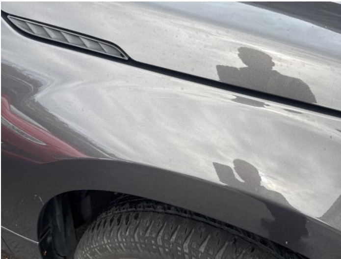
11: Wing osf Scratched Over 25mm Thru Paint