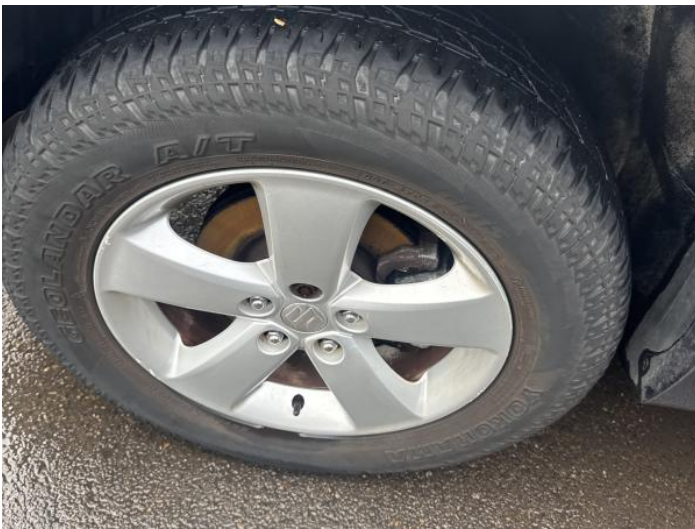
5: Wheel nsf Scratched Over 50mm