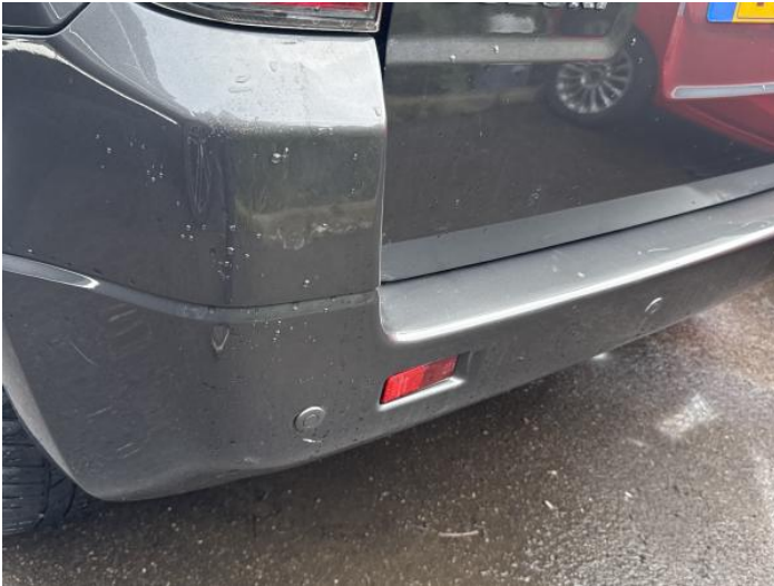
9: Bumper Rear Dented With Paint Damage