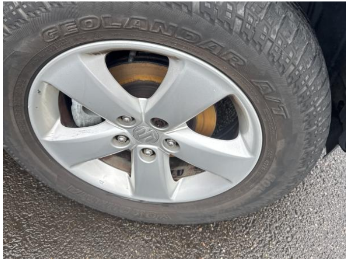
12: Wheel osf Scratched Over 50mm