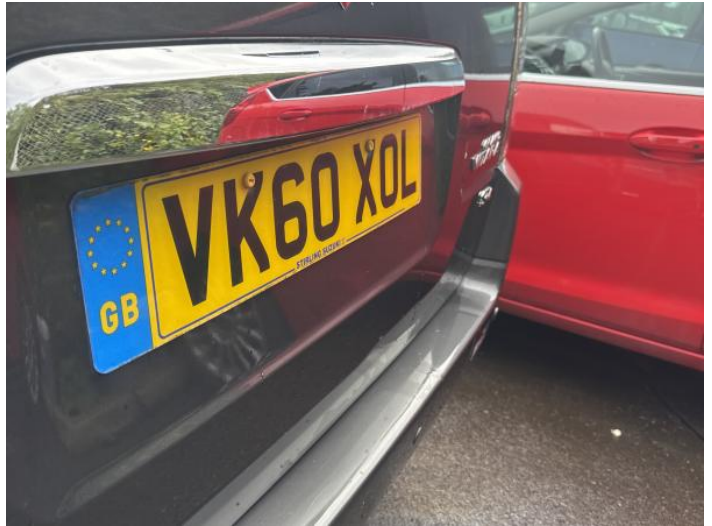
10: Boot Lid Dented Over 30mm