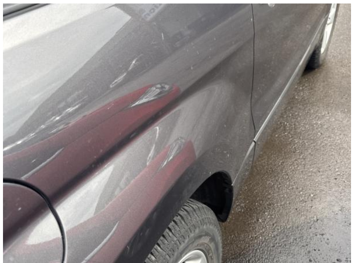
14: Qtr Panel osr Chipped 1 To 5