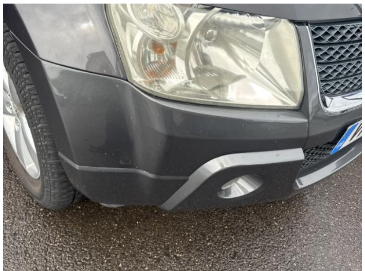
2: Bumper Front Poor Previous Repair Poor Colour