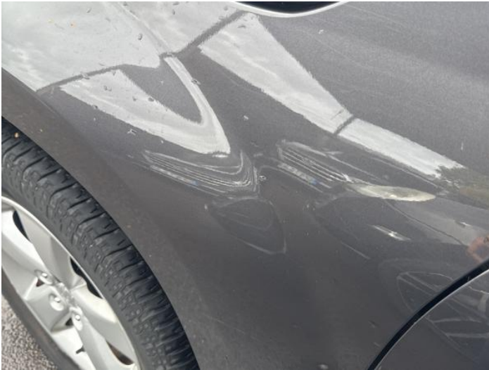
3: Wing nsf Chipped 1 To 5