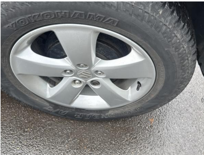
17: Wheel nsr Scratched Up To 50mm