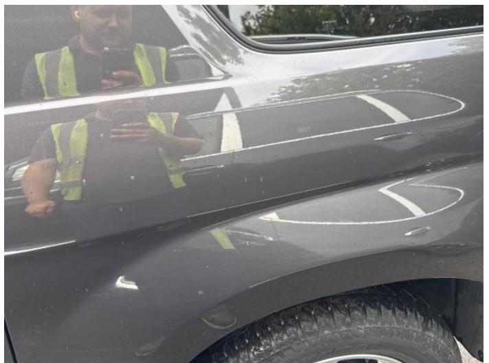
8: Qtr Panel nsr Dented Over 30mm