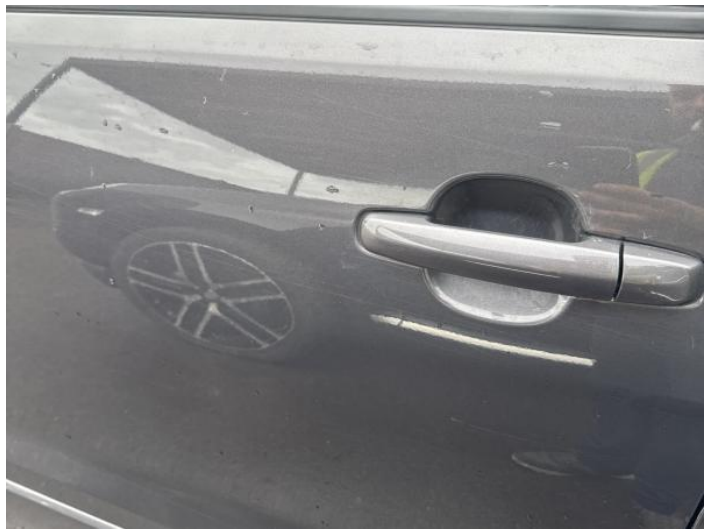
6: Door nsf Chipped 1 To 5