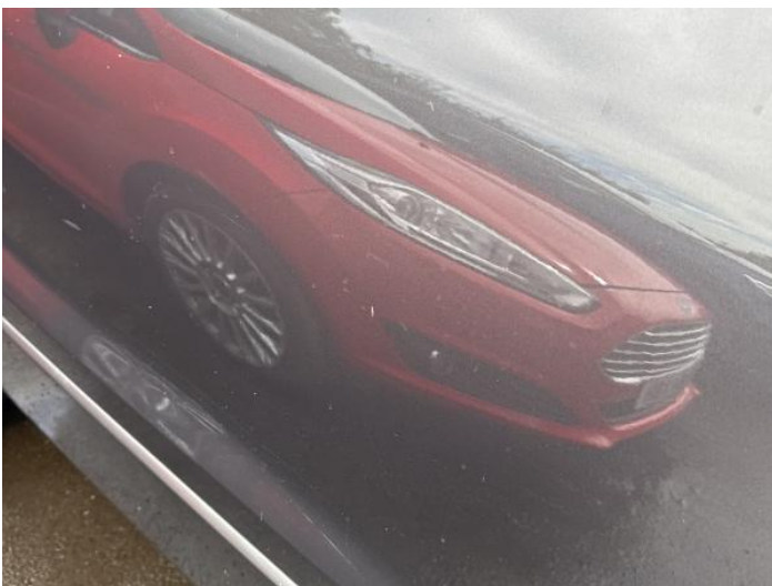
13: Door osf Scratched Over 25mm Thru Paint