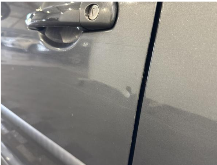
5: Door osf Dented With Paint Damage