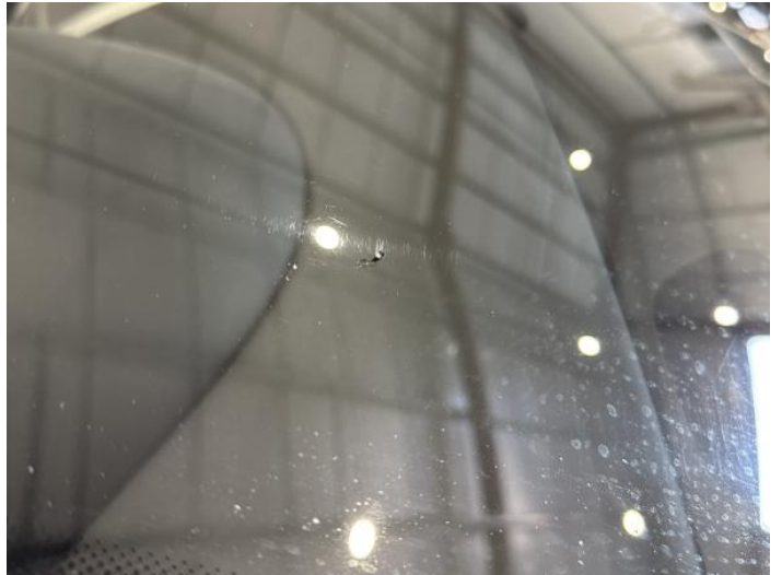
16: Screen Front Chipped UpTo 10mm