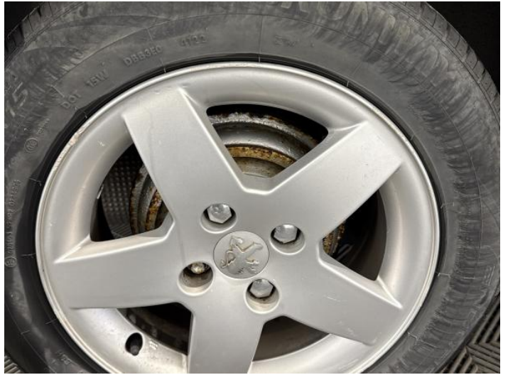
10: Wheel osr Scratched Over 50mm