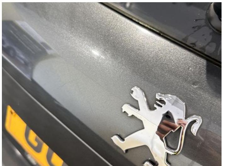
8: Tailgate Scratched Over 25mm Thru Paint