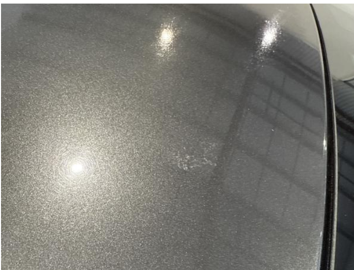
13: Roof Scratched Rusted