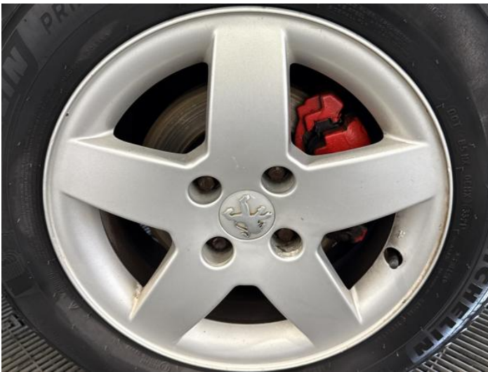
17: Wheel osf Scratched Up To 50mm