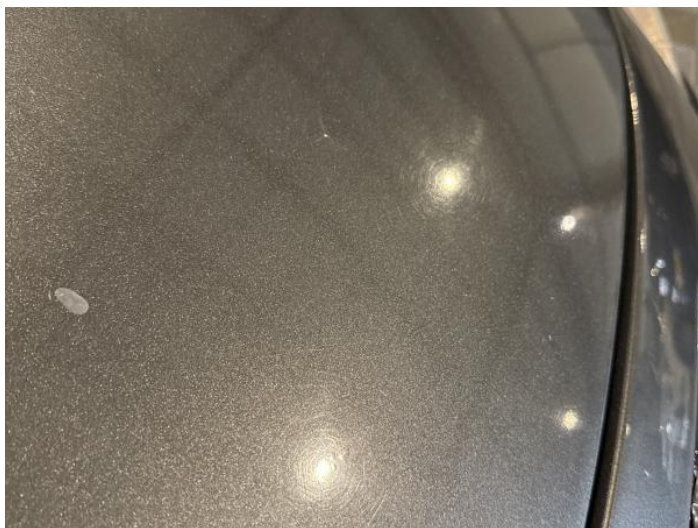
1: Bonnet Dented With Paint Damage