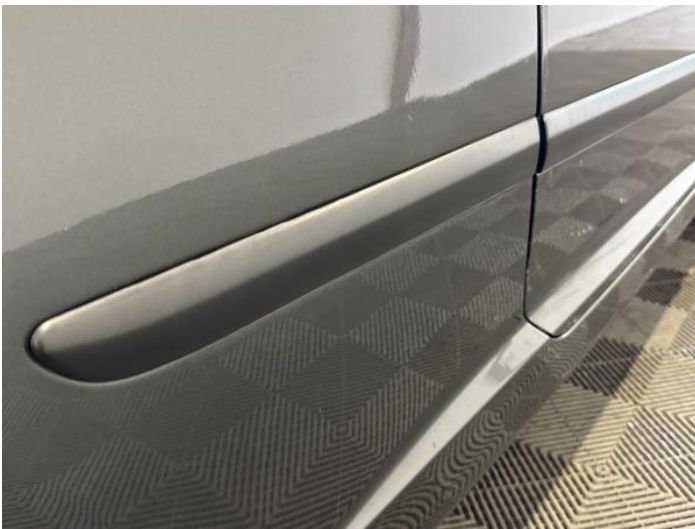
11: Qtr Panel osr Dented Over 30mm