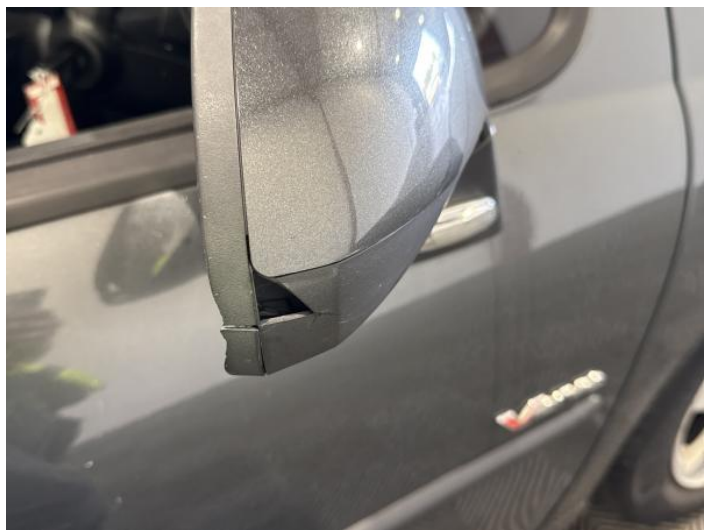
14: Door Mirror Assy osf Broken Replace