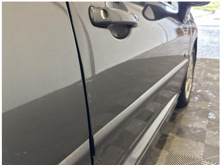
12: Door osf Dented Over 30mm