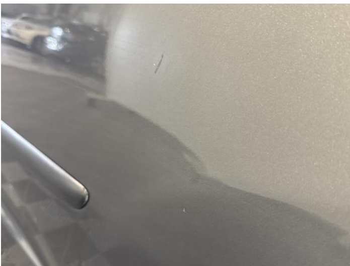
7: Qtr Panel nsr Dented With Paint Damage