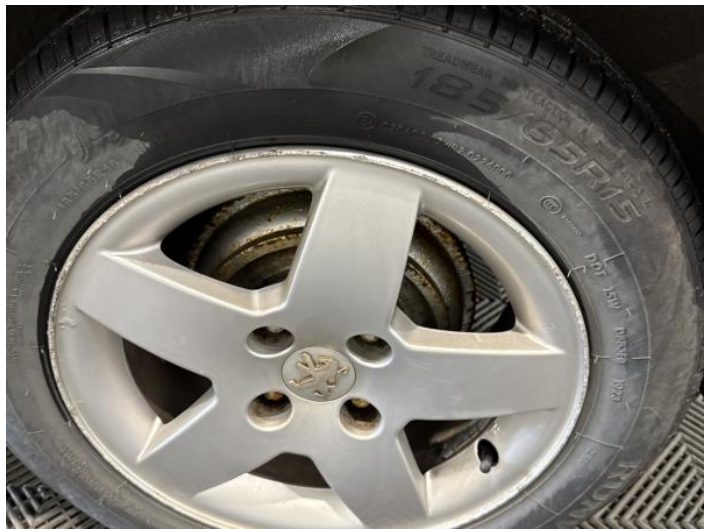
6: Wheel nsr Scratched Over 50mm