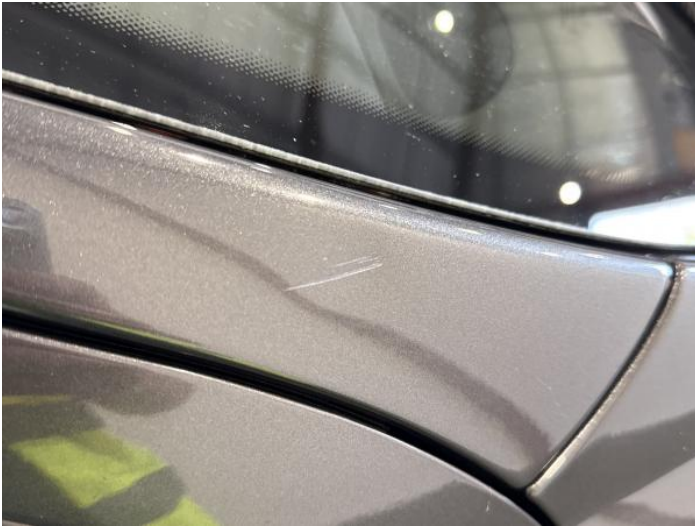
15: A Post os Dented Between 10mm + 30mm