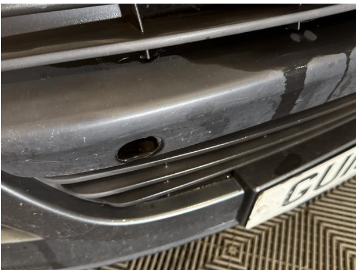
19: Front TowEye Cvr Missing Replace