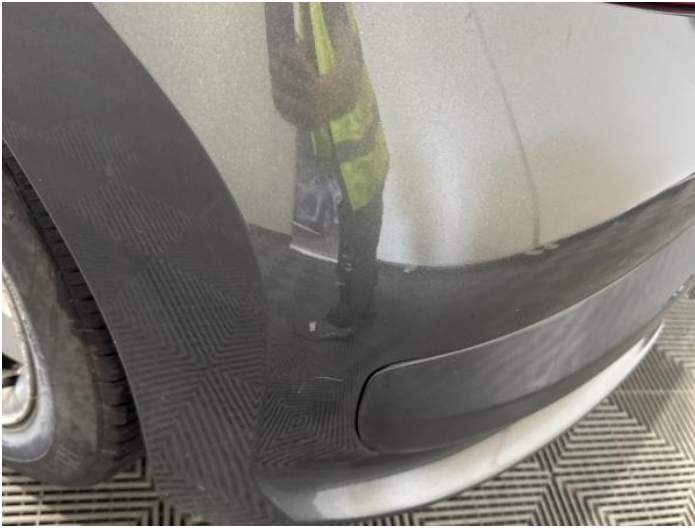
9: Bumper Rear Scratched 25 to 100mm Thru Paint