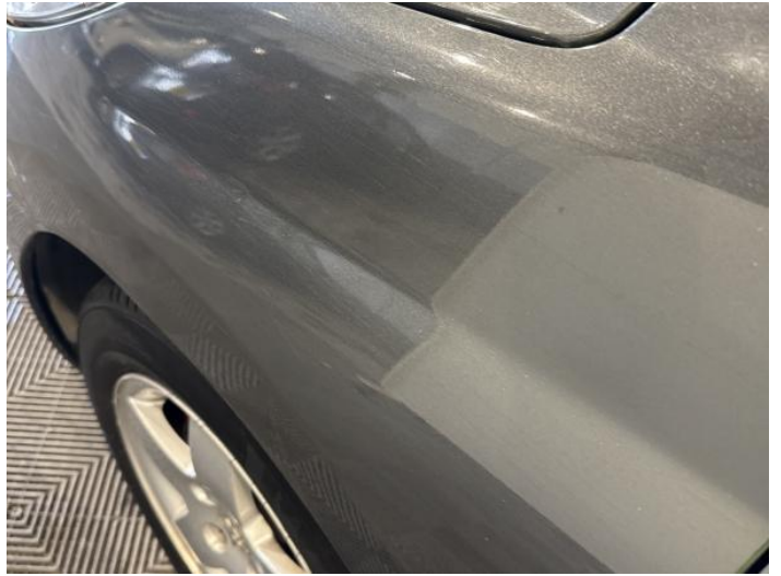
4: Wing nsf Scratched Over 25mm Thru Paint