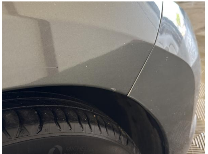
18: Wing osf Scratched Over 25mm Thru Paint