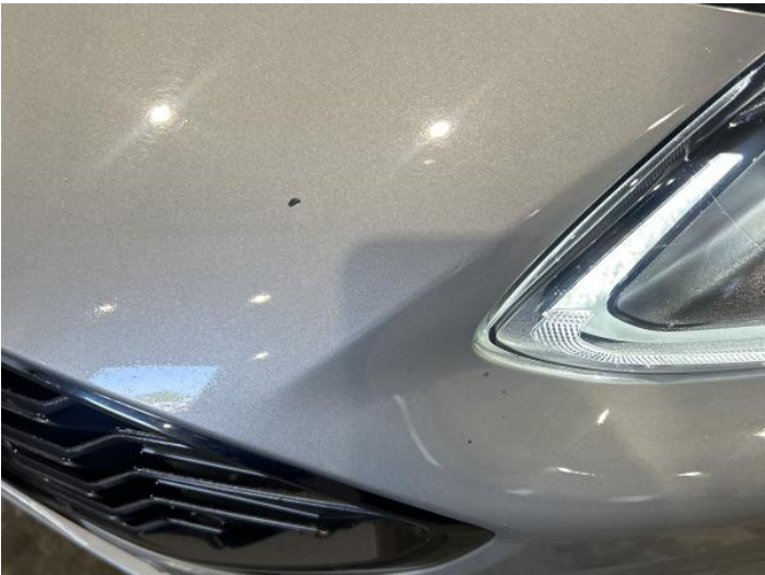
1: Bumper Front Chipped 1 To 5