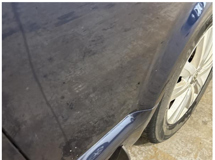
8: Qtr Panel osr Chipped 1 To 5