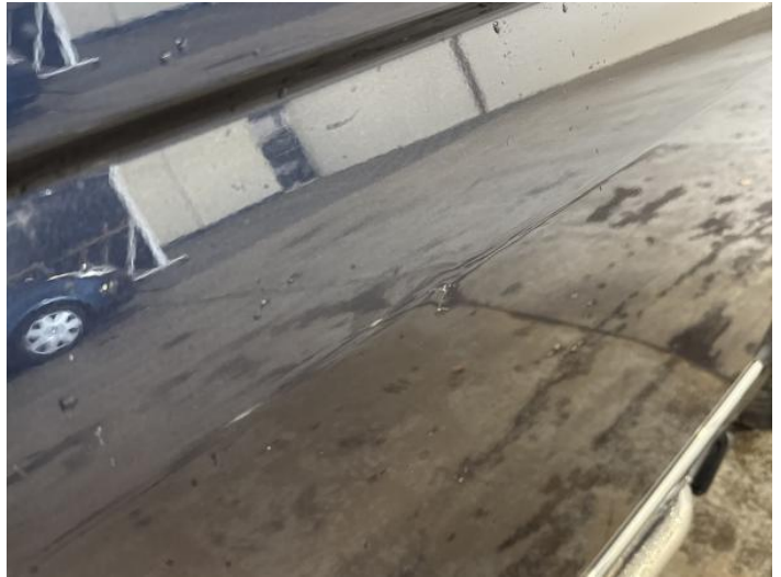
4: Door osf Dented Between 10mm + 30mm