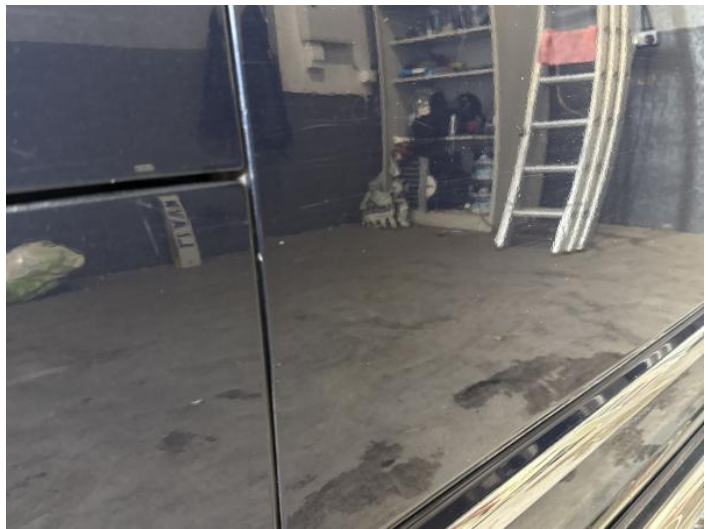
12: Door nsr Scratched Over 25mm Thru Paint