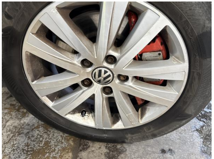
6: Wheel osf Scratched Over 50mm