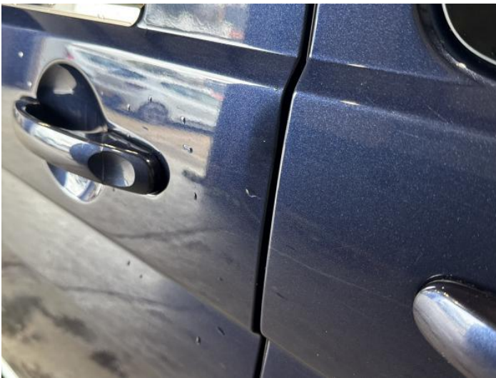
11: Door nsf Dented Over 30mm