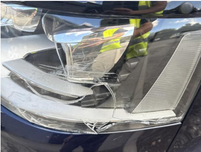
17: Headlamp ns Broken Replace