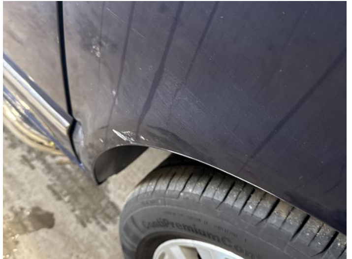
10: Qtr Panel nsr Scratched Over 25mm Thru Paint