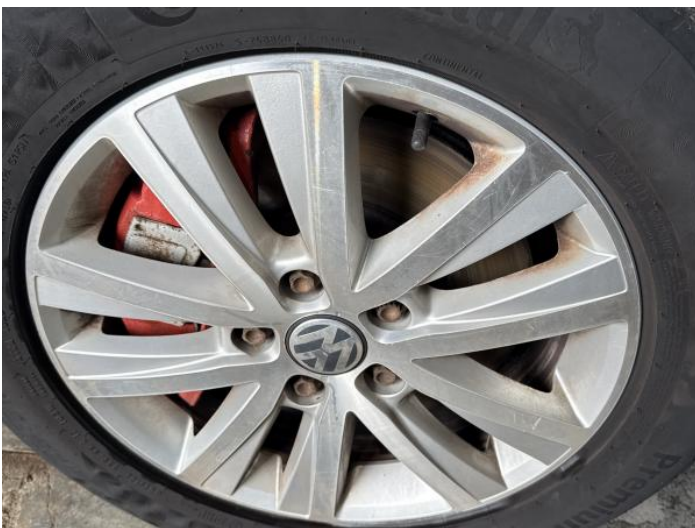
13: Wheel nsf Scratched Up To 50mm