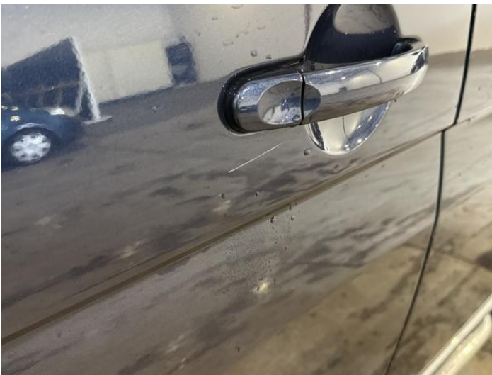
5: Door osr Scratched Over 25mm Thru Paint