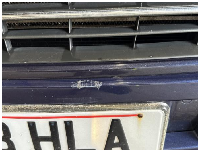
2: Bumper Front Scratched Over 100mm Thru Paint