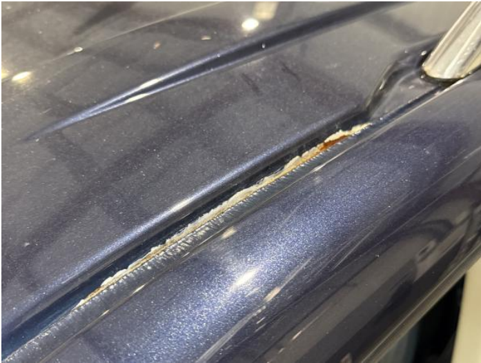
15: Roof Poor Previous Repair Paint Flake