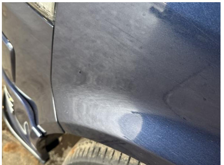
14: Wing nsf Scratched Over 25mm Thru Paint