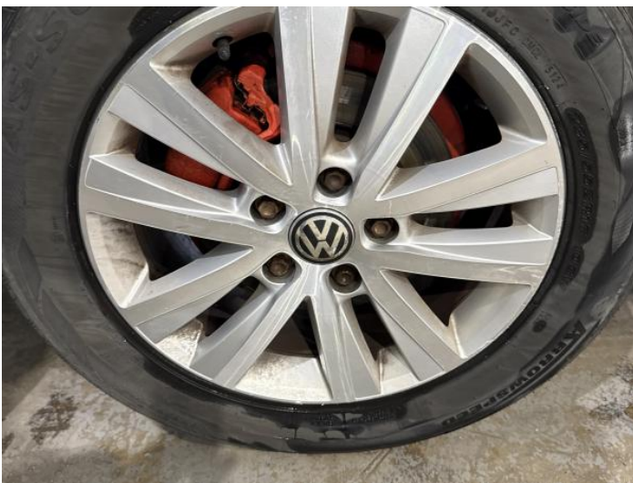
7: Wheel osr Scratched Up To 50mm