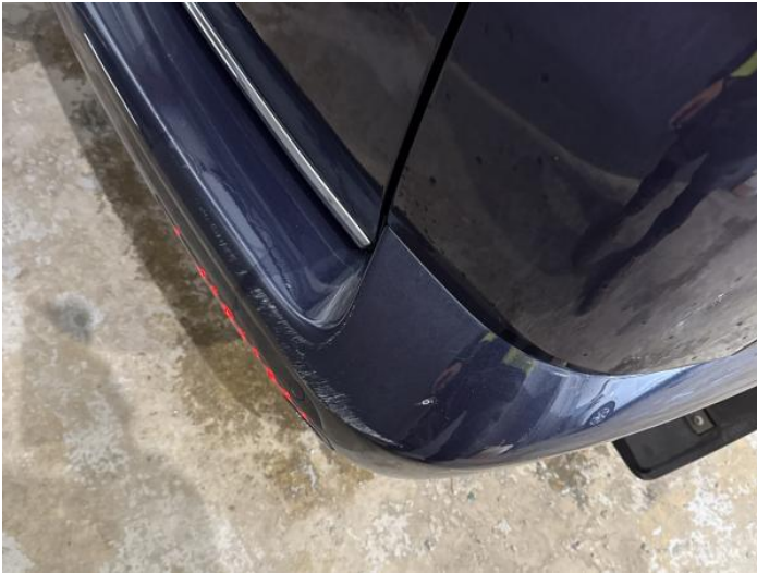
9: Bumper Rear Scratched Over 100mm Thru Paint