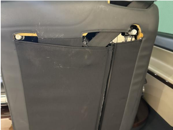
16: Seat Back Cover osf Scuffed Over 25mm