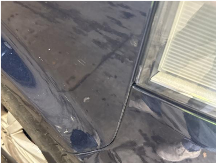
3: Wing osf Scratched UpTo 25mm Thru Paint