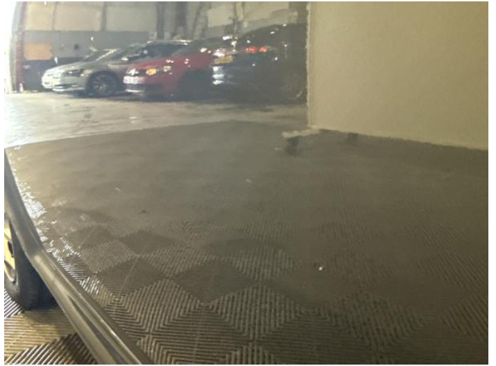
4: Door nsf Dented Over 30mm