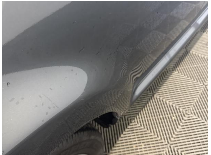
6: Door osr Scratched Over 25mm Thru Paint