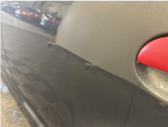
5: Door nsr Dented Between 10mm + 30mm