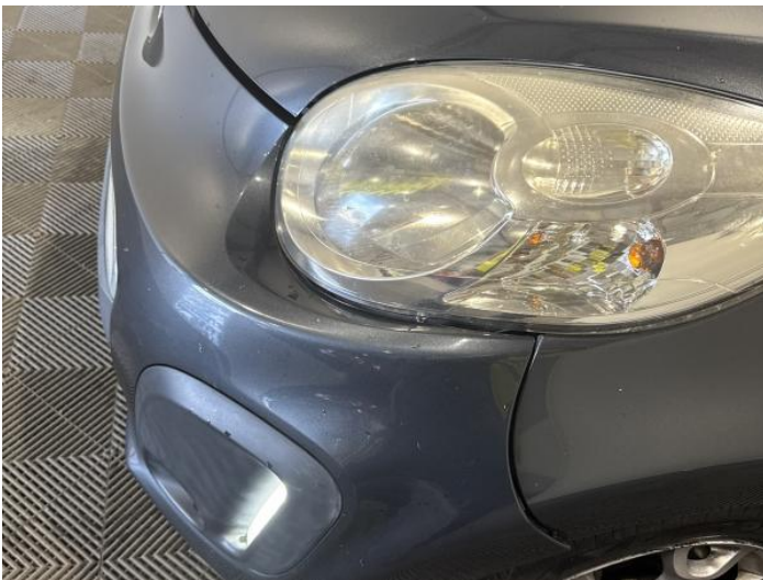
1: Bumper Front Insecure Action Required