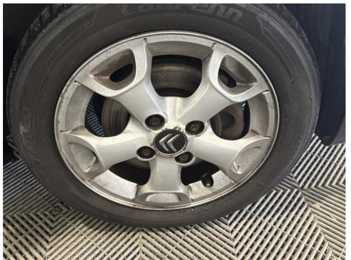
8: Wheel osf Scratched Up To 50mm