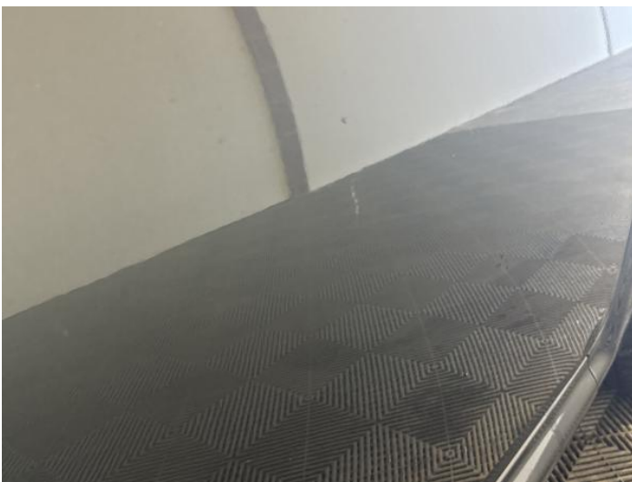
7: Door osf Scratched Up To 25mm Thru Paint