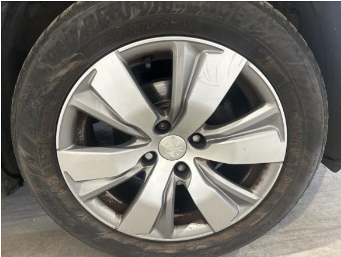
3: Wheel osf Scratched Over 50mm