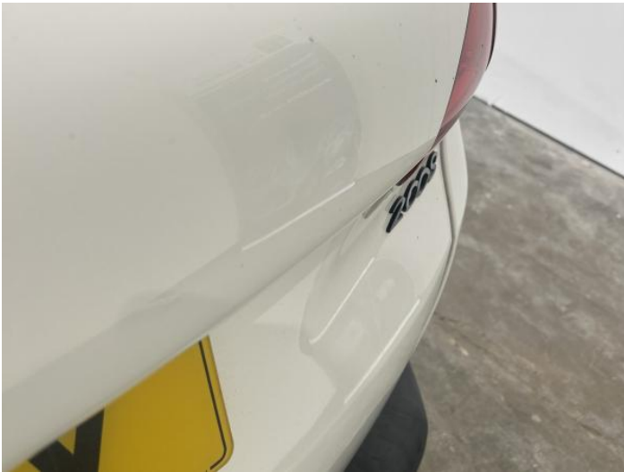
5: Tailgate Dented 2 Or Less UpTo 10mm