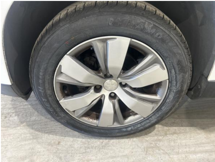
6: Wheel nsf Scratched Over 50mm