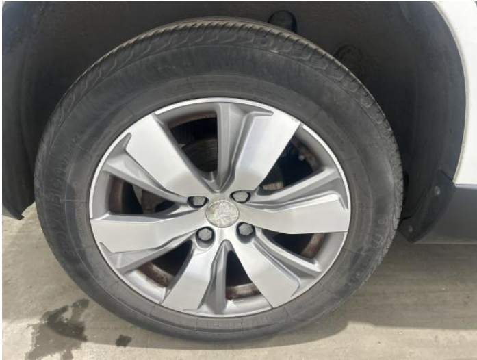
4: Wheel osr Scratched Up To 50mm