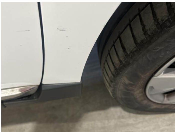
1: Wing osf Scratched UpTo 25mm Thru Paint