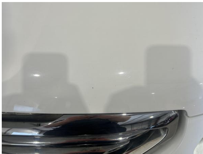
2: Bonnet Chipped 1 To 5