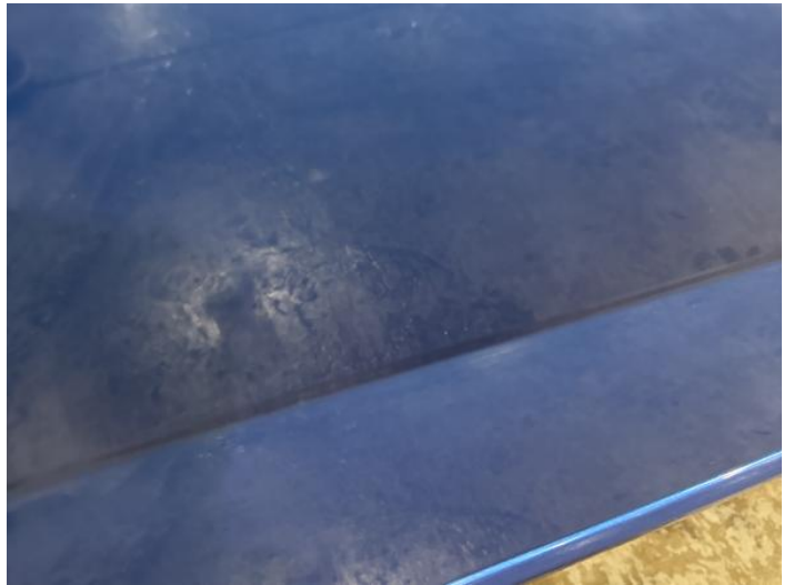
6: Door osr Chipped 1 To 5