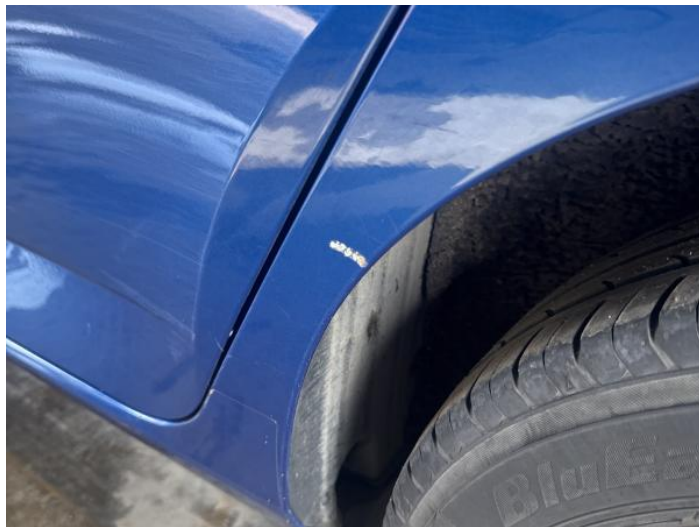
10: Qtr Panel nsr Scratched Over 25mm Thru Paint