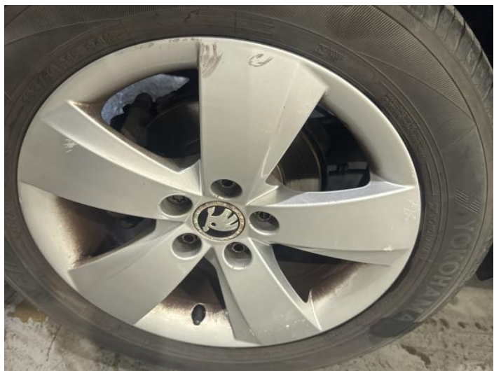
8: Wheel osr Scratched Over 50mm