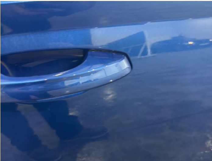
5: Door osf Chipped 1 To 5