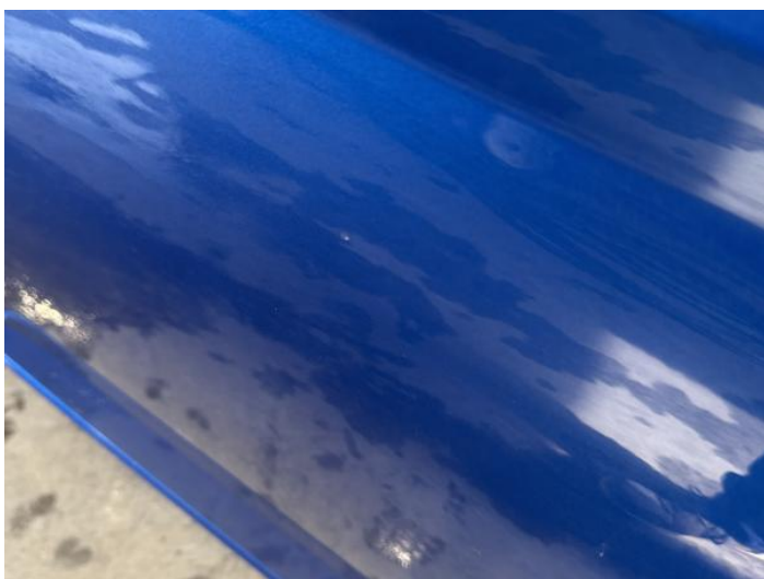
13: Door nsf Chipped 1 To 5