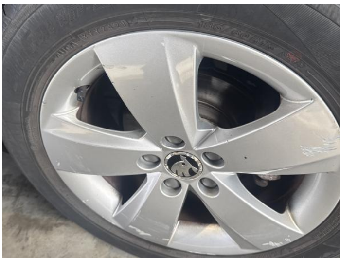
11: Wheel nsr Scratched Over 50mm