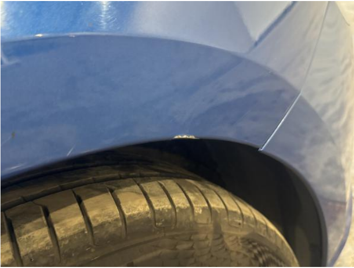
3: Wing osf Scratched Over 25mm Thru Paint