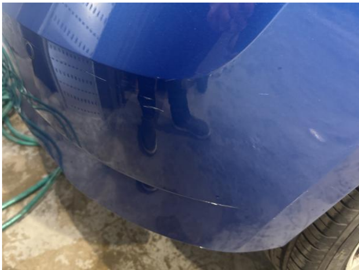
9: Bumper Rear Scratched Over 100mm Thru Paint