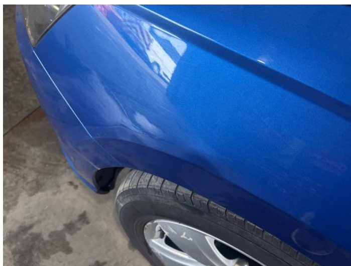
14: Wing nsf Dented Over 30mm