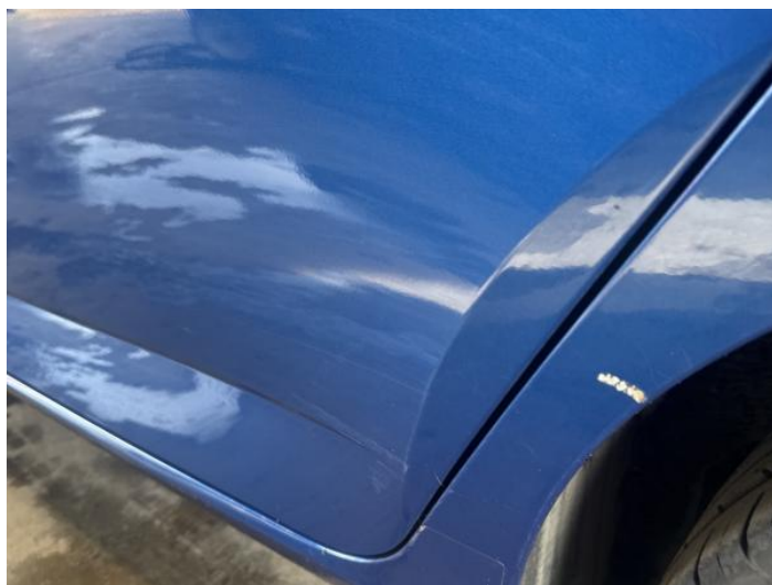
12: Door nsr Dented With Paint Damage