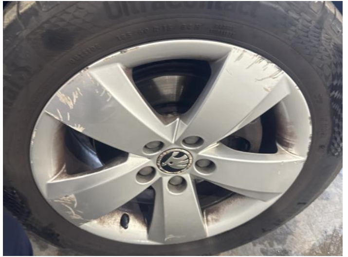
4: Wheel osf Scratched Over 50mm