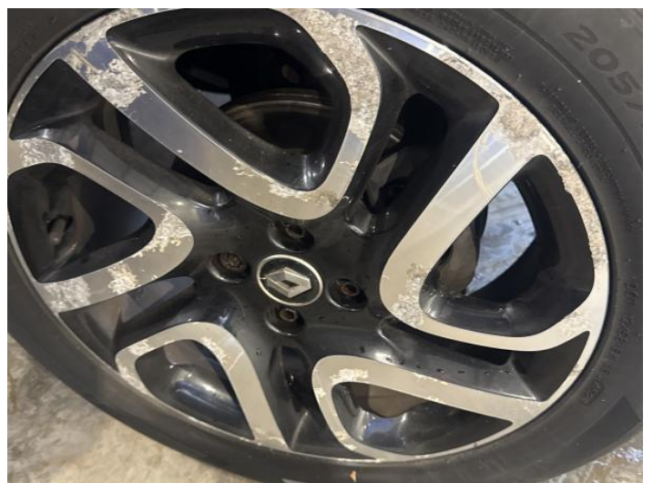
14: Wheel osf Corroded Light