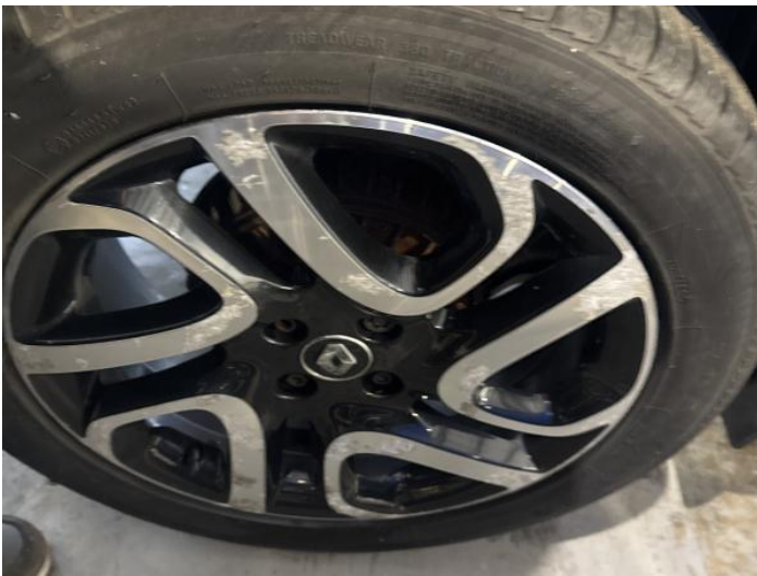
11: Wheel osr Corroded Light