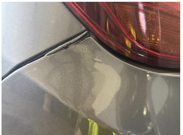
8: Bumper Rear Cracked Over 25mm