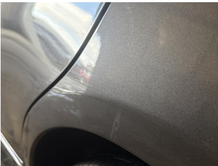
7: Qtr Panel nsr Chipped 1 To 5