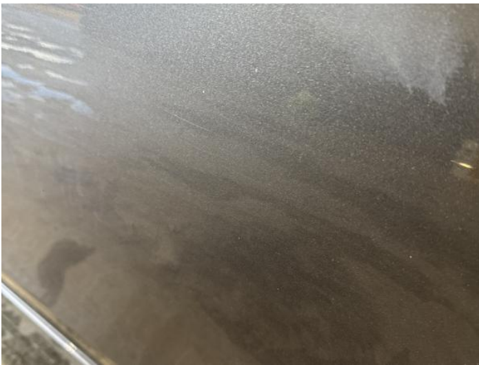
5: Door nsr Scratched Over 25mm Thru Paint