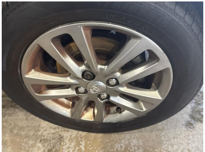
12: Wheel osf Scratched Up To 50mm