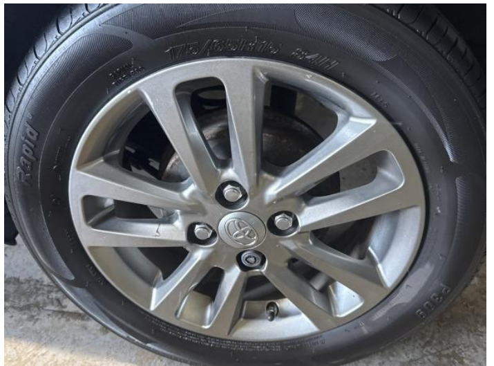
6: Wheel nsr Scratched Up To 50mm