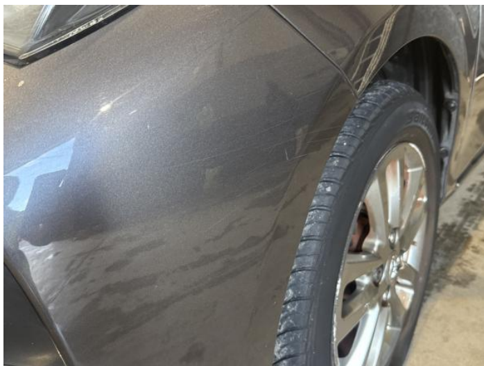
1: Bumper Front Scratched 25 to 100mm Thru Paint