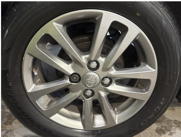
9: Wheel osr Scratched Up To 50mm