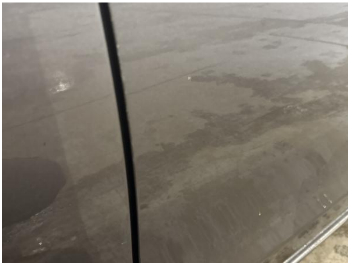
11: Door osf Chipped Edge Chip