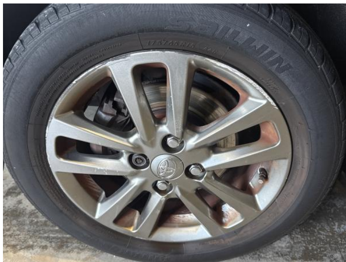
2: Wheel nsf Scratched Over 50mm