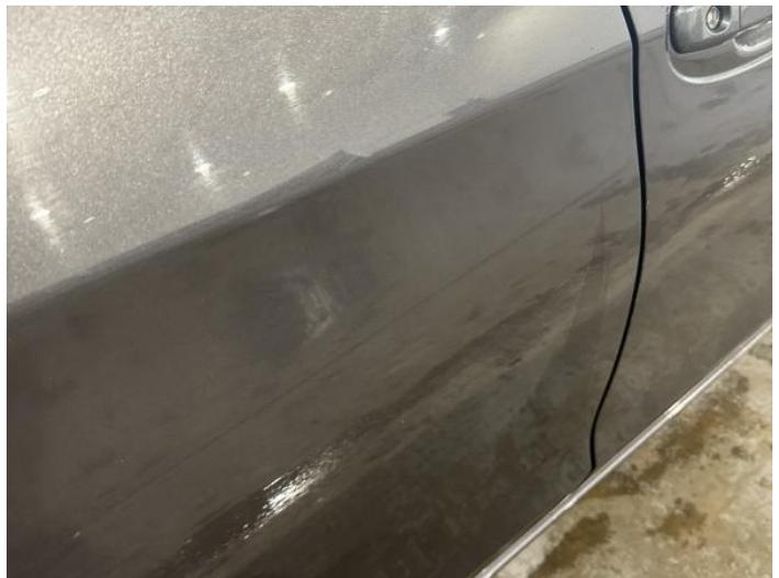
10: Door osr Chipped 1 To 5