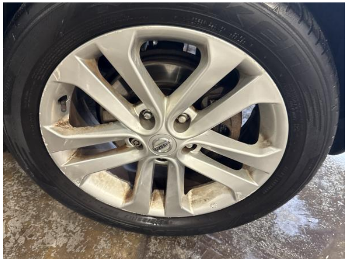
12: Wheel osf Scratched Over 50mm