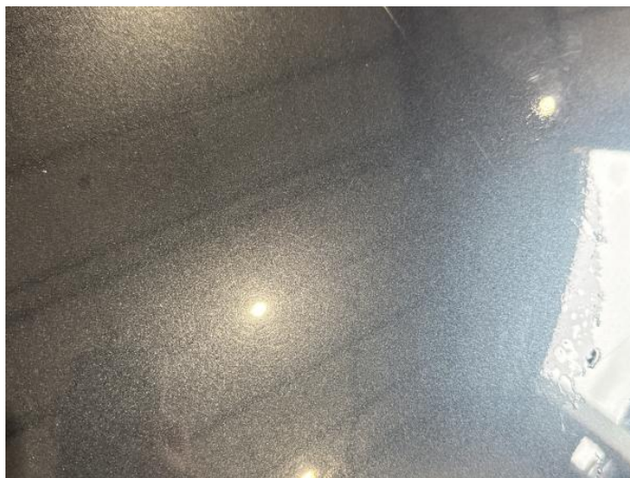
2: Bonnet Chipped 1 To 5