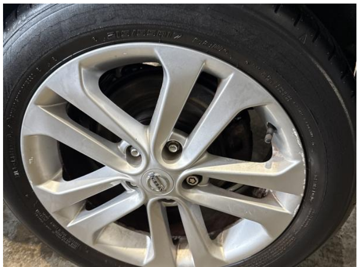
8: Wheel nsr Scratched Over 50mm