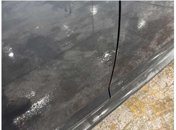
10: Door osr Scratched Over 25mm Thru Paint