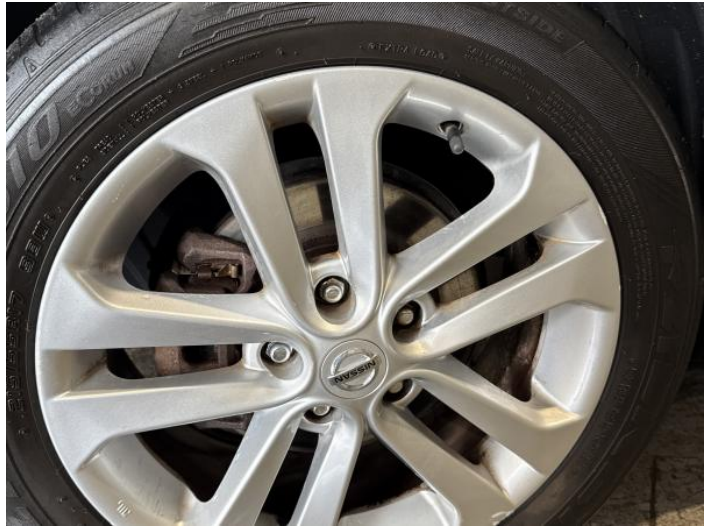
4: Wheel nsf Scratched Over 50mm