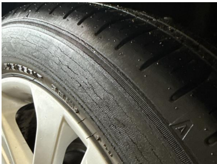
1: Tyre nsr Damaged Replace