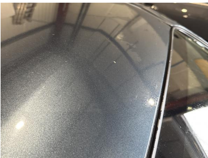
13: Roof Chipped 1 To 5