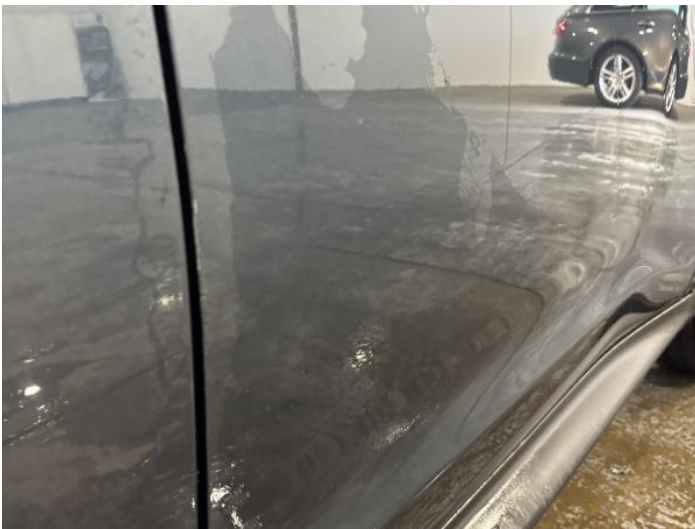
11: Door osf Scratched Over 25mm Thru Paint