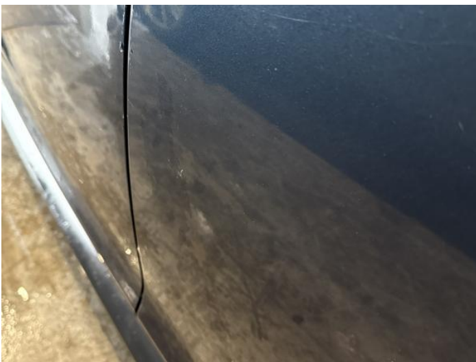
7: Door nsr Dented Between 10mm + 30mm