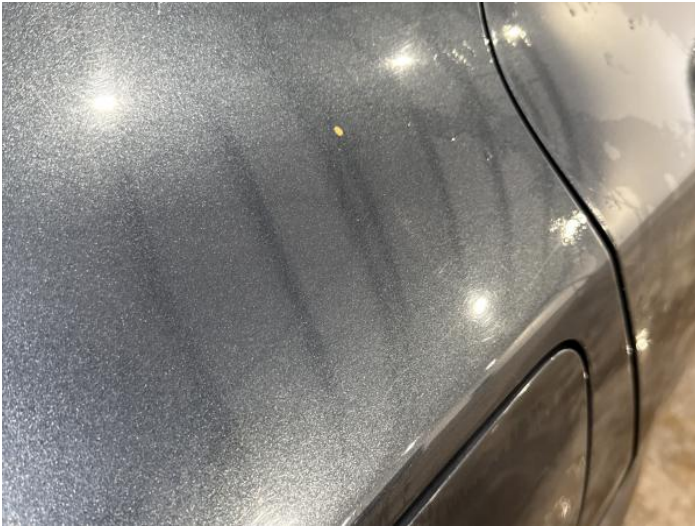
9: Qtr Panel osr Scratched UpTo 25mm Thru Paint