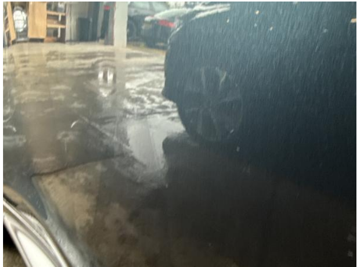
6: Door nsf Dented Over 30mm