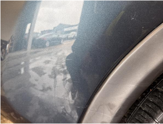
3: Bumper Front Scratched 25 to 100mm Thru Paint