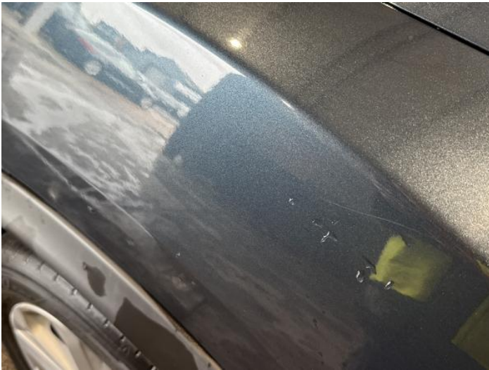
5: Wing nsf Scratched Over 25mm Thru Paint