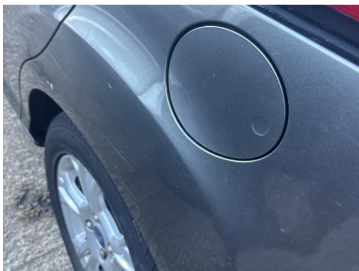
8: Qtr Panel nsr Scratched Over 25mm Thru Paint