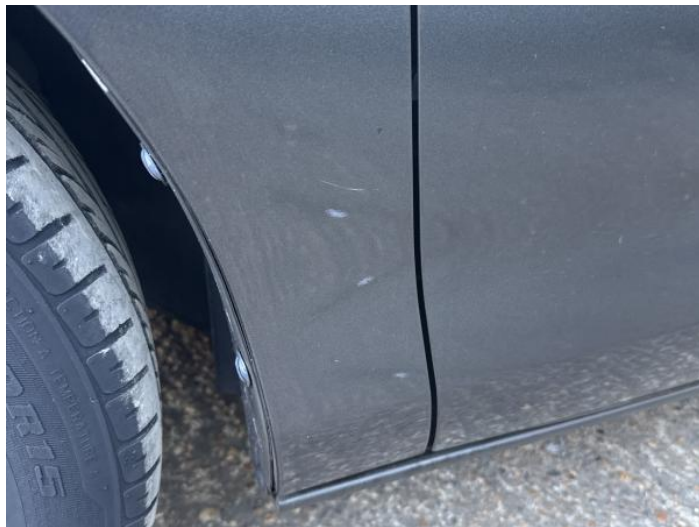
4: Wing nsf Scratched UpTo 25mm Thru Paint