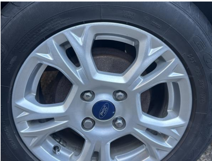
11: Wheel osr Scratched Up To 50mm