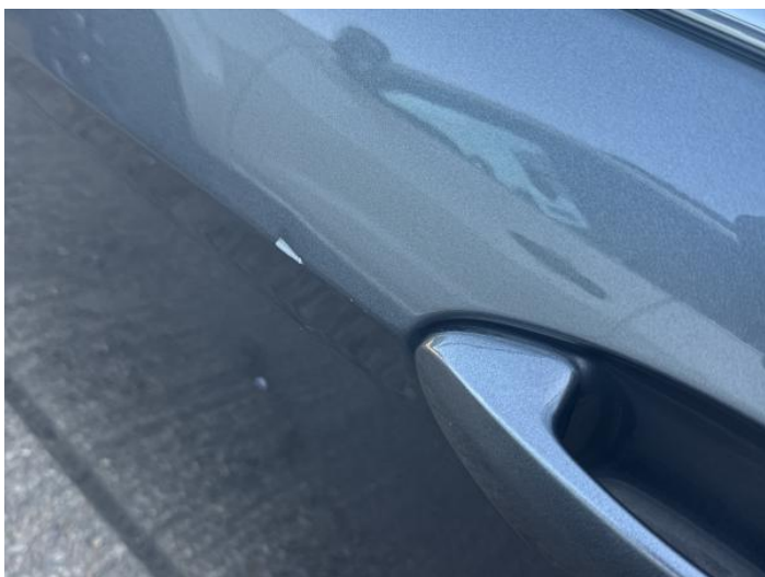
5: Door nsf Dented With Paint Damage