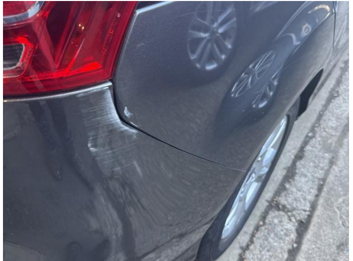
10: Qtr Panel osr Dented With Paint Damage