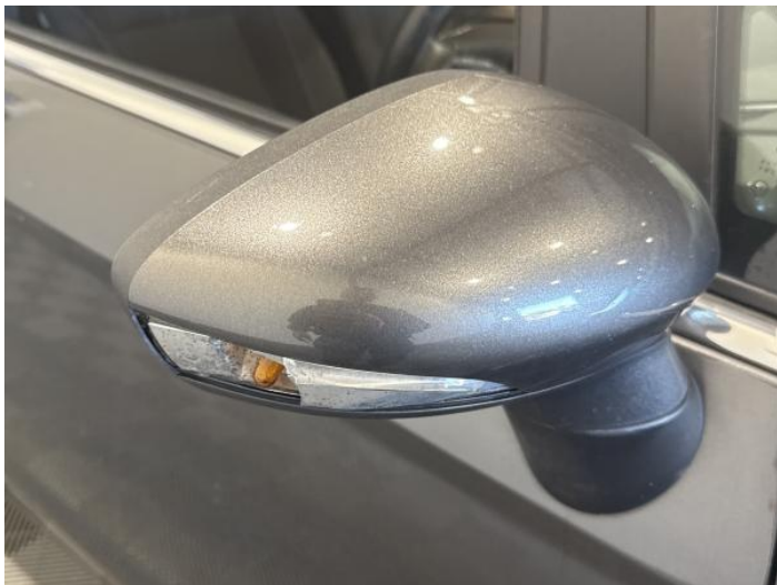
15: Flasher Side Repeater os Broken Replace