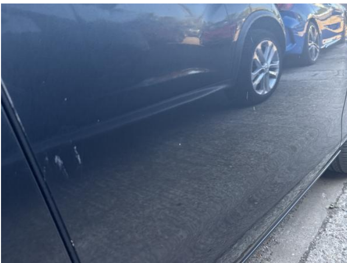
13: Door osf Dented With Paint Damage