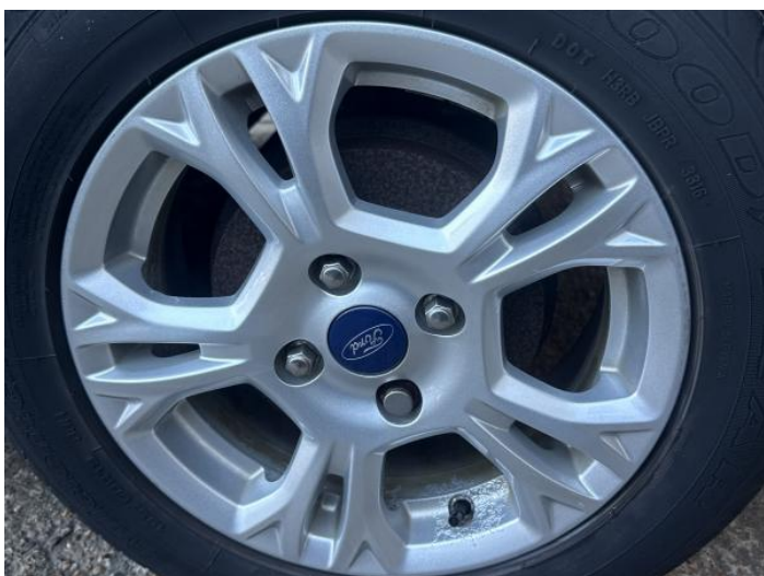
7: Wheel nsr Scratched Over 50mm