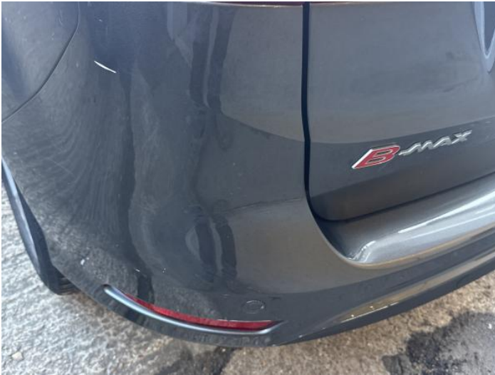
9: Bumper Rear Scratched Over 100mm Thru Paint