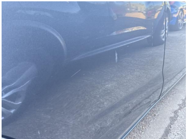
12: Door osr Scratched Over 25mm Thru Paint