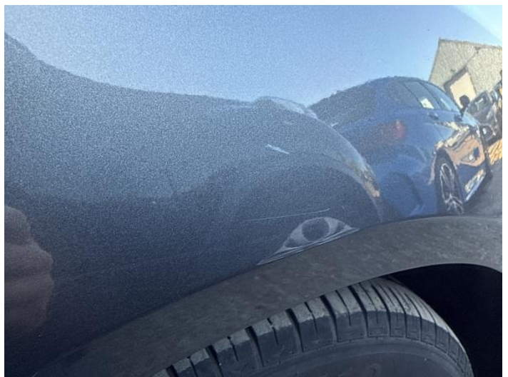
14: Wing osf Scratched UpTo 25mm Thru Paint