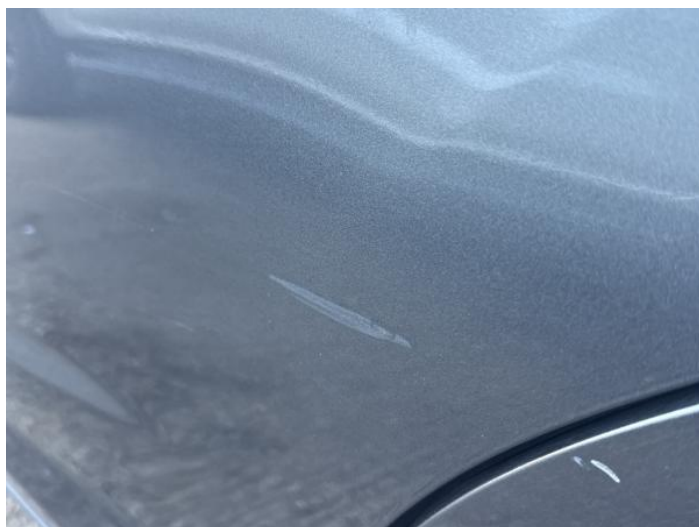
6: Door nsr Scratched Over 25mm Thru Paint