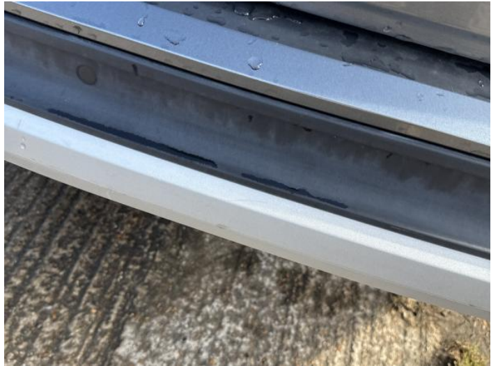
4: Bumper Rear Moulding Scuffed (Unpainted) UpTo 100mm