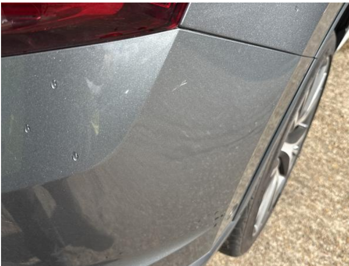
5: Bumper Rear Scratched Up To 25mm Thru Paint