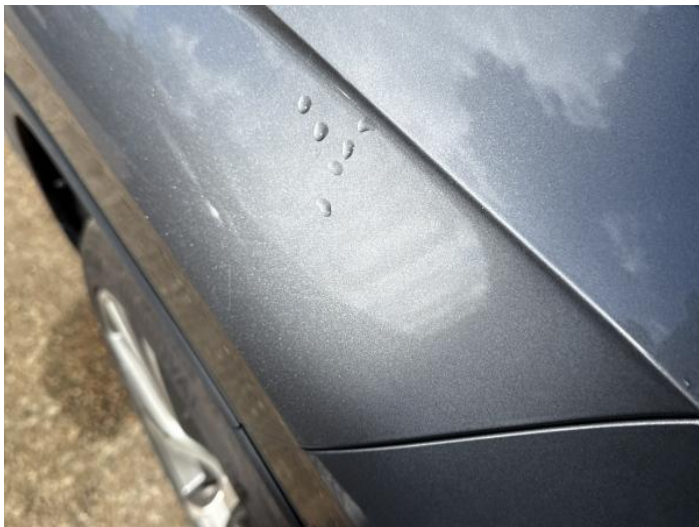
9: Wing osf Scratched UpTo 25mm Thru Paint