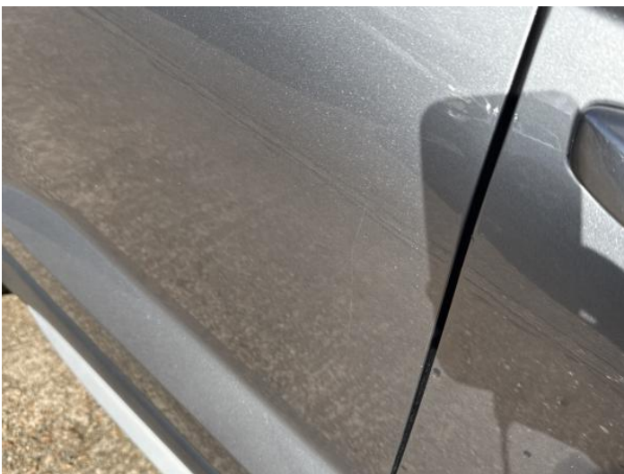
7: Door osr Scratched Over 25mm Thru Paint