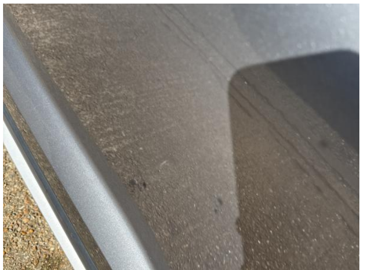
8: Door osf Scratched UpTo 25mm Thru Paint