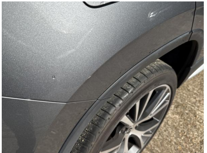
6: Qtr Panel osr Scratched UpTo 25mm Thru Paint