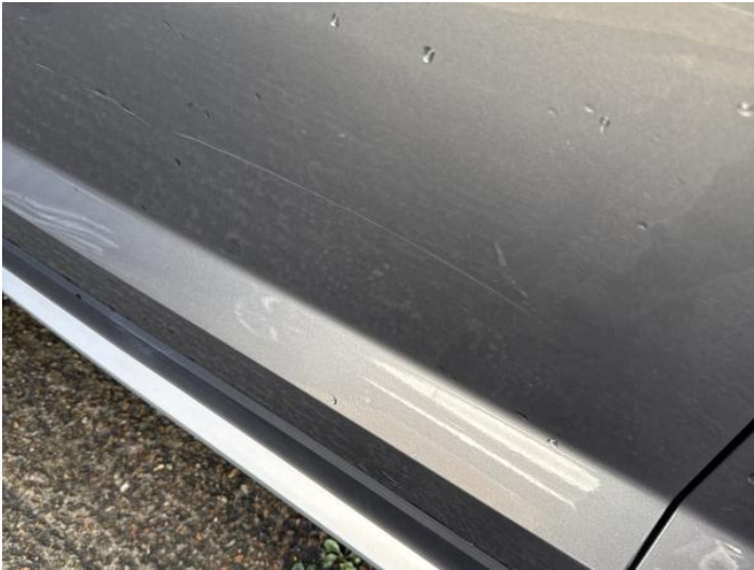
3: Door nsf Scratched Over 25mm Thru Paint