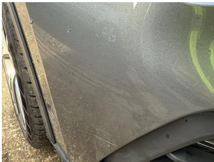
2: Bumper Front Scratched 25 to 100mm Thru Paint