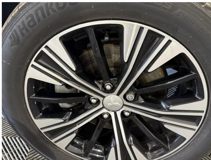
2: Wheel nsf Scratched Over 50mm