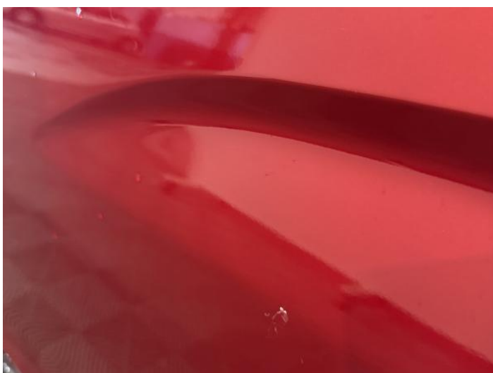
5: Door nsf Dented Between 10mm + 30mm