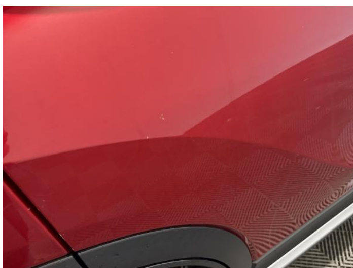
8: Door osr Chipped 1 To 5