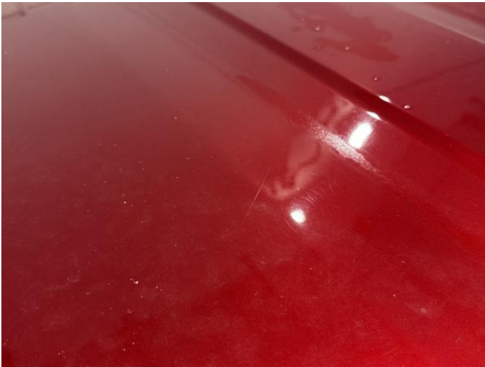
11: Roof Scratched Over 25mm Thru Paint