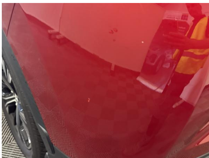
6: Bumper Rear Scratched Up To 25mm Thru Paint