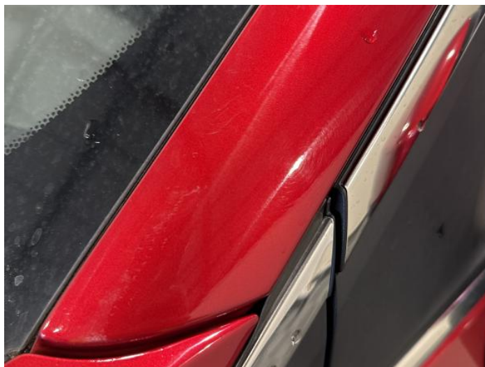
4: A Post ns Scratched Up To 25mm Thru Paint