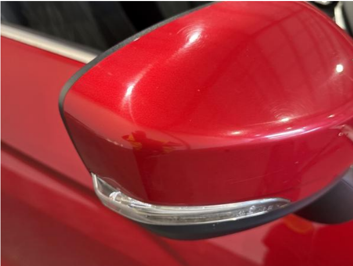
10: Door Mirror Assy osf Scratched (Painted) UpTo 25mm Thru Paint