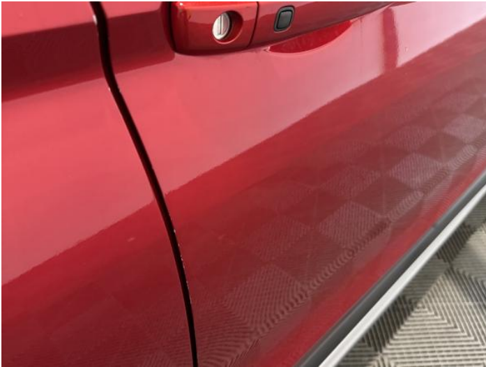
9: Door osf Chipped Edge Chip