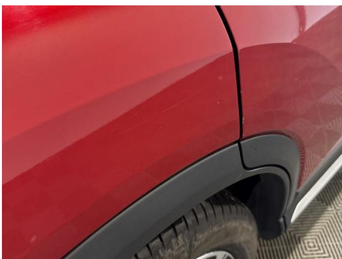
7: Qtr Panel osr Scratched Over 25mm Thru Paint