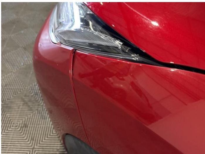
3: Bumper Front Insecure Action Required