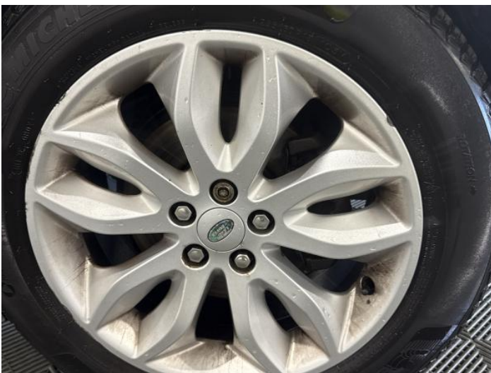
13: Wheel osf Dented Up To 30mm (Alloy)