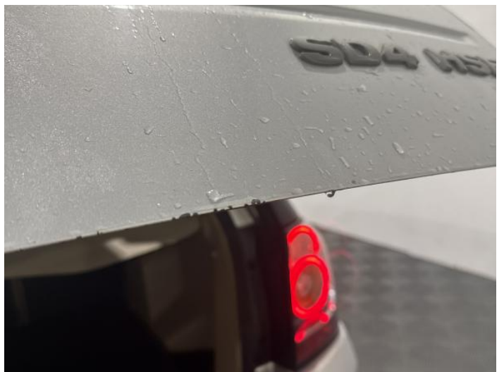
14: Tailgate Chipped Edge Chip