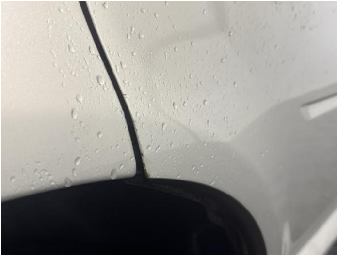
11: Door osr Chipped Edge Chip