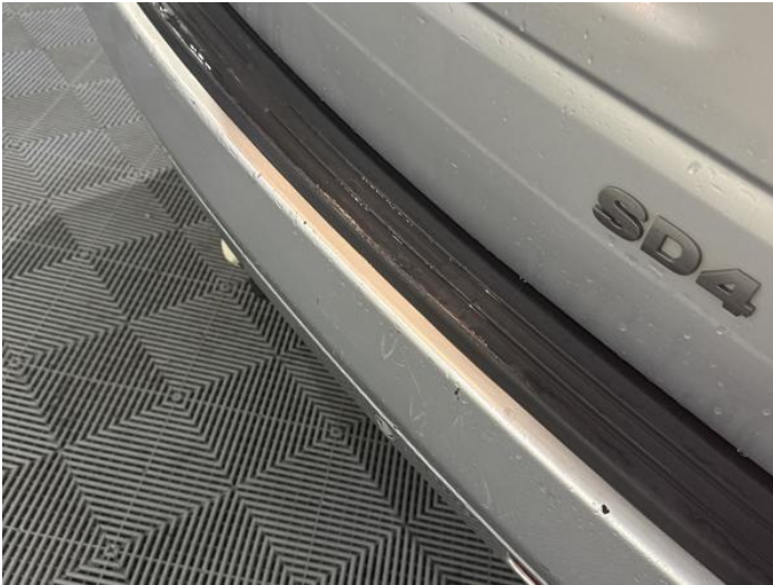
9: Bumper Rear Scratched Over 100mm Thru Paint