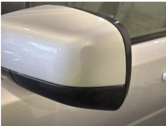
4: Door Mirror Assy nsf Scratched (Painted) UpTo 25mm Thru Paint