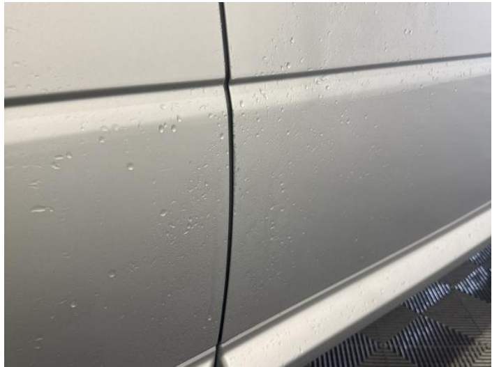
12: Door osf Chipped Edge Chip