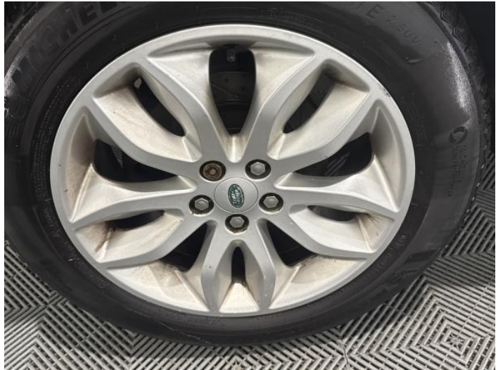
10: Wheel osr Scratched Up To 50mm