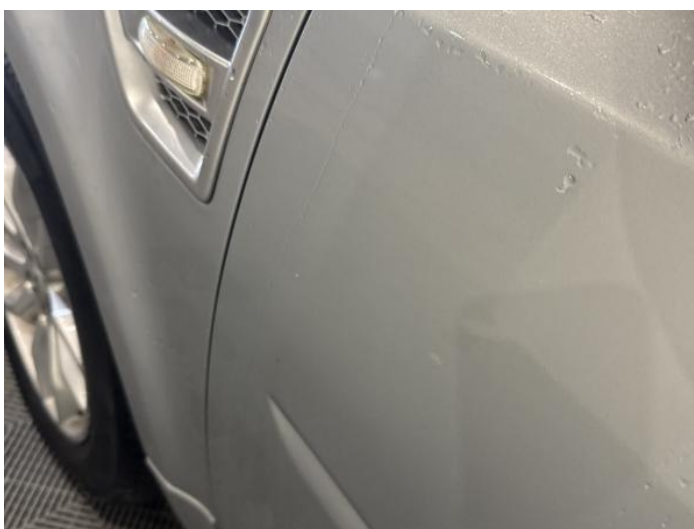
6: Door nsf Dented Between 10mm + 30mm