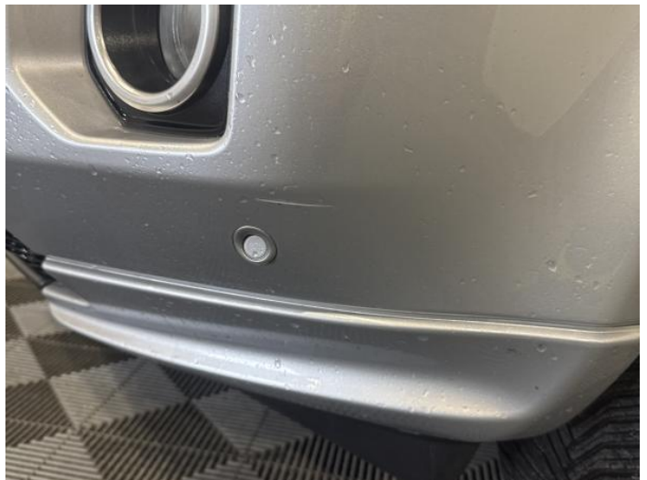
2: Bumper Front Scratched 25 to 100mm Thru Paint