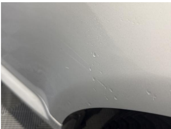
7: Door nsr Scratched Over 25mm Thru Paint