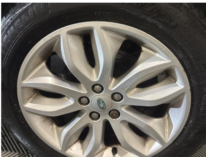
8: Wheel nsr Scratched Over 50mm