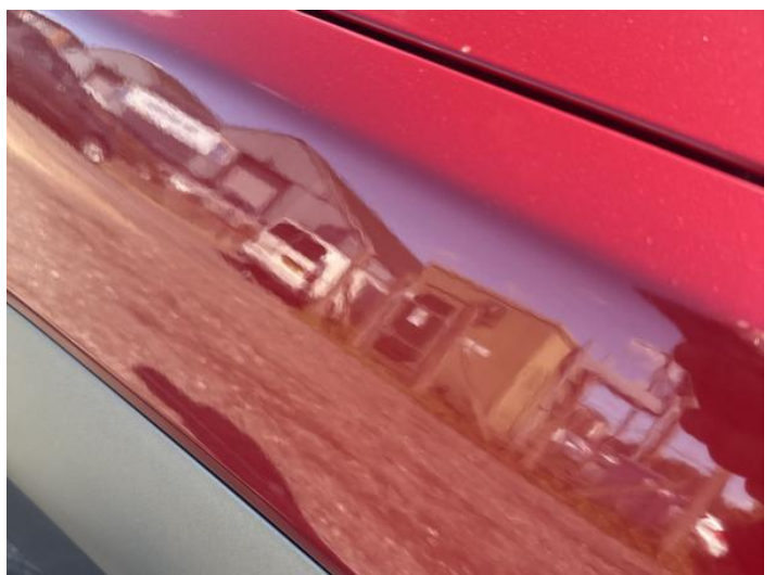
14: Wing nsf Chipped 1 To 5