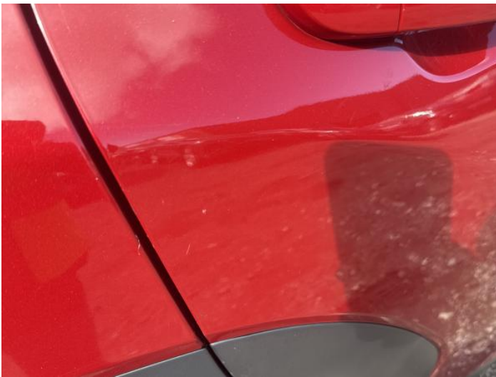
5: Door osr Scratched Up To 25mm Thru Paint