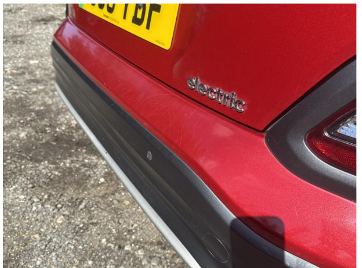
8: Bumper Rear Scratched Over 100mm Thru Paint