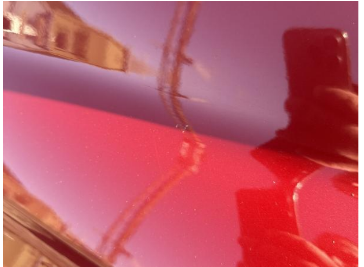
10: Qtr Panel nsr Scratched UpTo 25mm Thru Paint