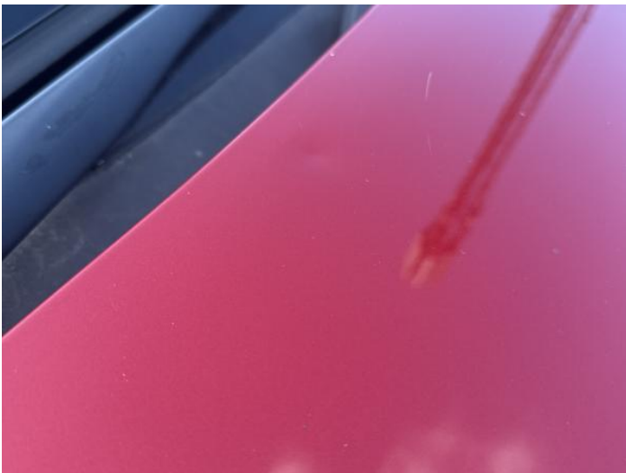
1: Bonnet Dented Between 10mm + 30mm