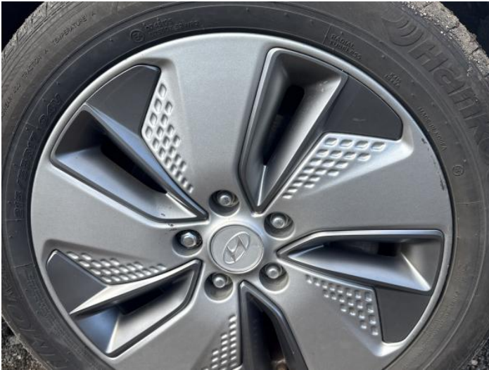
3: Wheel osf Scratched Up To 50mm