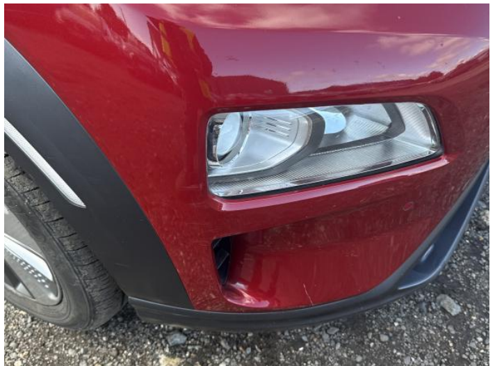
2: Bumper Front Scratched Over 100mm Thru Paint