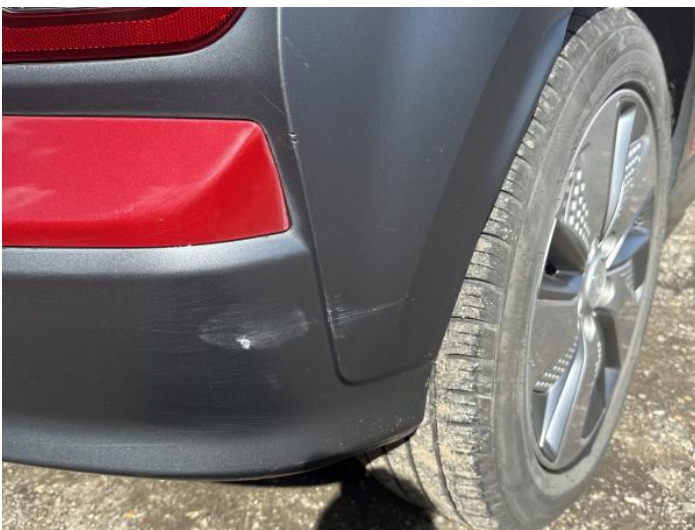
7: Bumper Rear Moulding Scratched (Painted) Over 25mm Thru Paint