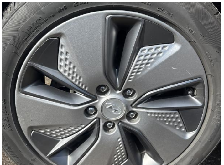
6: Wheel osr Scratched Over 50mm