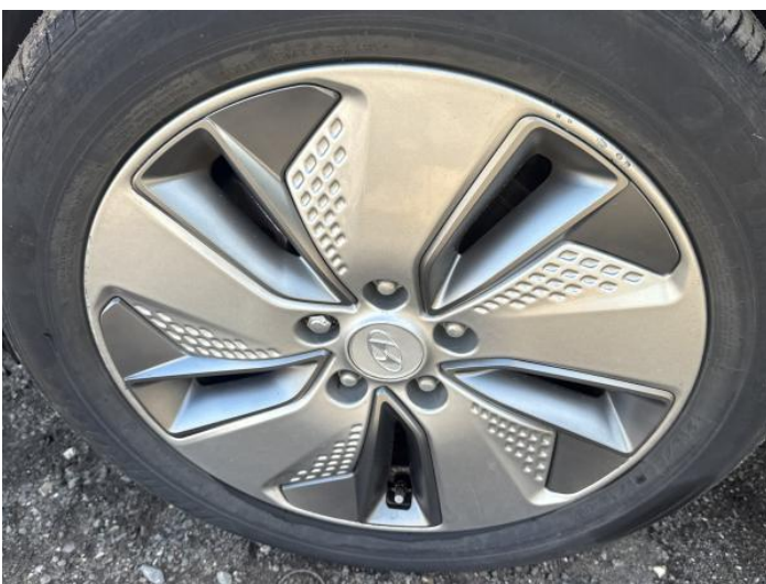
13: Wheel nsf Scratched Over 50mm