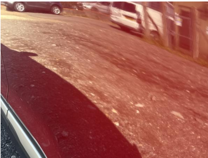
11: Door nsr Dented Between 10mm + 30mm