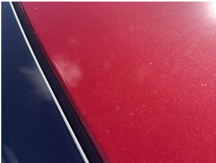
15: Roof Chipped Edge Chip