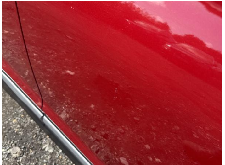
4: Door osf Scratched Over 25mm Thru Paint