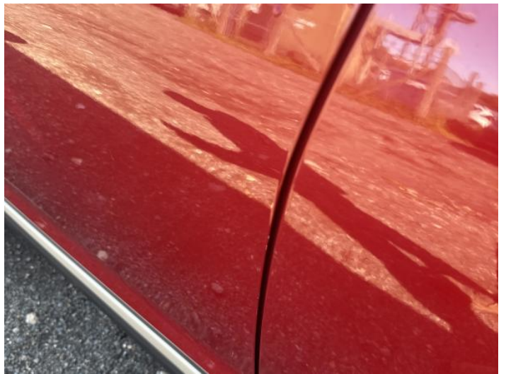
12: Door nsf Chipped Edge Chip