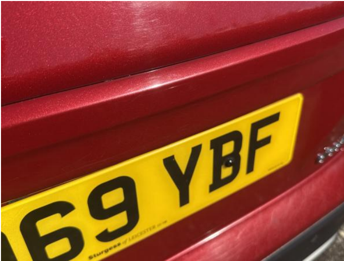
9: Tailgate Trim Panel Scratched (Painted) Over 25mm Thru Paint