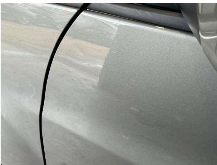
7: Door nsf Dented Between 10mm + 30mm