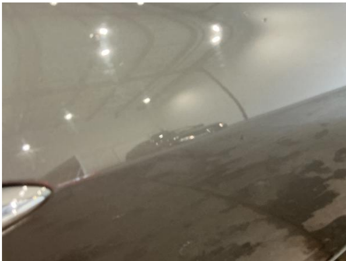
15: Door osr Dented Over 2 UpTo 10mm