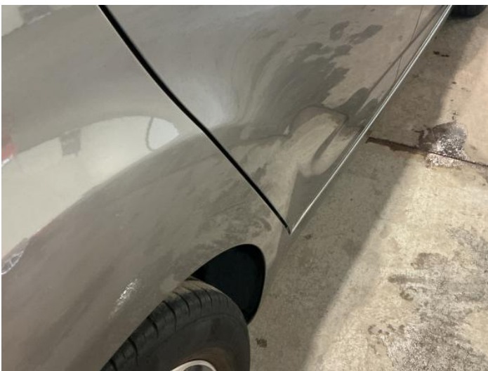
13: Qtr Panel osr Dented 2 Or Less UpTo 10mm