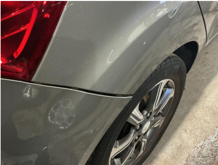
11: Bumper Rear Insecure Action Required