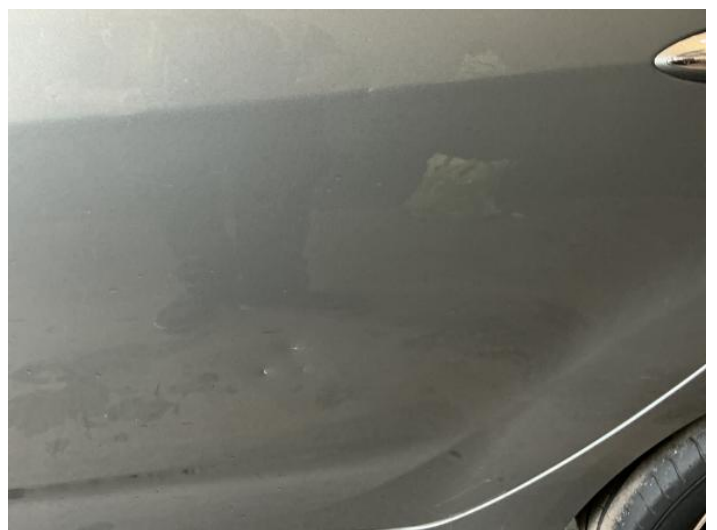
8: Door nsr Dented With Paint Damage