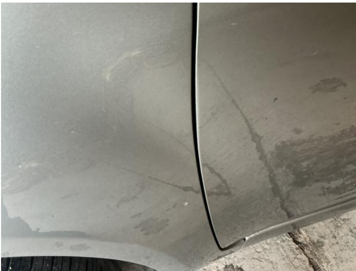
5: Wing nsf Dented Over 2 UpTo 10mm