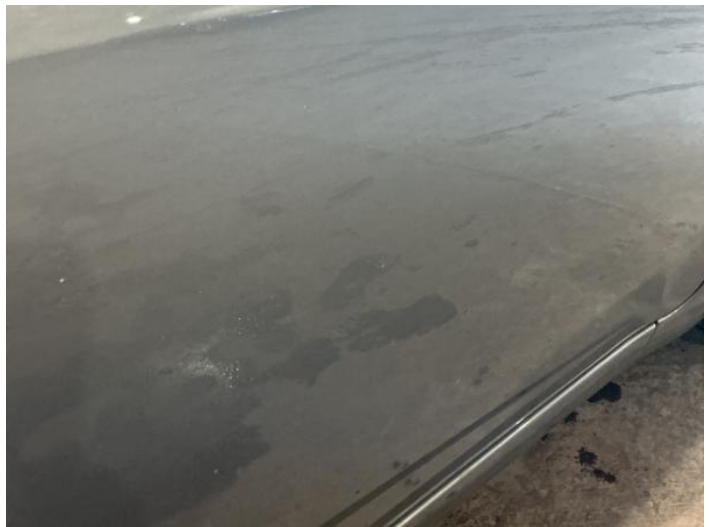
16: Door osf Chipped 1 To 5