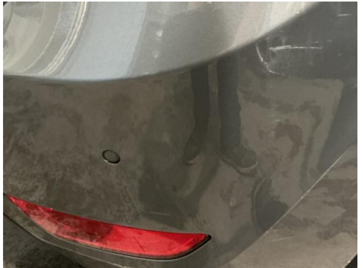
12: Parking Sensor Rear Broken Replace