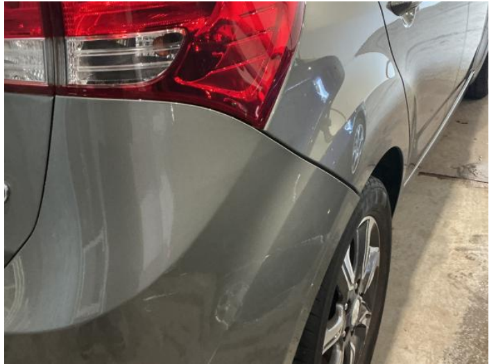
10: Bumper Rear Scratched Over 100mm Thru Paint