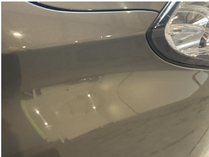
17: Wing osf Chipped 1 To 5