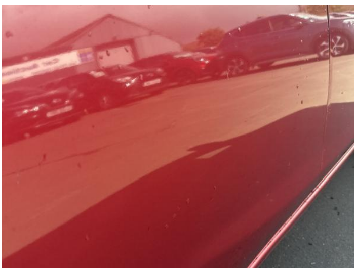
13: Door osr Scratched Over 25mm Thru Paint