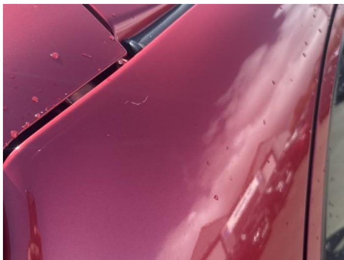
12: Qtr Panel osr Scratched UpTo 25mm Thru Paint