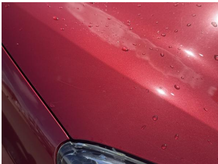
1: Bonnet Scratched Over 25mm Thru Paint