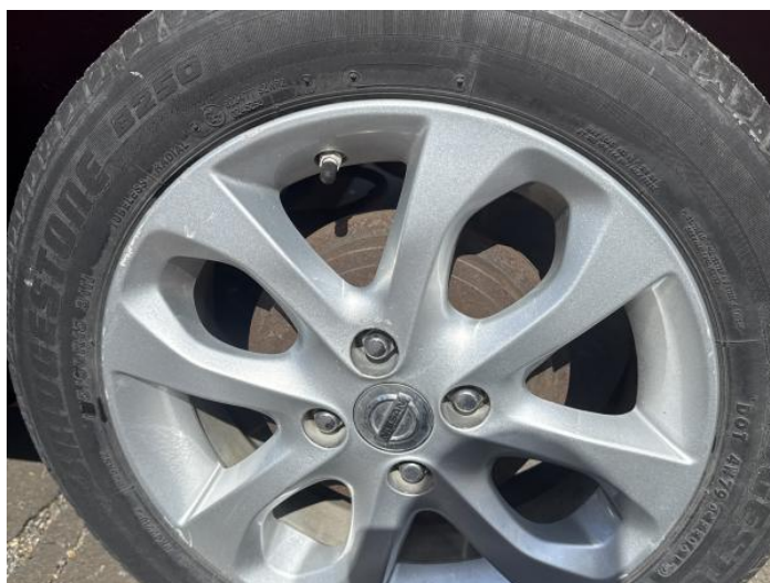
8: Wheel nsr Scratched Over 50mm