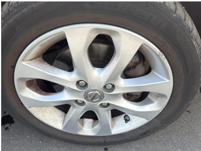
15: Wheel osf Scratched Over 50mm