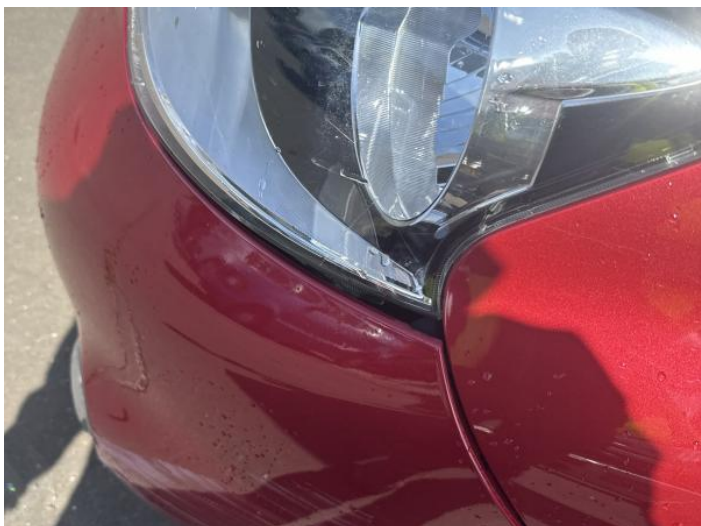
3: Bumper Front Insecure Action Required