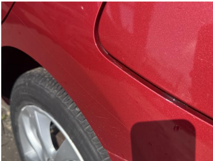
9: Qtr Panel nsr Scratched Over 25mm Thru Paint