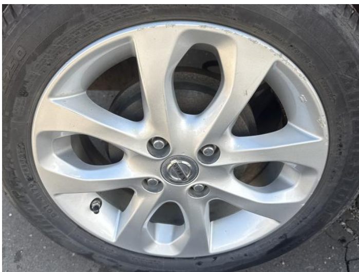
11: Wheel osr Scratched Over 50mm