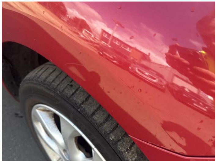
16: Wing osf Scratched Over 25mm Thru Paint