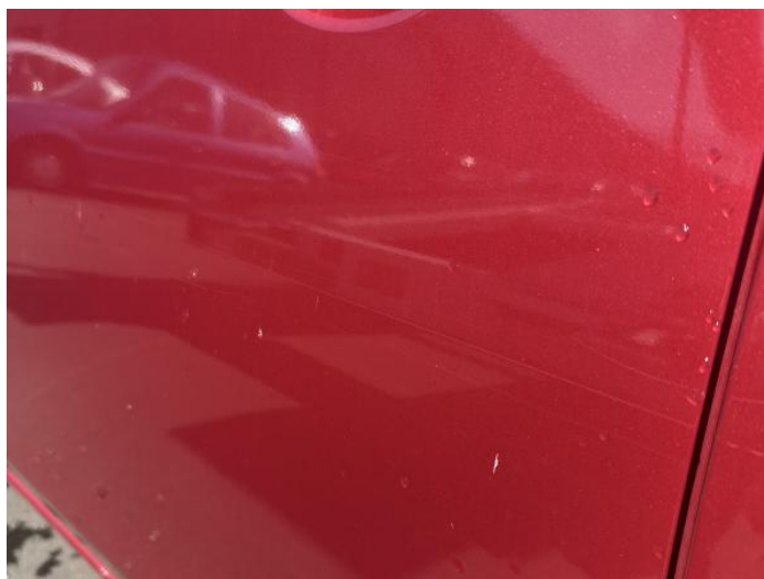
6: Door nsf Scratched Over 25mm Thru Paint