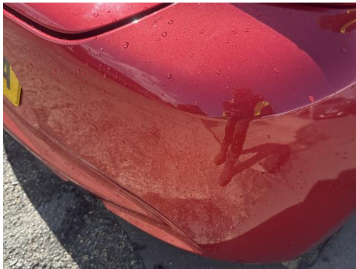
10: Bumper Rear Scratched Over 100mm Thru Paint