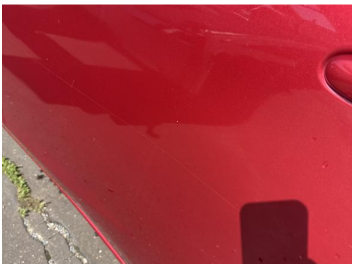
7: Door nsr Dented With Paint Damage