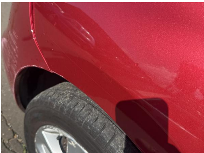
5: Wing nsf Scratched Over 25mm Thru Paint