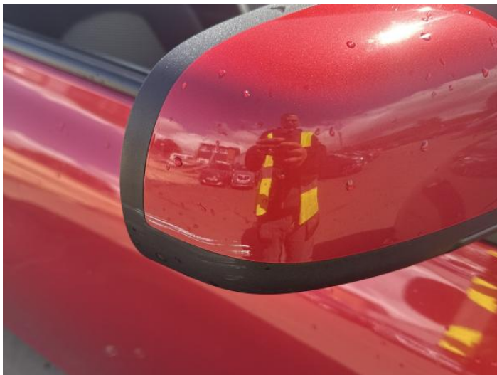
17: Door Mirror Assy osf Scratched (Painted) Over 25mm Thru Paint