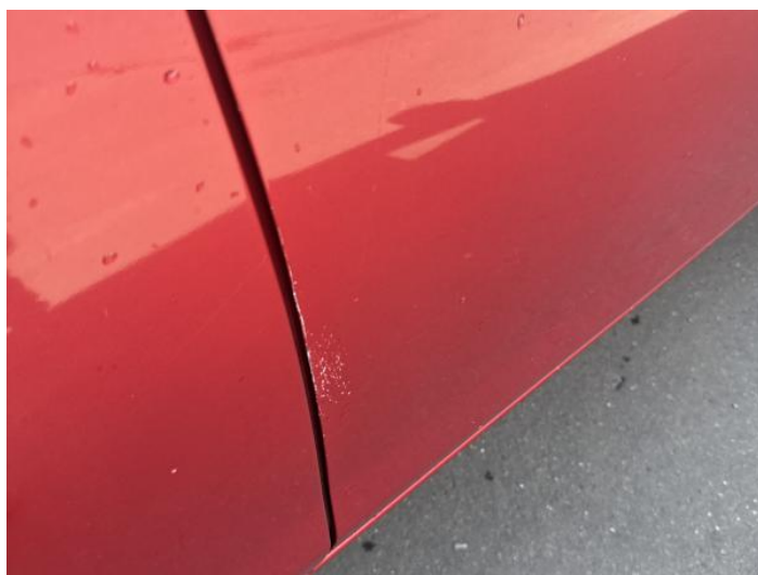
14: Door osf Scratched Over 25mm Thru Paint