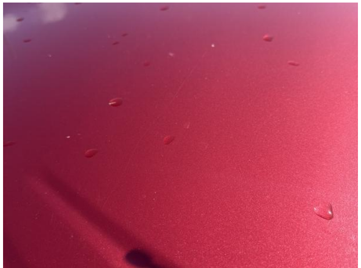
18: Roof Scratched Over 25mm Thru Paint