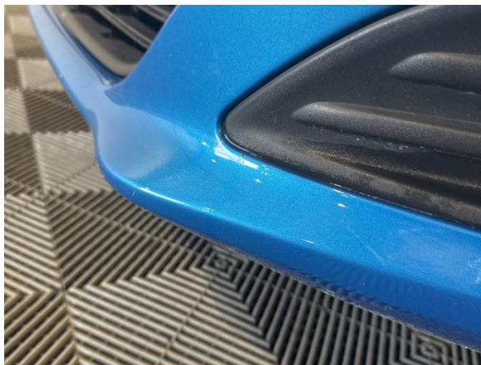
2: Bumper Front Scratched UpTo 25mm Thru Paint