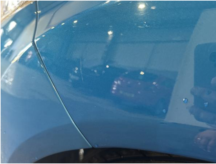
3: Wing nsf Scratched UpTo 25mm Thru Paint