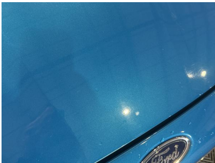
1: Bonnet Scratched UpTo 25mm Thru Paint