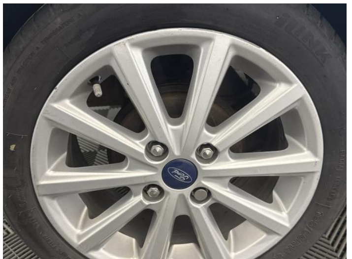
8: Wheel osr Scratched Over 50mm