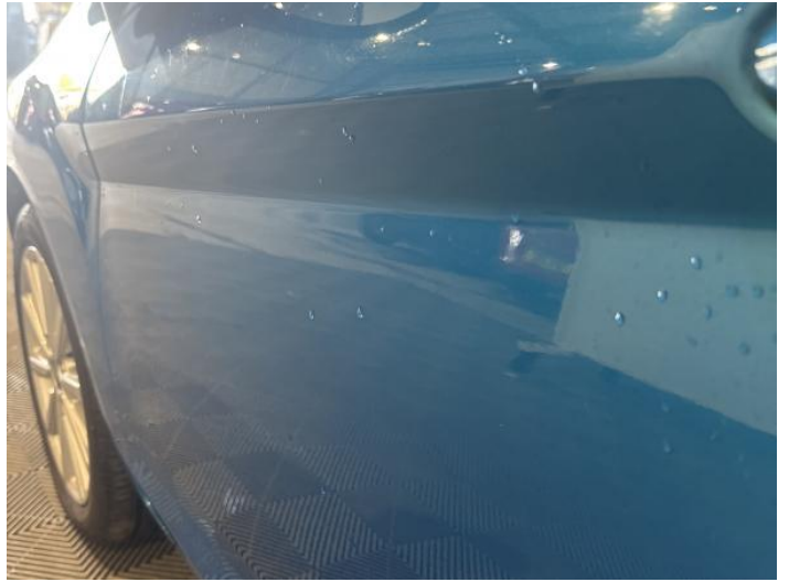
4: Door nsf Scratched Over 25mm Thru Paint