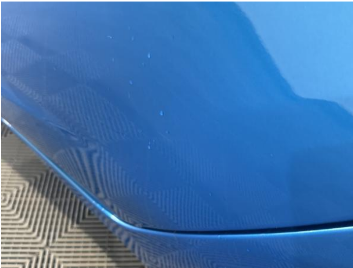
5: Door nsr Scratched UpTo 25mm Thru Paint