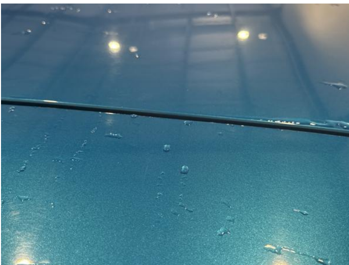
7: Roof Dented Over 30mm