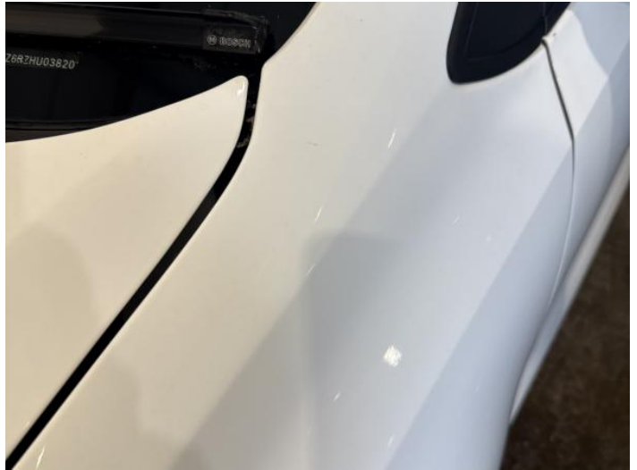
4: Wing nsf Scratched Up To 25mm Thru Paint