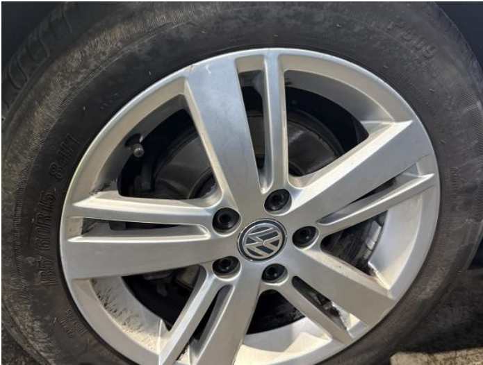
3: Wheel nsf Scratched Up To 50mm