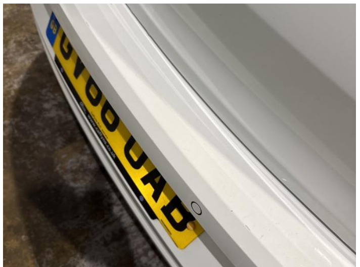
8: Bumper Rear Scratched 25 to 100mm Thru Paint