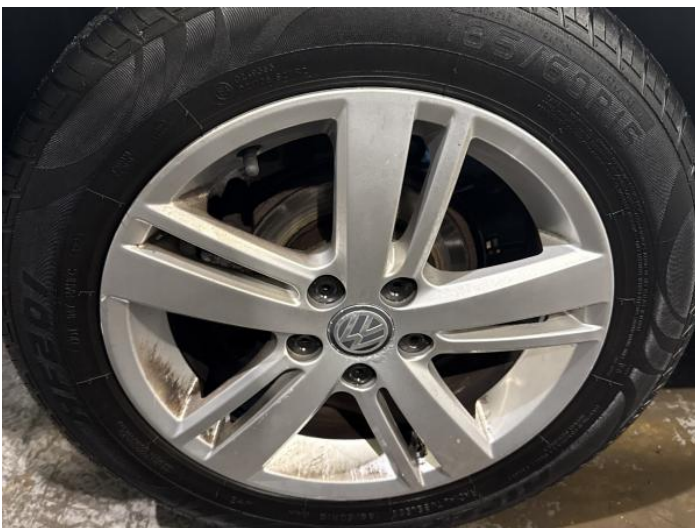
7: Wheel osr Scratched Up To 50mm