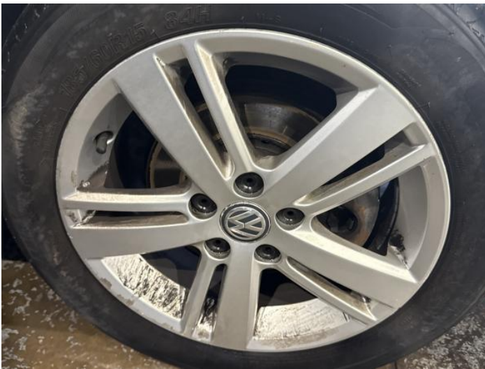
5: Wheel osf Scratched Over 50mm