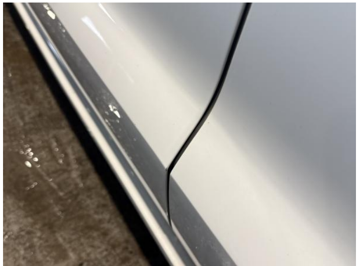
10: Door nsf Chipped Edge Chip