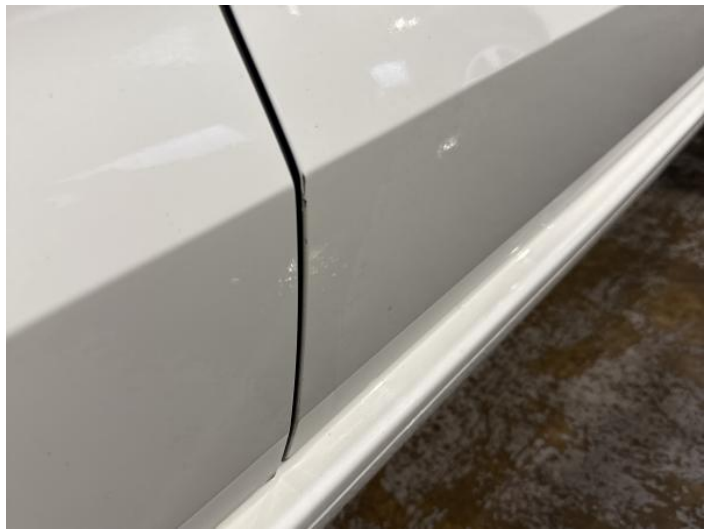
6: Door osf Chipped Edge Chip