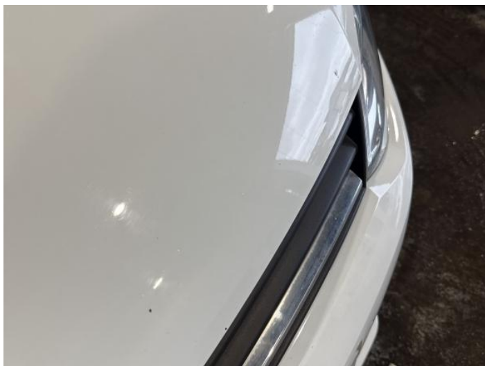
1: Bonnet Chipped Multiple Chips