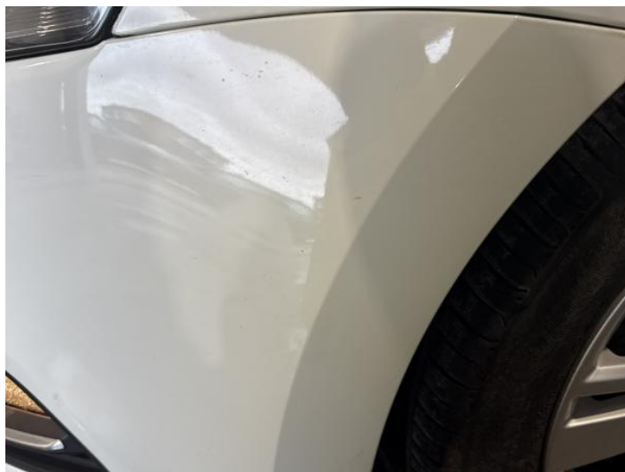
2: Bumper Front Chipped Multiple Chips