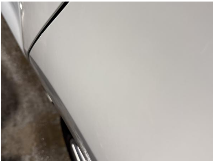
9: Qtr Panel osr Scratched UpTo 25mm Thru Paint