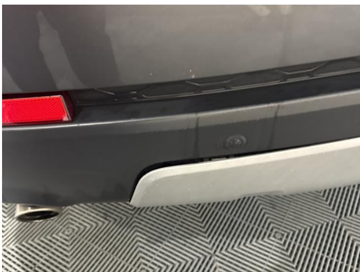
13: Bumper Rear Moulding Broken Replace