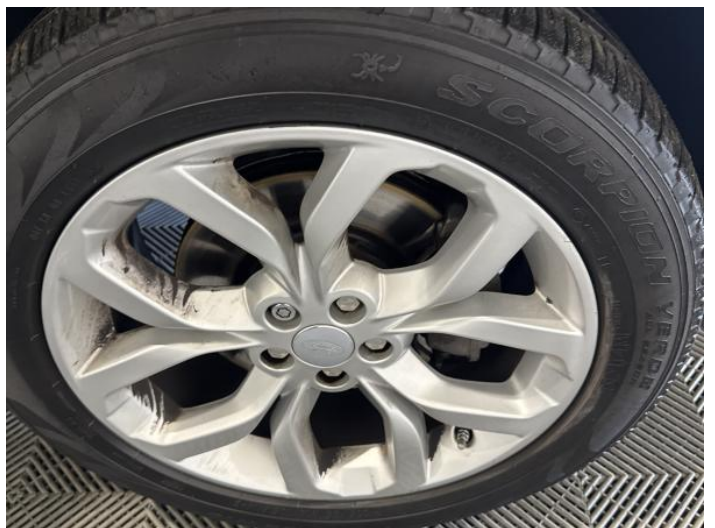
20: Wheel osf Scratched Over 50mm