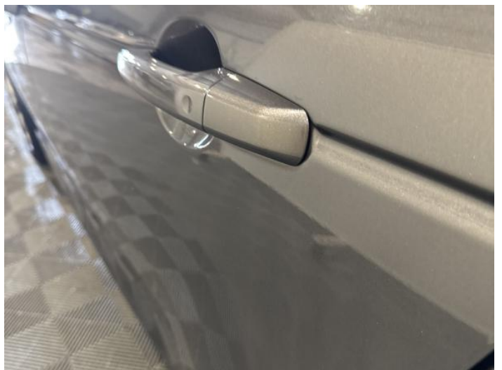
7: Door nsf Scratched Over 25mm Not Thru Paint