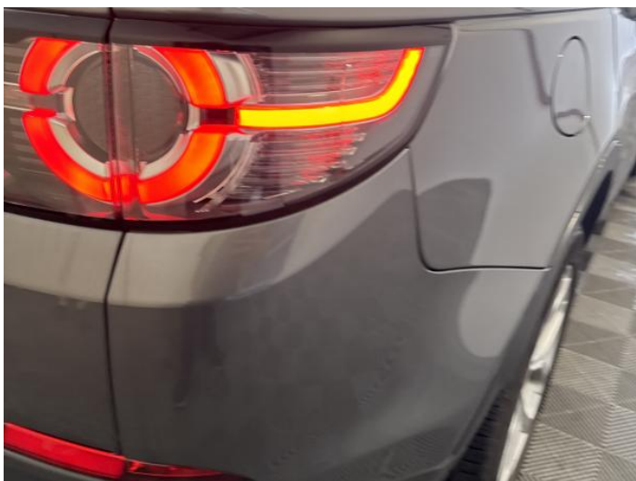
11: Bumper Rear Chipped Multiple Chips