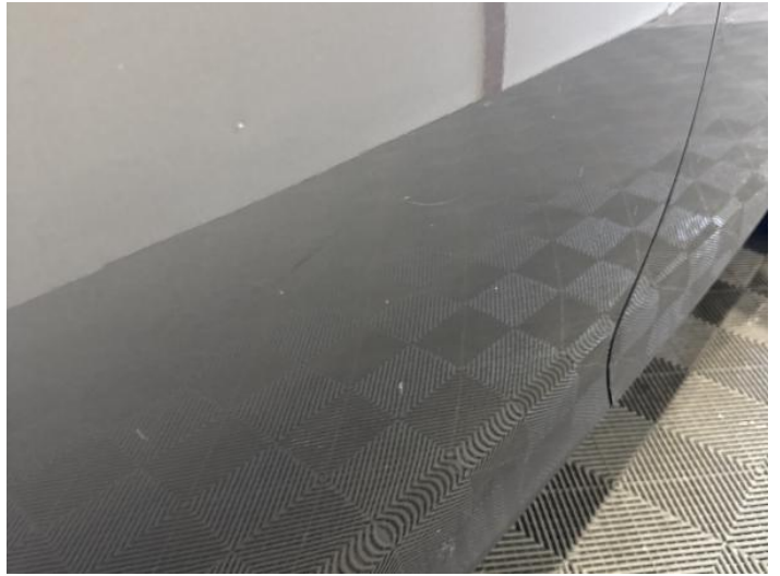
16: Door osr Dented Over 2 UpTo 10mm