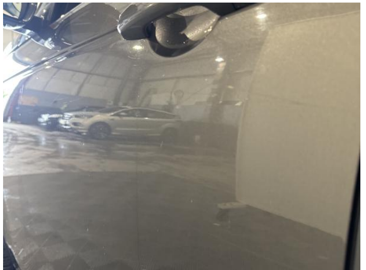
5: Wing nsf Scratched Over 25mm Not Thru Paint