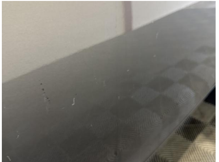
18: Door osf Chipped Multiple Chips