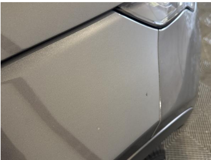
19: Wing osf Chipped 1 To 5