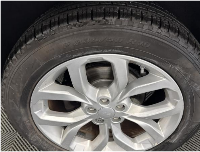
15: Wheel osr Scratched Over 50mm