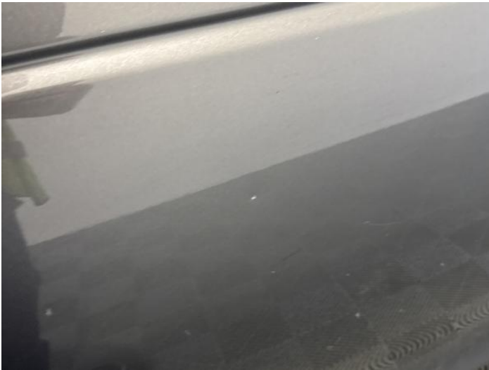
17: Door osr Chipped 1 To 5