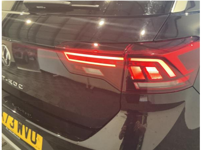
9: Qtr Panel nsr Scratched Over 25mm Not Thru Paint