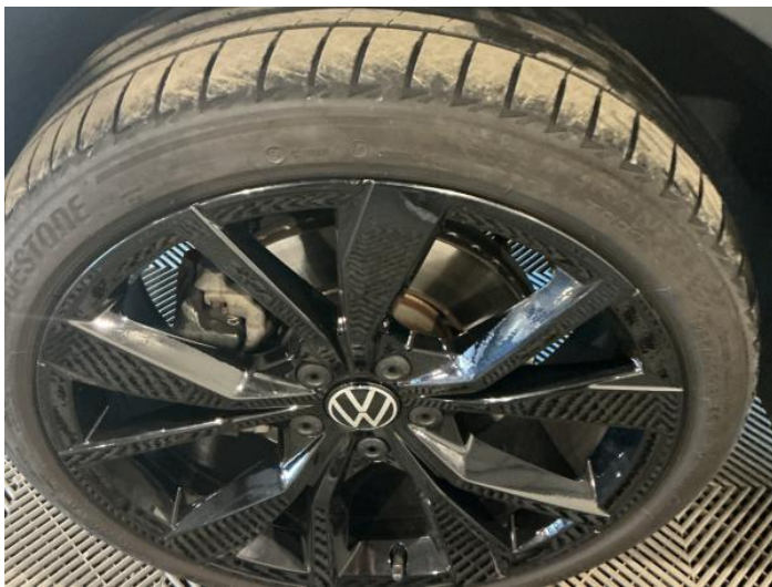
5: Wheel nsr Scratched Up To 50mm