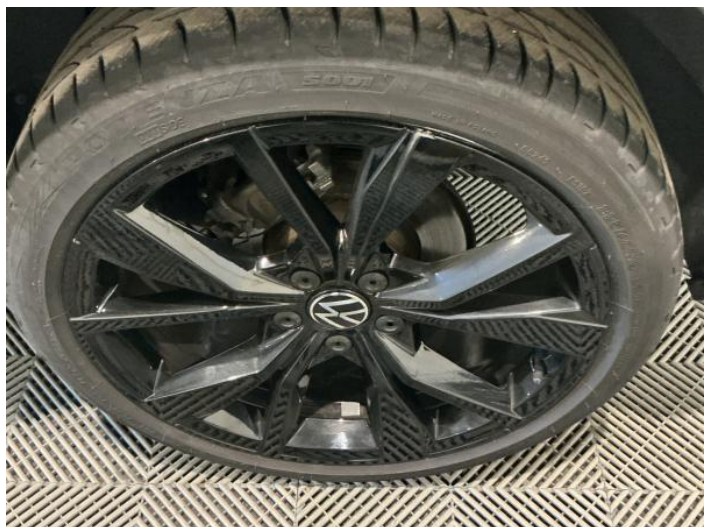
8: Wheel nsr Scratched Up To 50mm