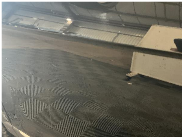
6: Door nsf Chipped 1 To 5