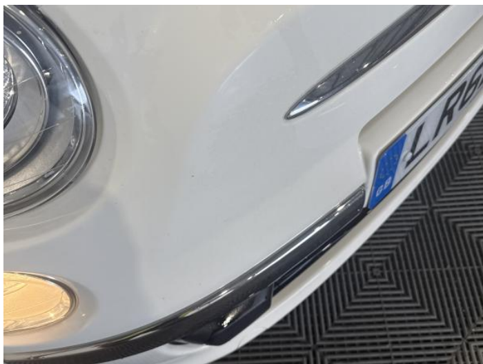
1: Bumper Front Chipped 1 To 5