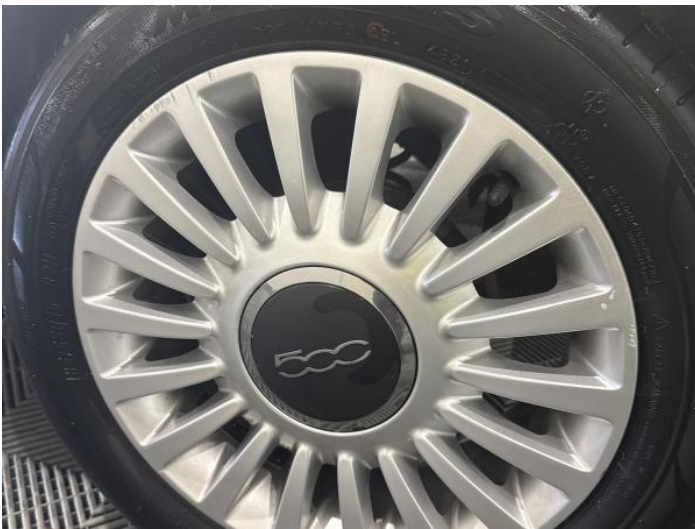
5: Wheel nsr Scratched Over 50mm