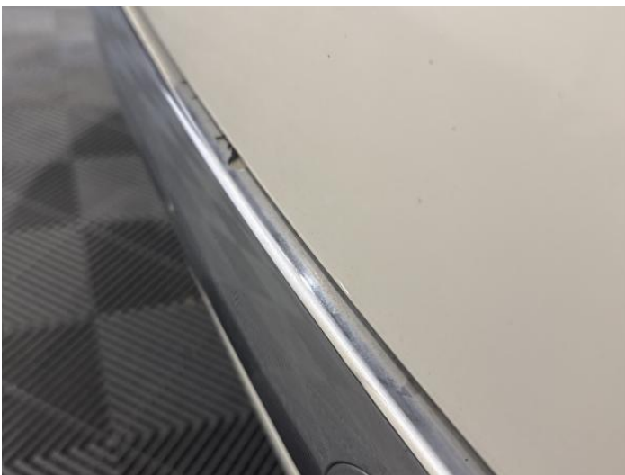
7: Bumper Rear Moulding Scratched (Painted) Over 25mm Thru Paint