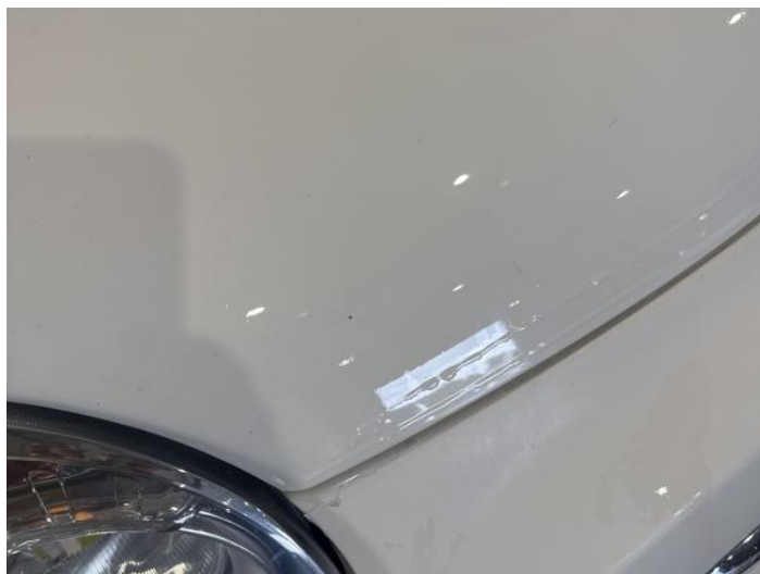
2: Bonnet Chipped 1 To 5