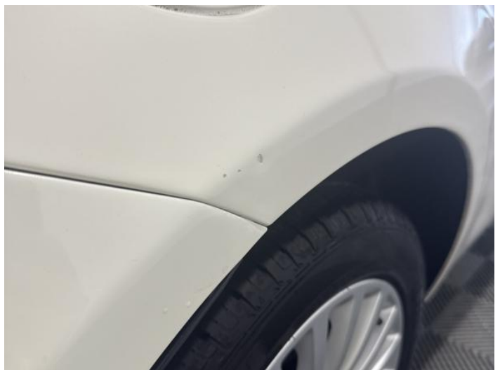
8: Qtr Panel osr Dented Between 10mm + 30mm