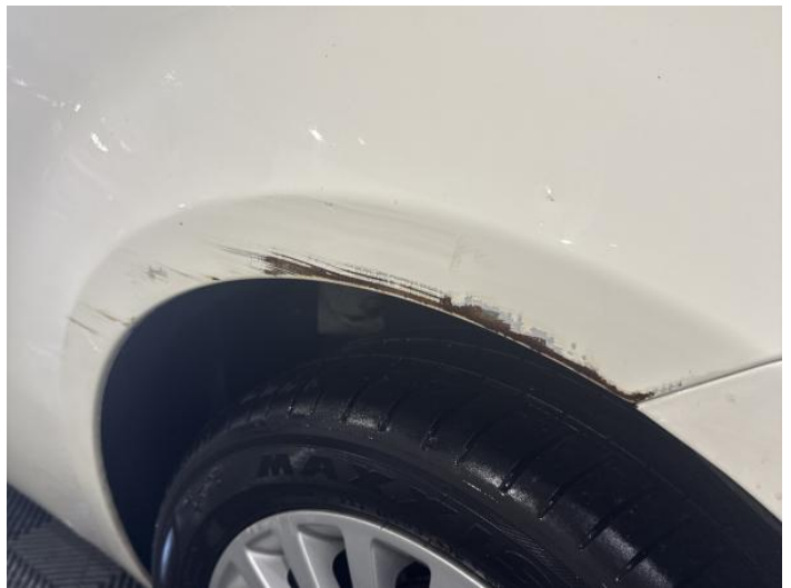
6: Qtr Panel nsr Dented With Paint Damage