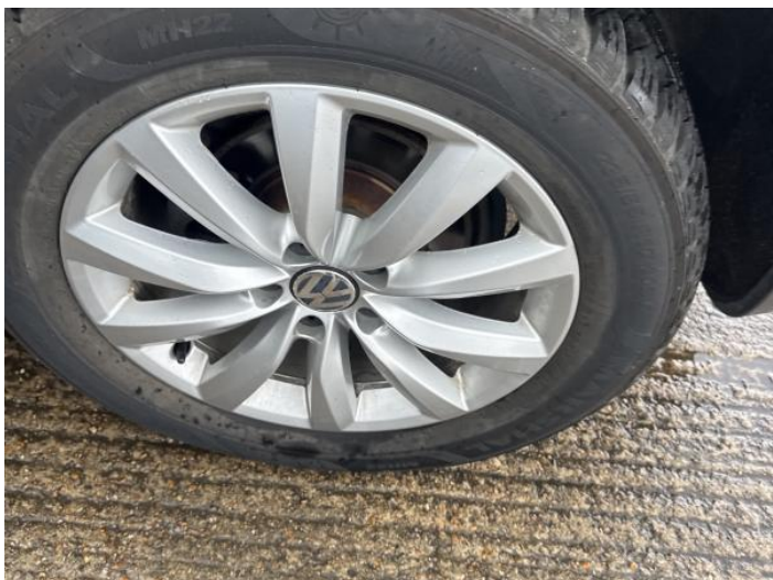
9: Wheel nsr Scratched Up To 50mm