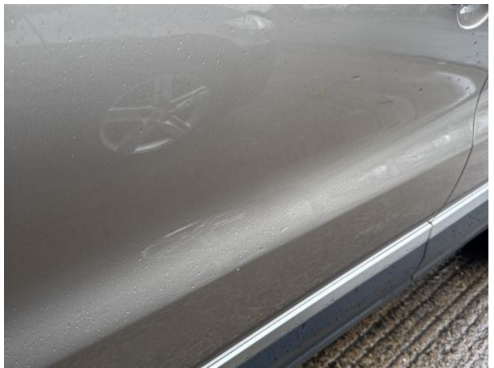
6: Door nsf Chipped 1 To 5