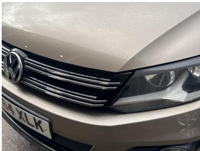
2: Bumper Front Chipped Multiple Chips