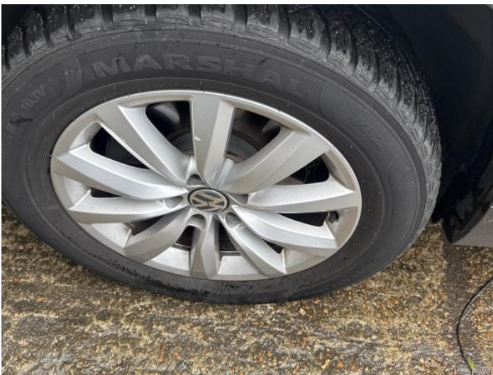
5: Wheel nsf Scratched Up To 50mm