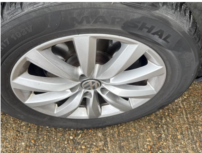
19: Wheel osf Scratched Over 50mm