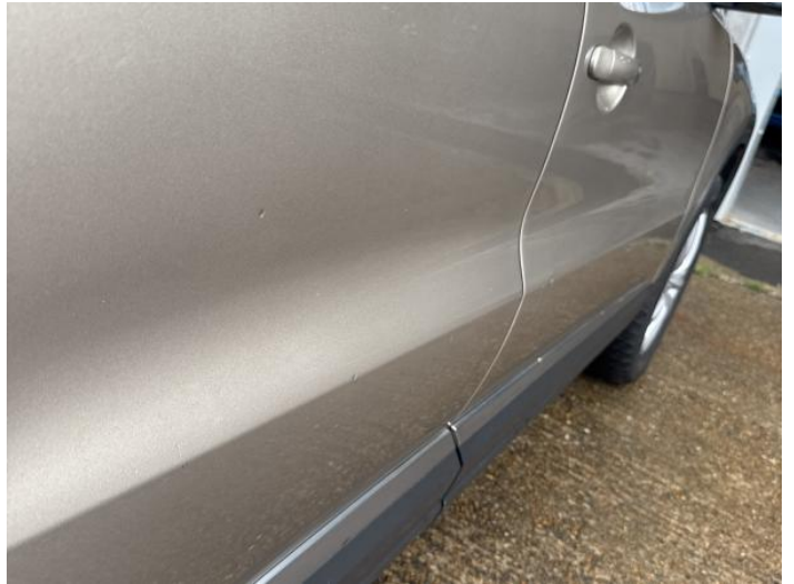
16: Door osr Chipped 1 To 5