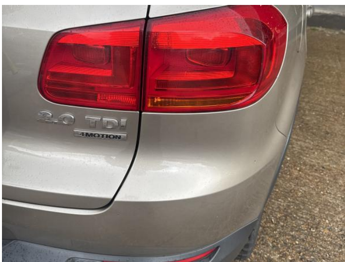
11: Bumper Rear Chipped Multiple Chips