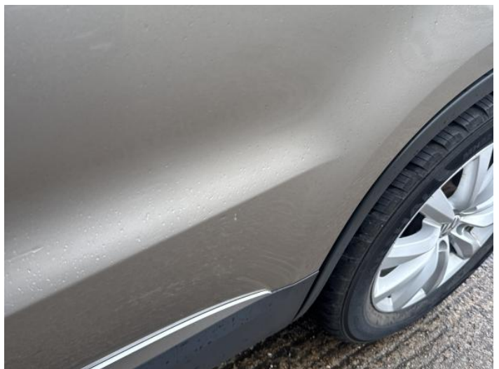
8: Door nsr Chipped 1 To 5