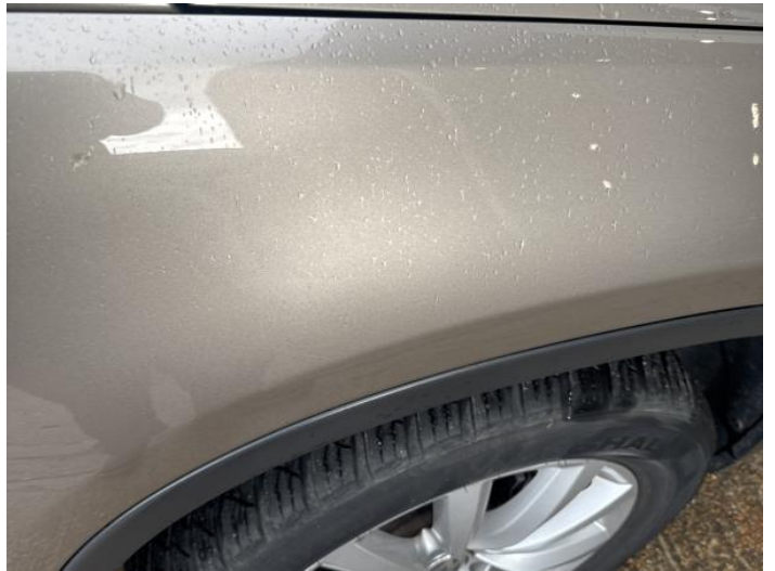
18: Wing osf Chipped 1 To 5