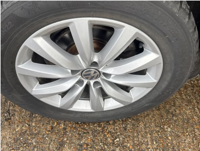
15: Wheel osr Scratched Up To 50mm