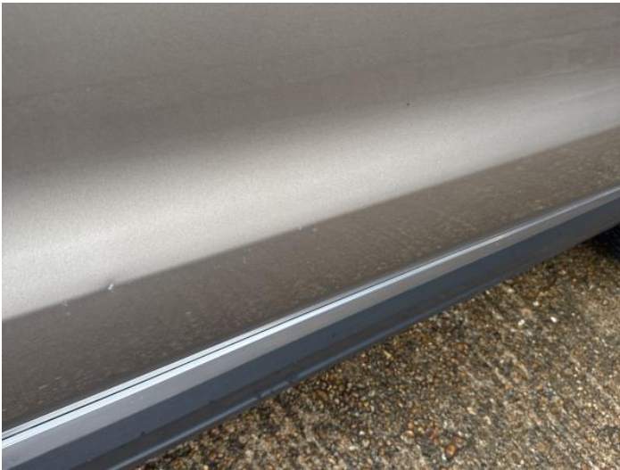
17: Door osf Dented With Paint Damage