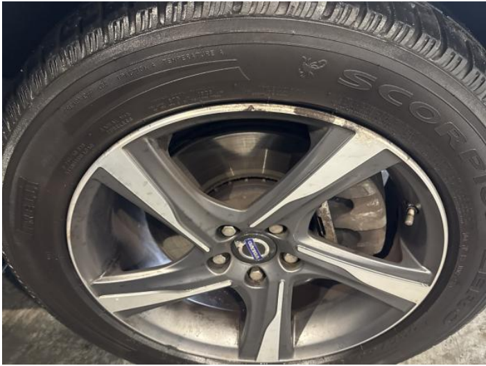
22: Wheel osf Scratched Over 50mm