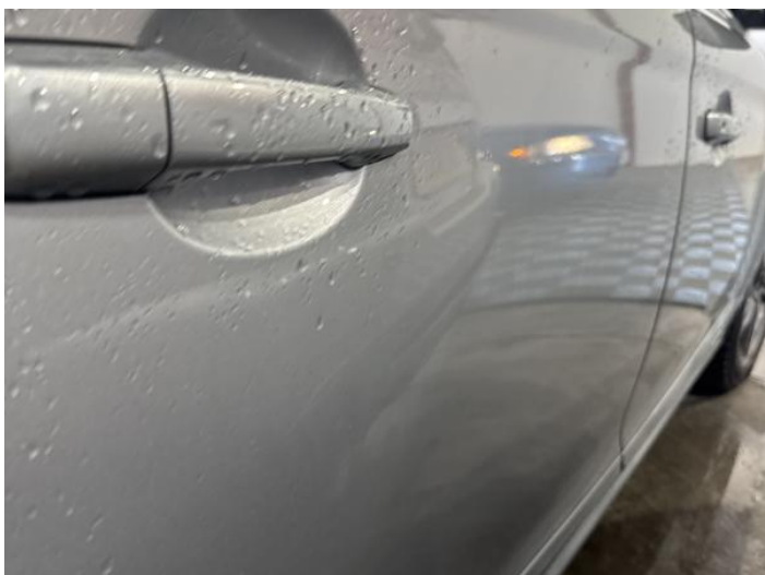
17: Door osr Chipped 1 To 5