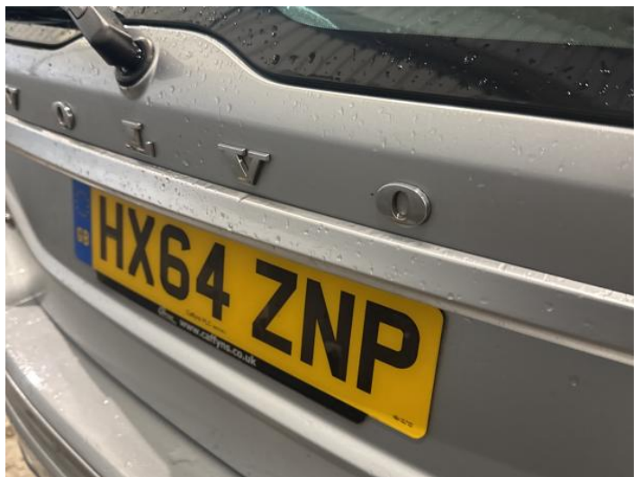
14: Boot Lid Dented Over 2 UpTo 10mm