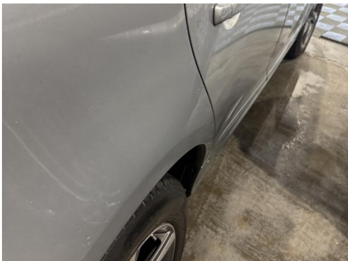
15: Qtr Panel osr Dented 2 Or Less UpTo 10mm