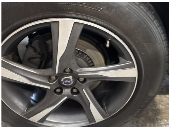
16: Wheel osr Scratched Up To 50mm