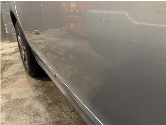
23: Door osf Dented Between 10mm + 30mm

Carpet Condition Average Seat Condition Average