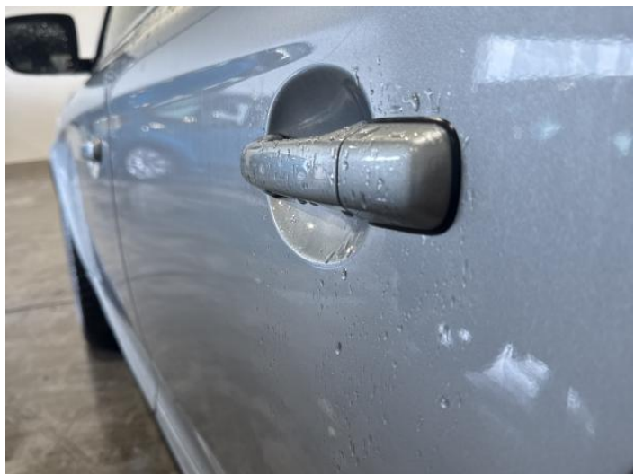
7: Door nsf Scratched Over 25mm Not Thru Paint