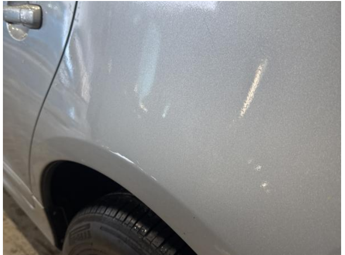
10: Qtr Panel nsr Chipped 1 To 5