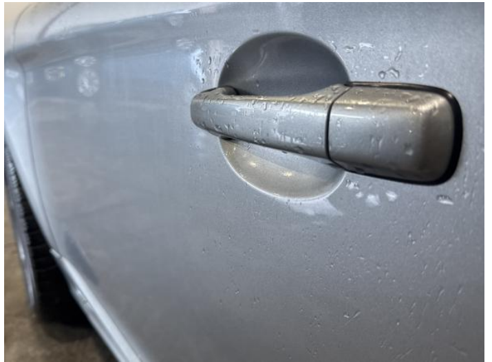
6: Door nsr Chipped 1 To 5