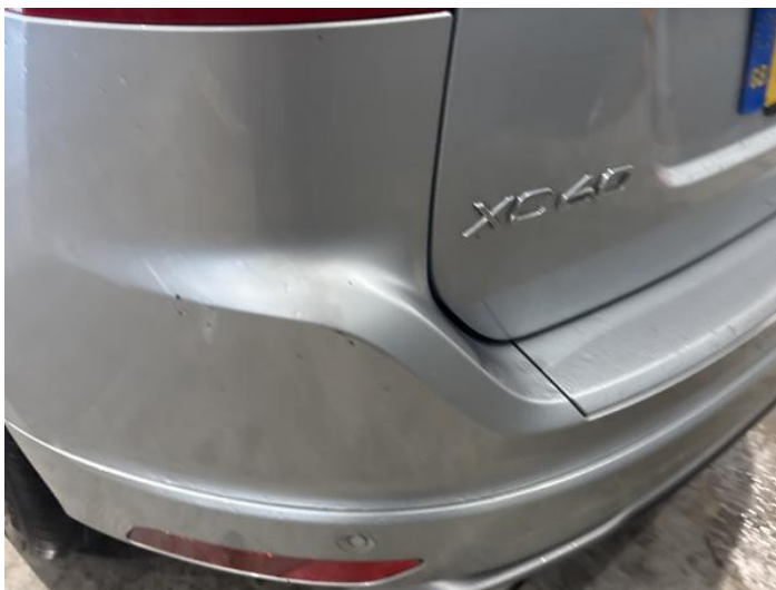
13: Bumper Rear Poor Previous Repair Poor Paint