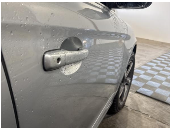
19: Door osf Chipped 1 To 5