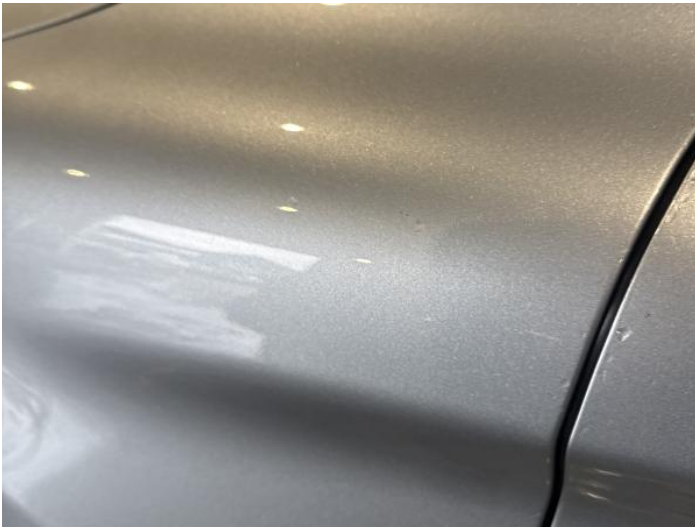
5: Wing nsf Chipped 1 To 5