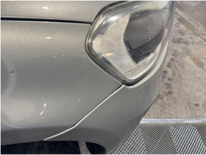
21: Wing osf Chipped 1 To 5