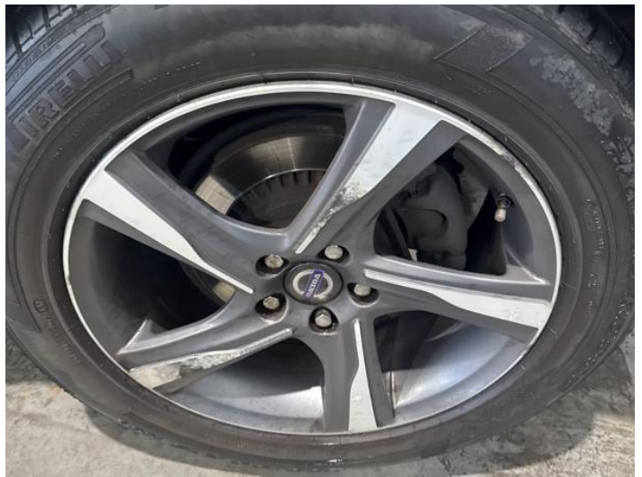
12: Wheel nsr Scratched Over 50mm