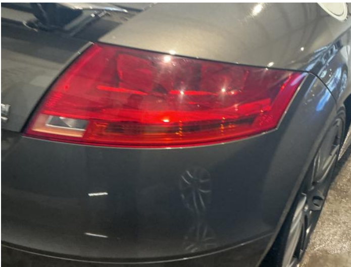
11: Bumper Rear Chipped Multiple Chips