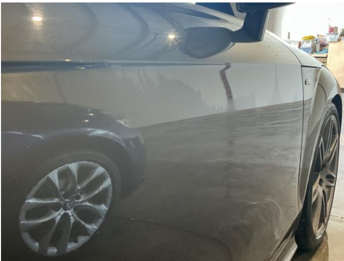
17: Door osf Chipped 1 To 5