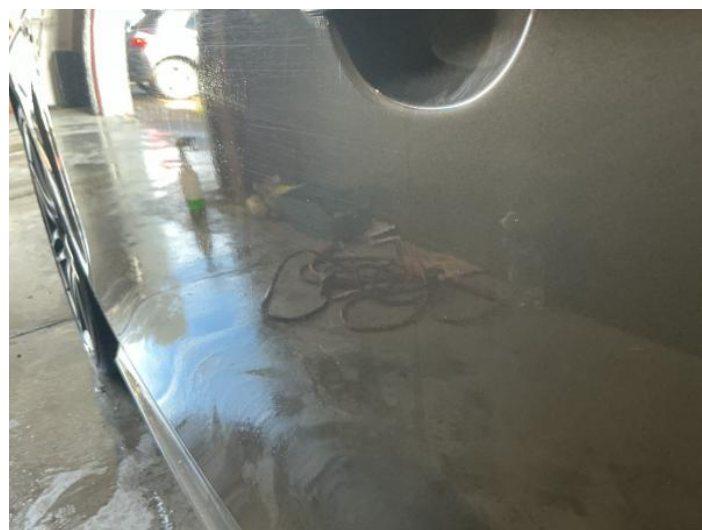
7: Door nsr Chipped 1 To 5