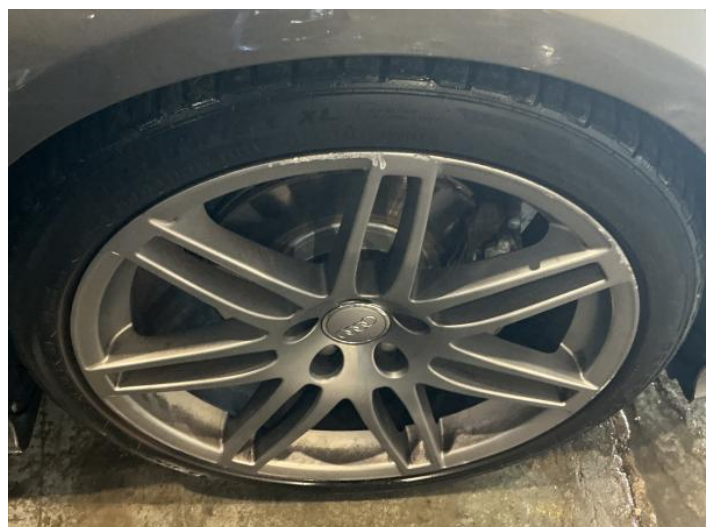
20: Wheel osf Scratched Over 50mm