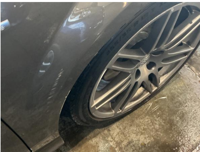
19: Wing osf Dented With Paint Damage