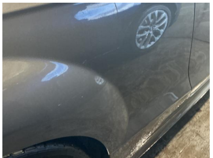
14: Qtr Panel osr Chipped 1 To 5