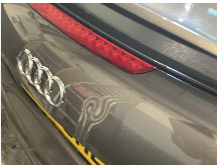
13: Boot Lid Dented Between 10mm + 30mm