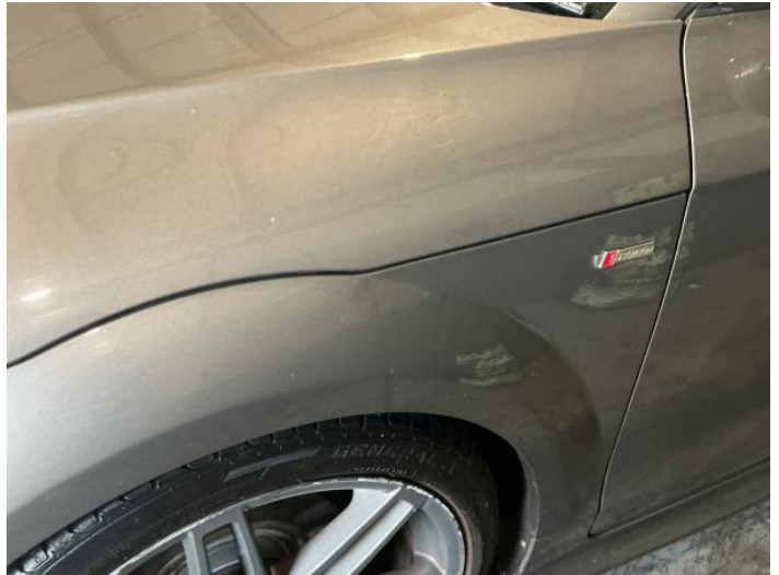
4: Wing nsf Chipped 1 To 5