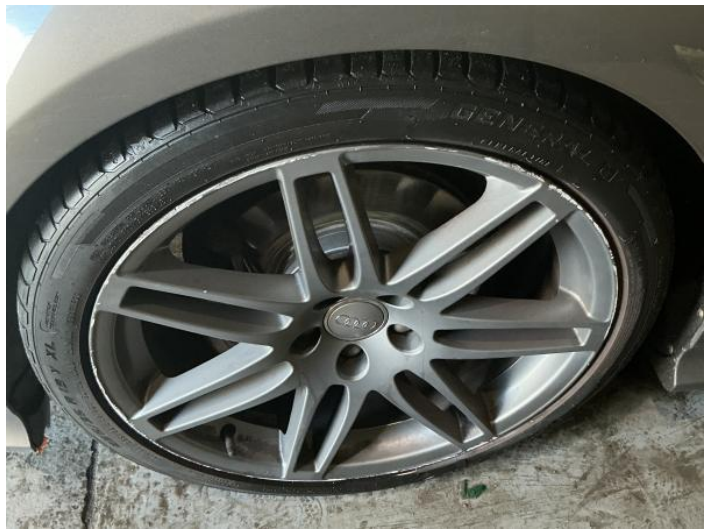
6: Wheel nsf Scratched Over 50mm