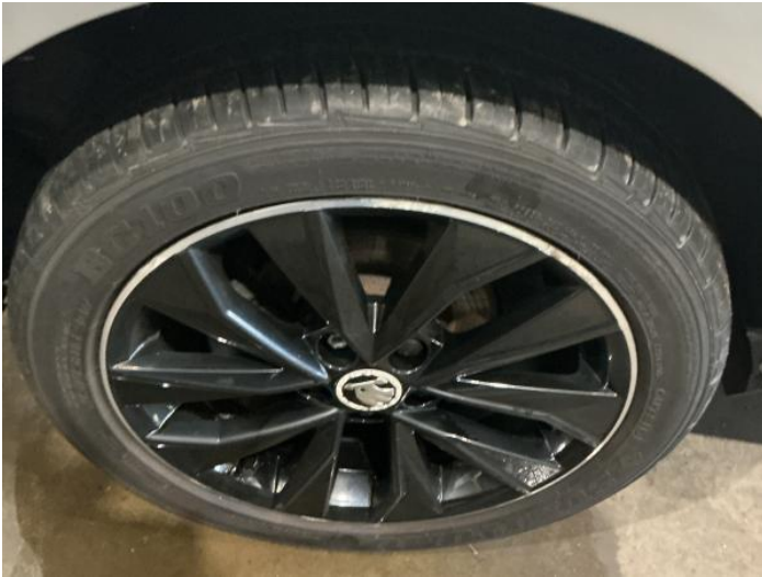
15: Wheel osr Scratched Over 50mm