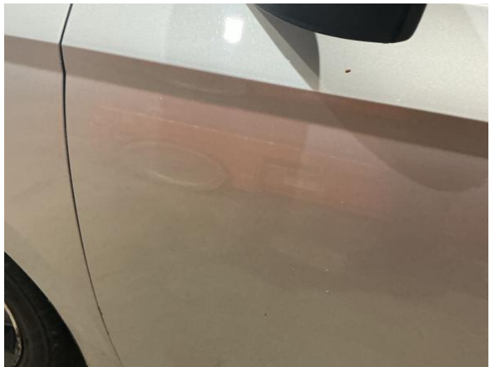
6: Door nsf Chipped 1 To 5