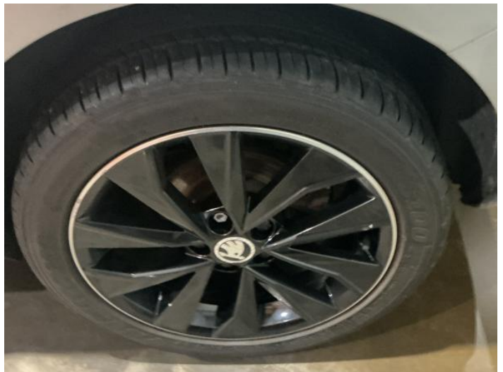
10: Wheel nsr Scratched Over 50mm