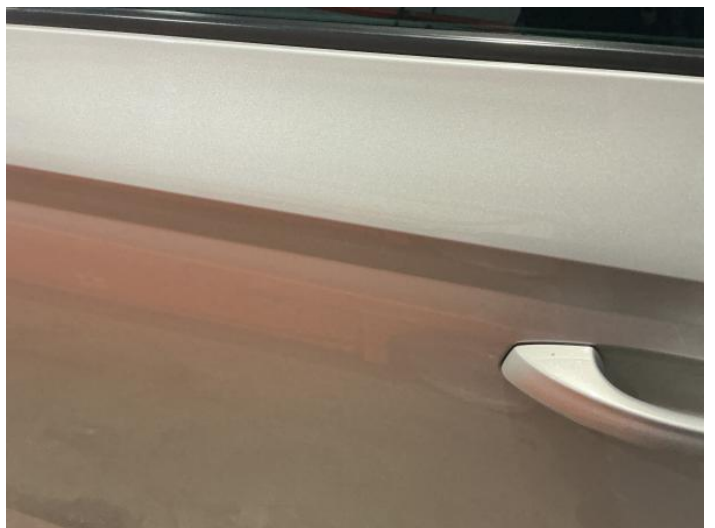
7: Door nsf Scratched Over 25mm Not Thru Paint