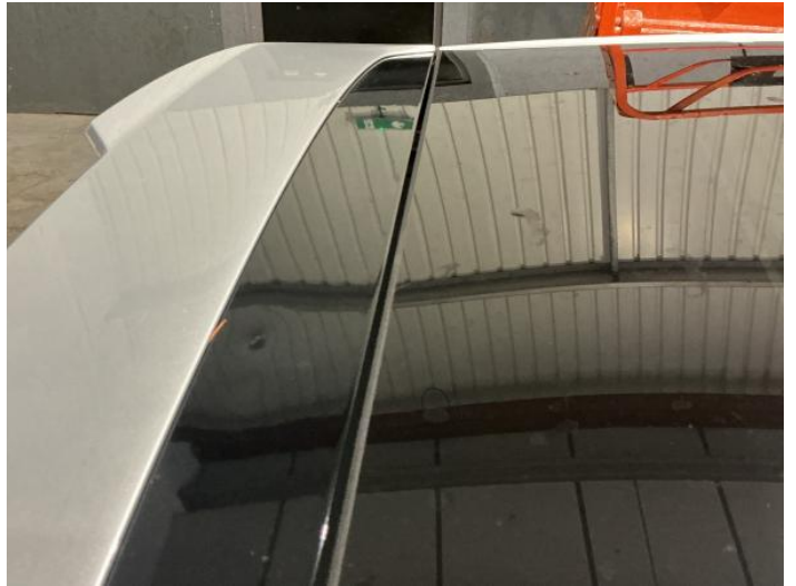
16: Roof Dented Between 10mm + 30mm