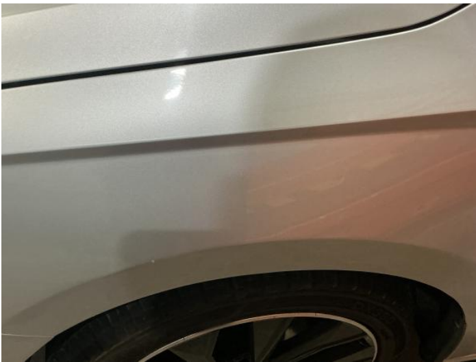
5: Wing nsf Chipped 1 To 5