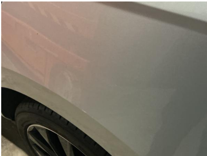
9: Qtr Panel nsr Chipped 1 To 5