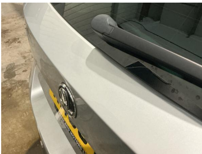
13: Boot Lid Dented Over 2 UpTo 10mm