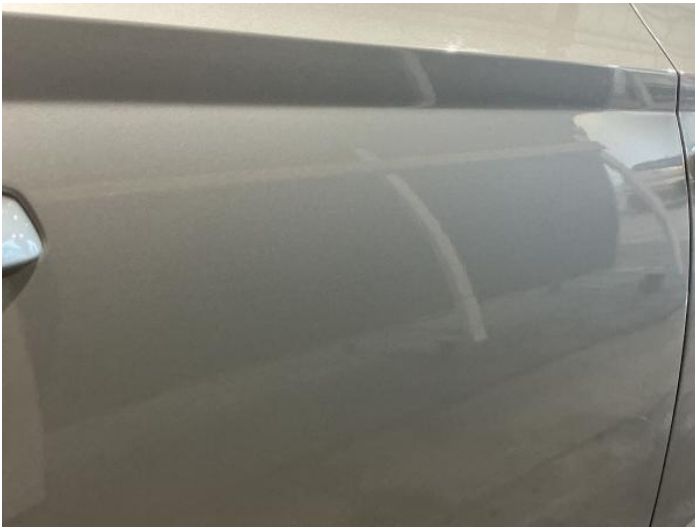
17: Door osr Chipped 1 To 5