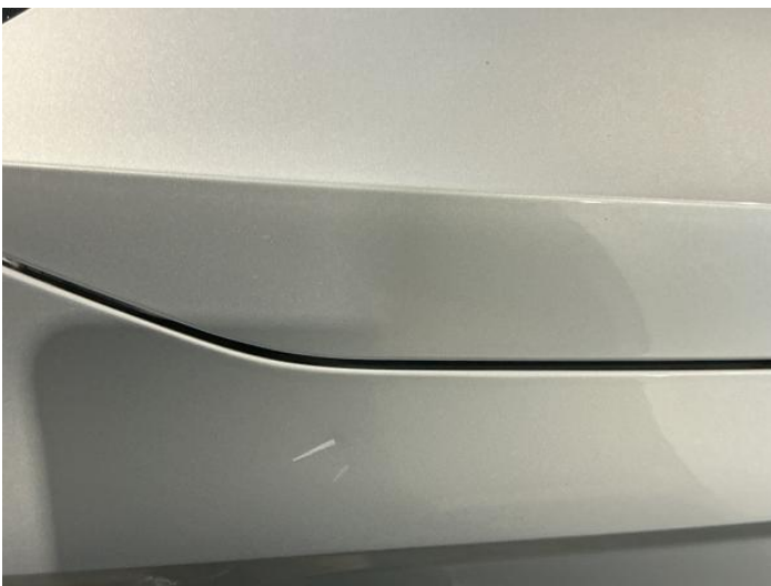
19: Wing osf Dented Between 10mm + 30mm