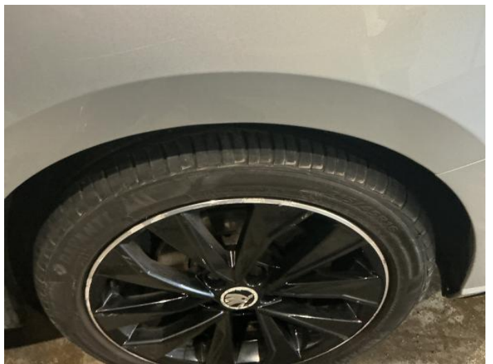
20: Wheel osf Scratched Over 50mm