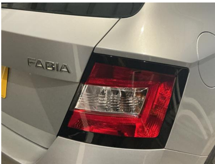
11: Bumper Rear Scratched 25 to 100mm Thru Paint