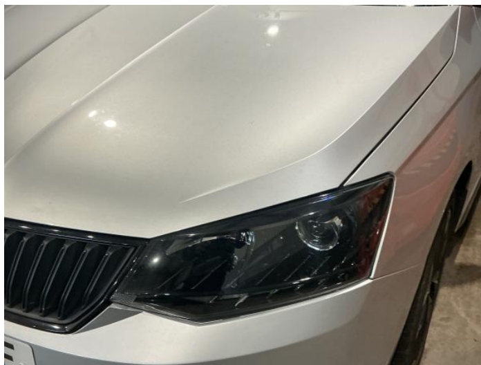
2: Bumper Front Chipped Multiple Chips