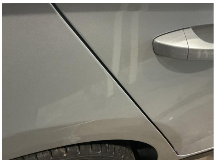
14: Qtr Panel osr Scratched Over 25mm Thru Paint