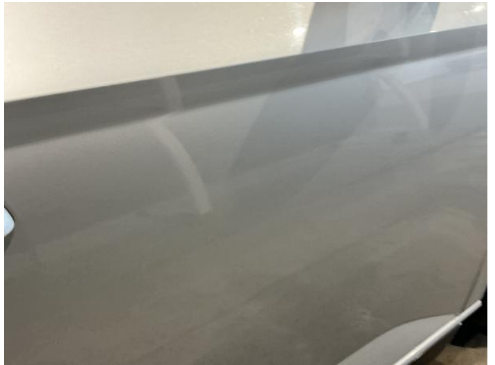
18: Door osf Poor Previous Repair Poor Paint