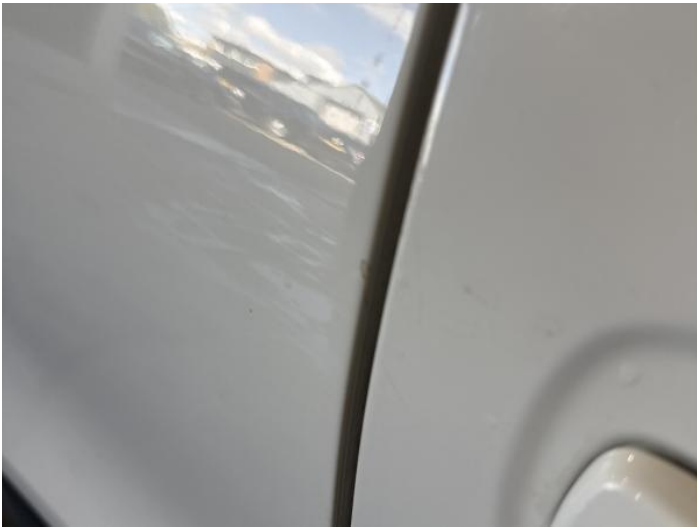
5: Door osr Chipped Edge Chip