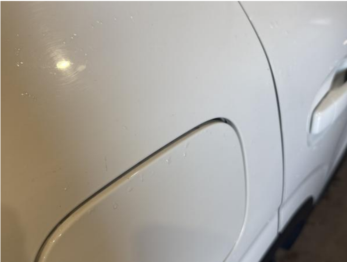
4: Qtr Panel osr Dented 2 Or Less UpTo 10mm