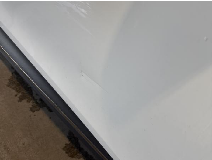
6: Door osf Dented Over 30mm

Carpet Condition Average Seat Condition Average