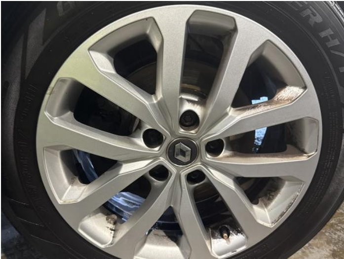
3: Wheel nsf Scratched Up To 50mm